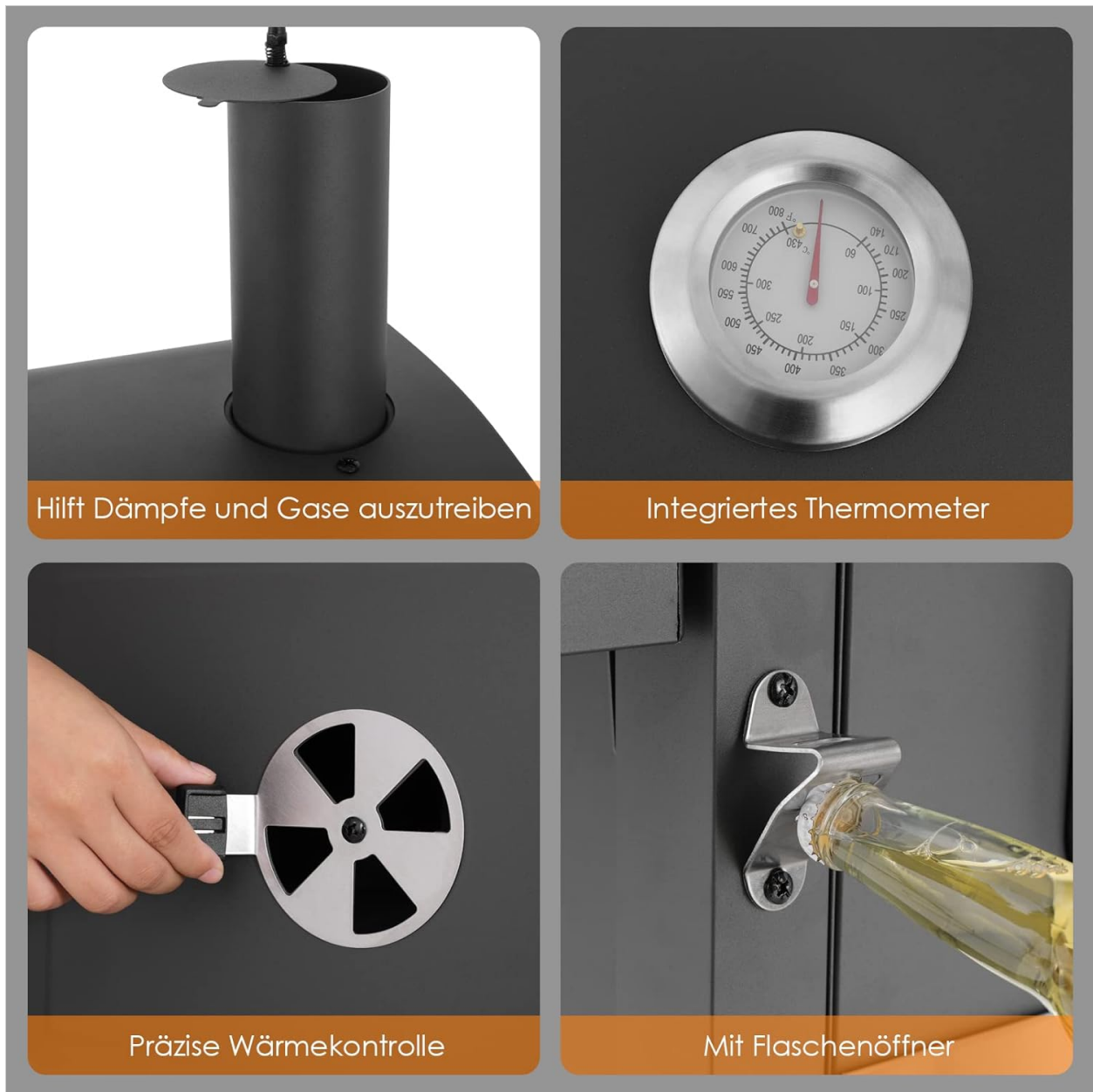
Image 3: Key features including the chimney, integrated thermometer, adjustable air vent, and bottle opener.