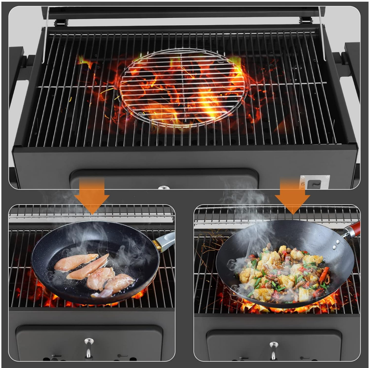
Image 5: Demonstrates versatile cooking options, including direct grilling and indirect cooking with cookware.