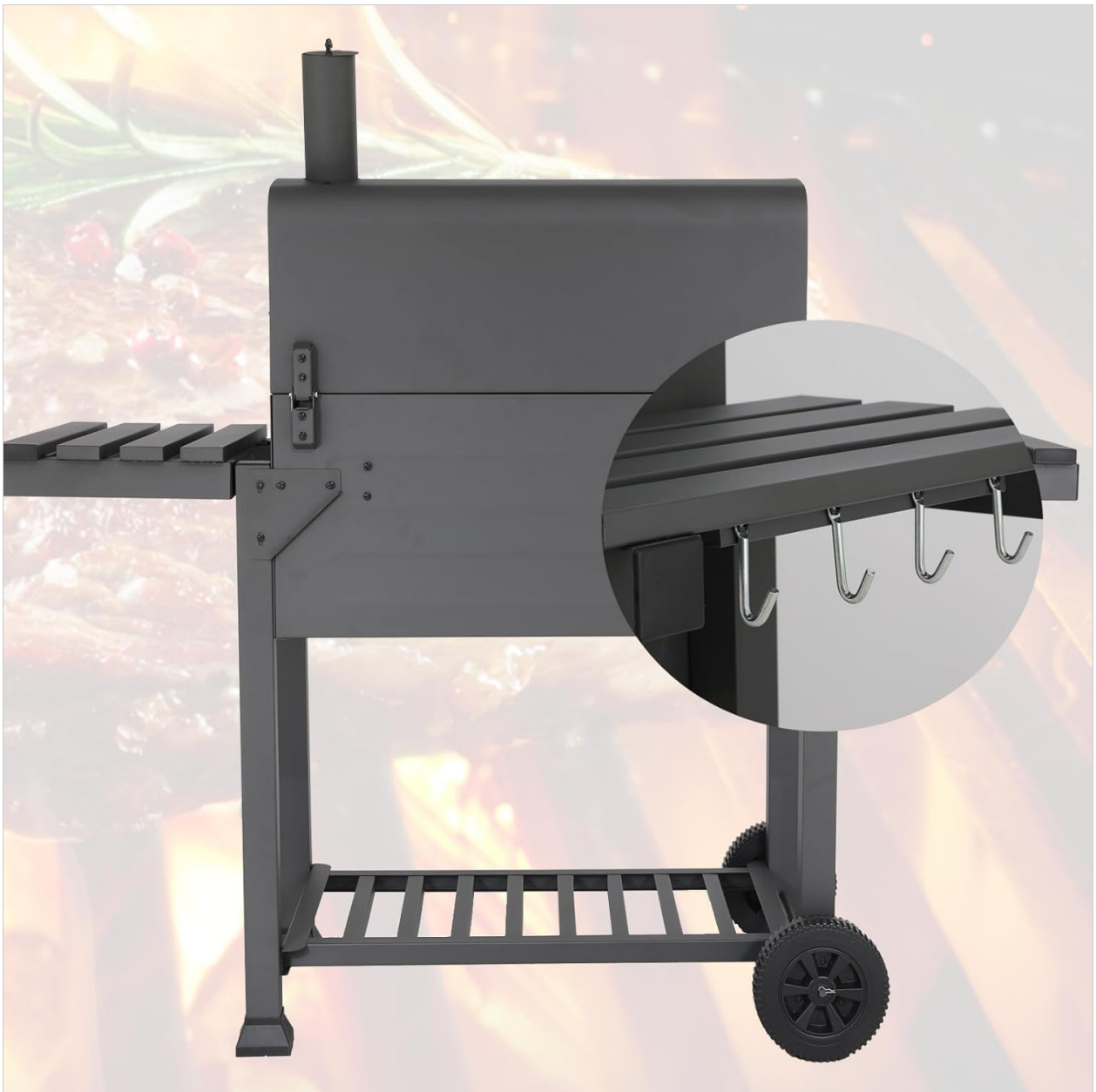
Image 4: Foldable side table with integrated hooks for barbecue tools.