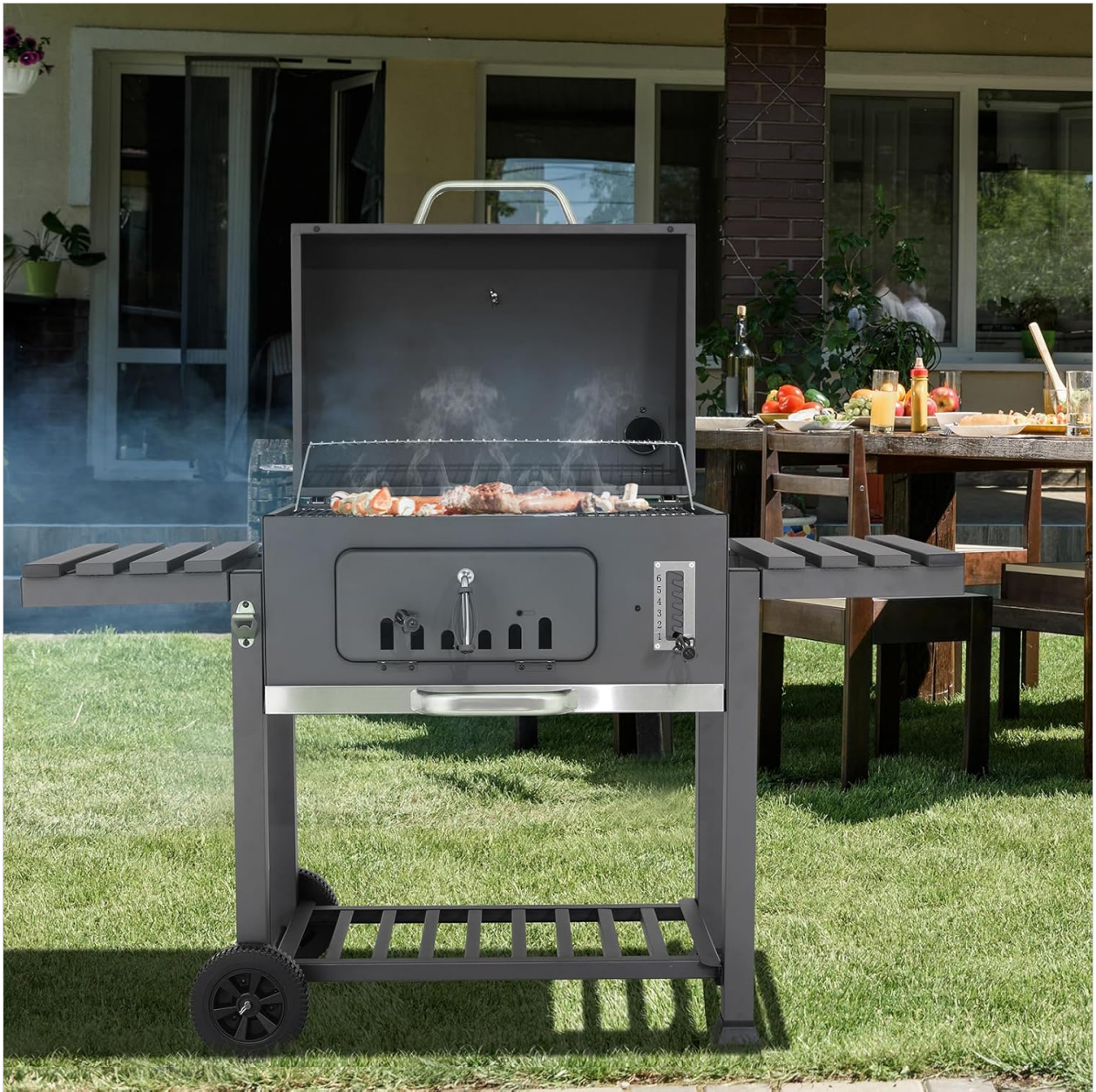
Image 1: Fully assembled TLSUNNY XXL Charcoal Grill in an outdoor setting.