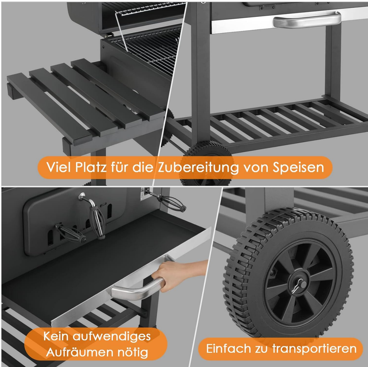
Image 7: Highlights the spacious side tables for food preparation and the convenience of wheels for transport.