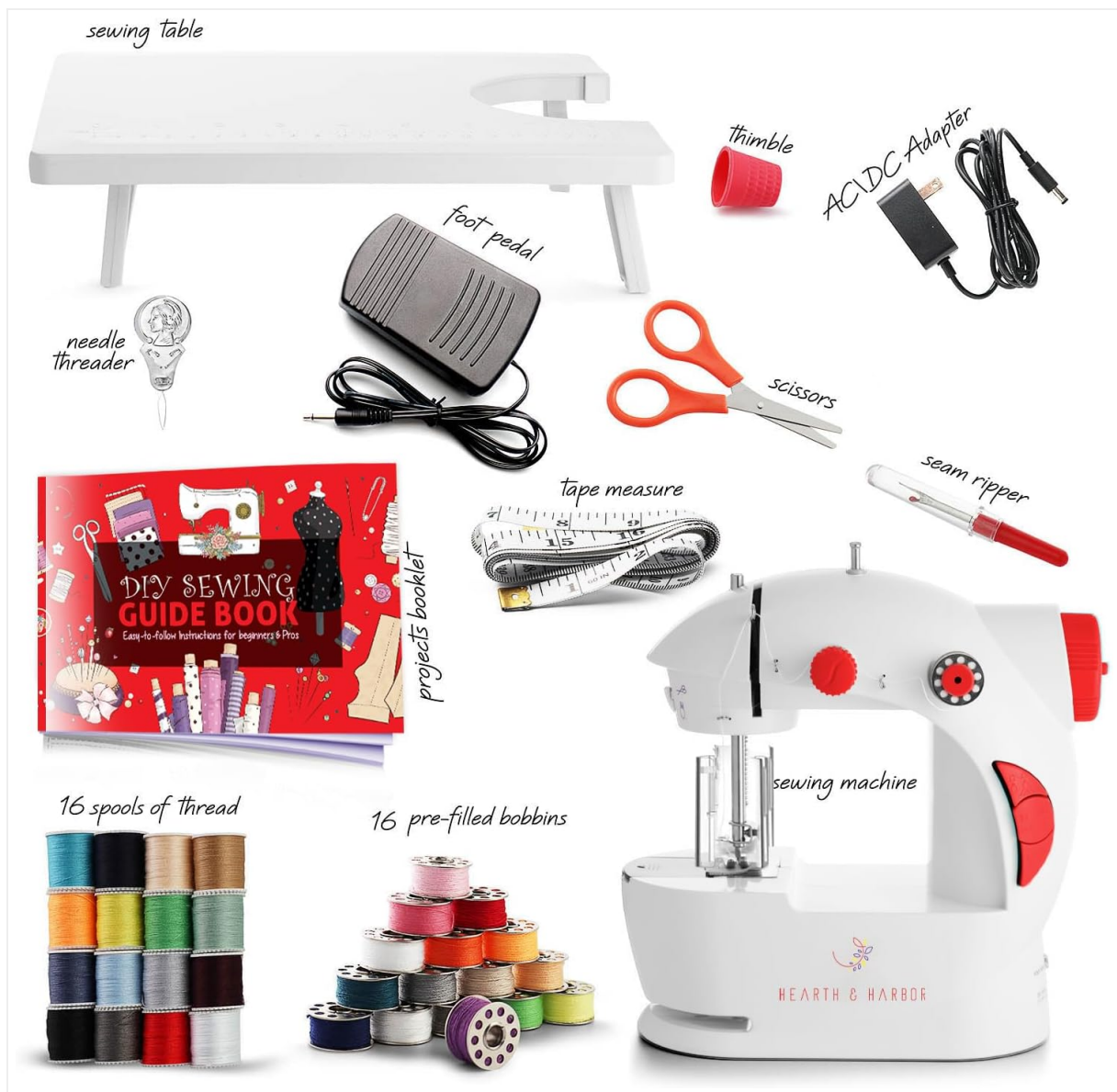
Image: Overview of the Hearth & Harbor Mini Sewing Machine and its complete accessory kit, including bobbins, threads, needles, scissors, and a guide book.