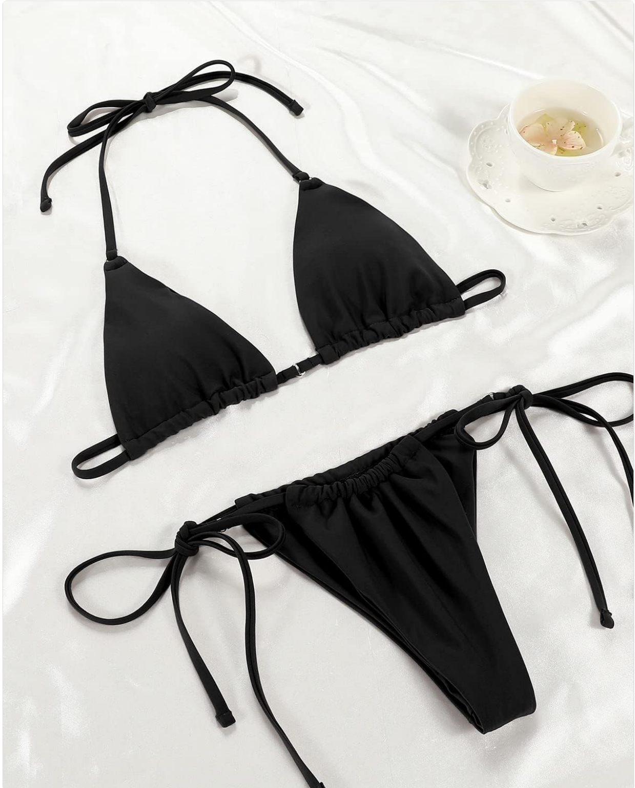
Figure 2: Flat lay of the MIYOUJ Halter String Bikini Set in black, showing the top and bottom.