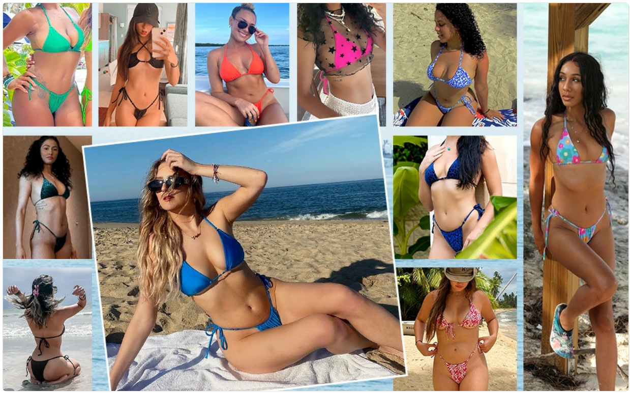
Figure 4: Close-up detail display of the bikini top showing triangle cup, removable padding, and tie bottom.