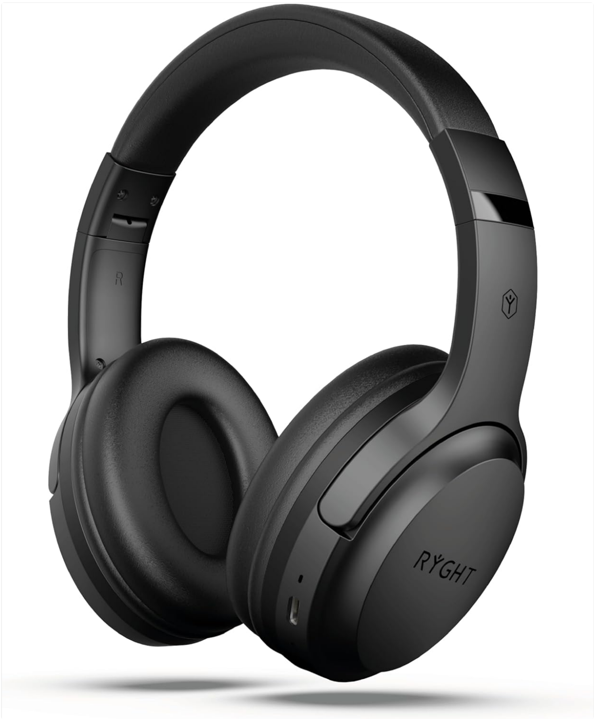
The RYGHY NOIR TEMPO wireless headphones, showcasing their sleek black design and over-ear form factor.