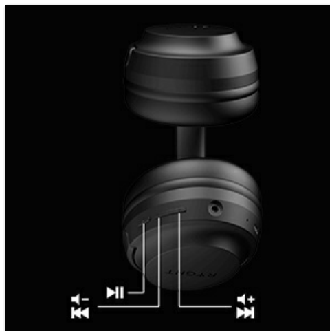
The headphones feature intuitive controls for managing music playback, adjusting volume, and handling calls.