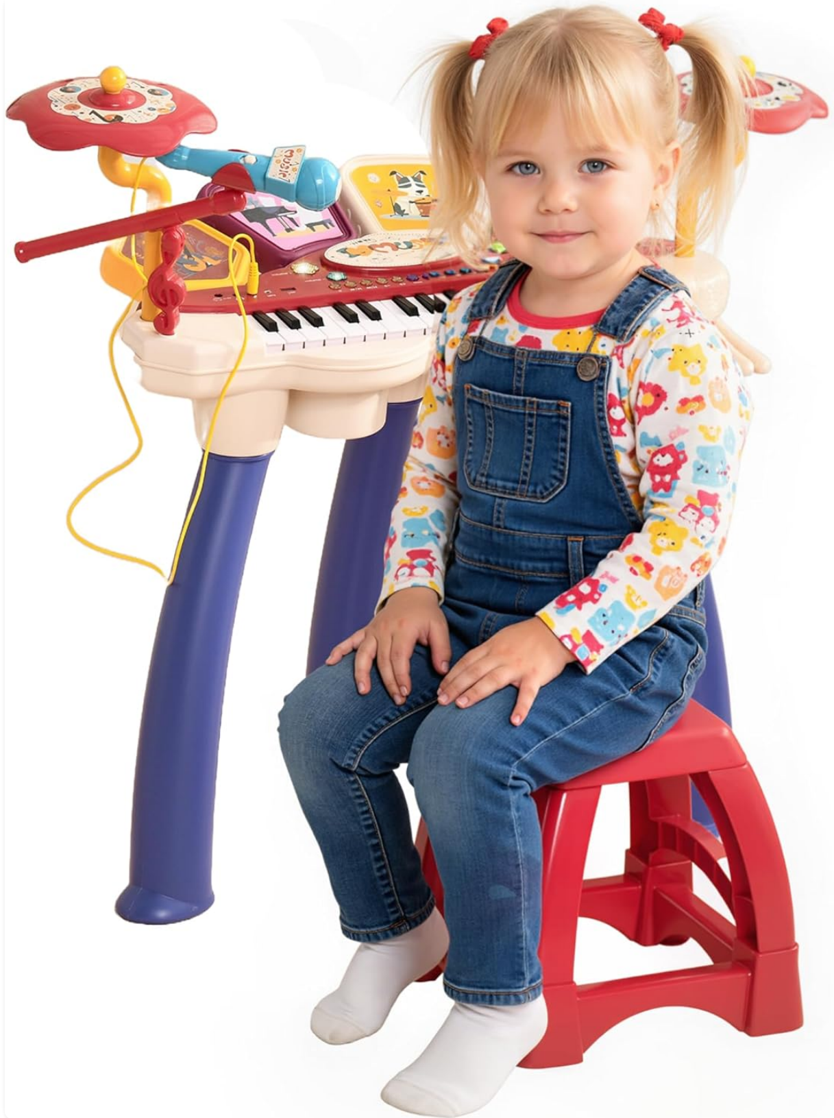
Image 1: A child enjoying the AIYAPLAY Electronic Piano and Drum Set.