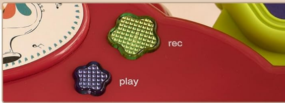
Enregistrement et lecture