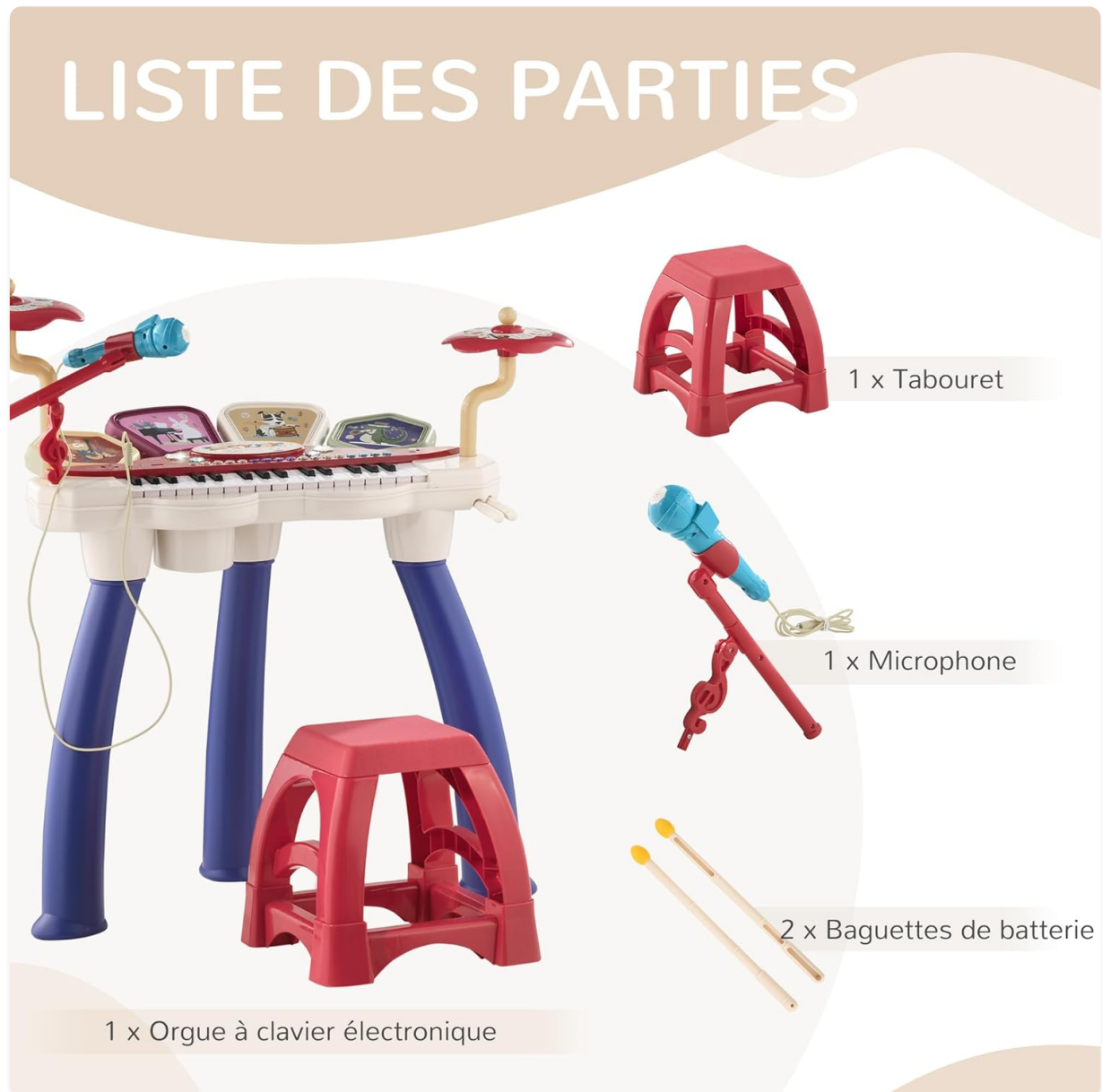
Image 2: Included components of the AIYAPLAY Electronic Piano and Drum Set.