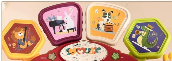
Tambour et cymbale