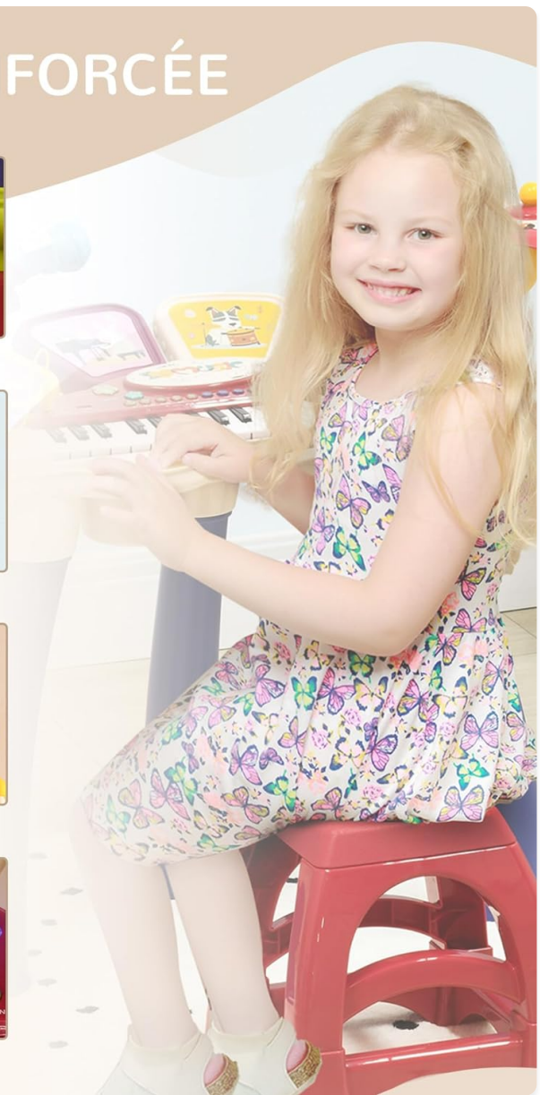
Image 5: Interactive features including recording, microphone, and drum elements.