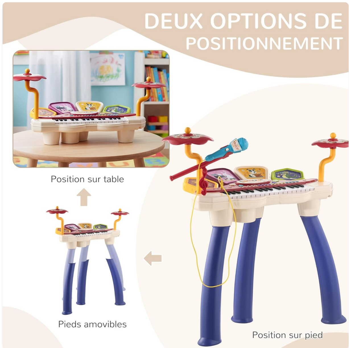
Image 3: The electronic piano can be used on its stand or as a tabletop unit by detaching the legs.