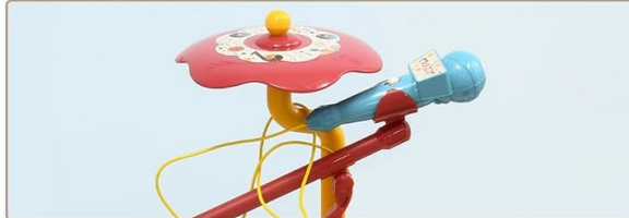
Microphone avec amplification