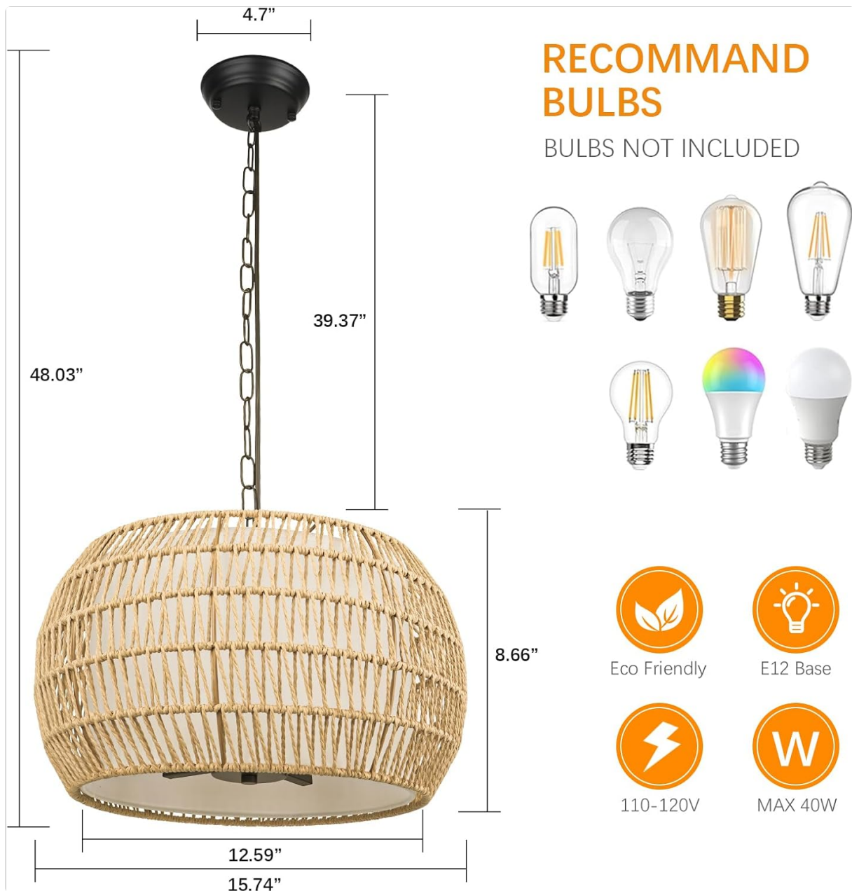
Figure 4.1: Detailed view of chandelier components including rattan, canopy, and bulb sockets.