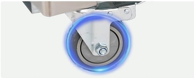
Lockable Swivel Casters