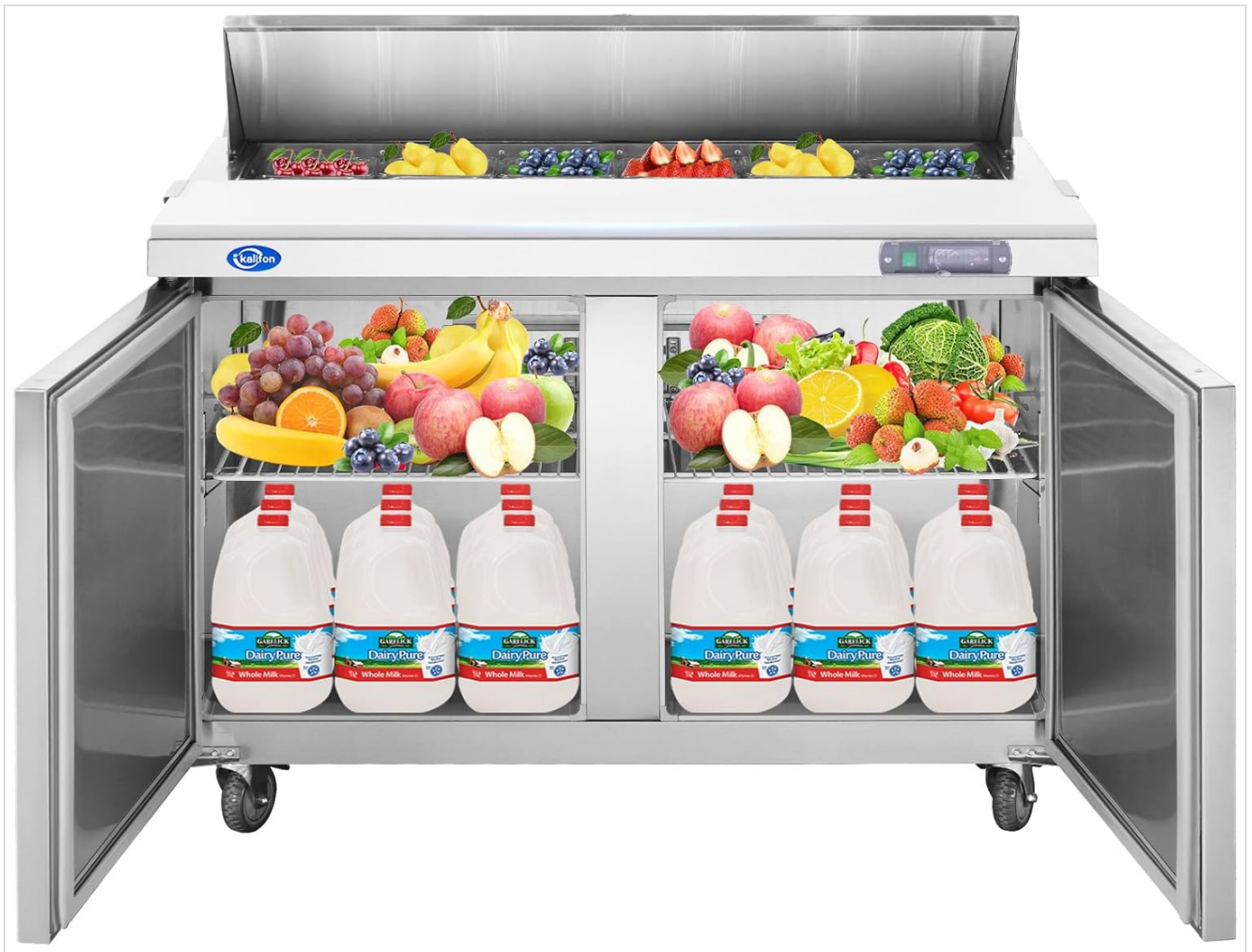
Image: Interior shelves are adjustable to accommodate various item sizes.