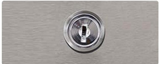
Security Door Lock

Image: Digital temperature control panel for precise temperature management.