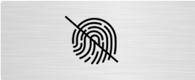
Anti-Fingerprint Stainless Steel