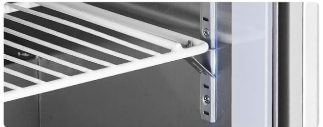
Adjustable Mobile Shelf