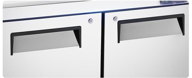
Recessed Door Handle