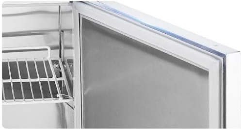
Pvc Sealing Strip

State-Of-The-Art Workmanship Makes It A Durable Unit