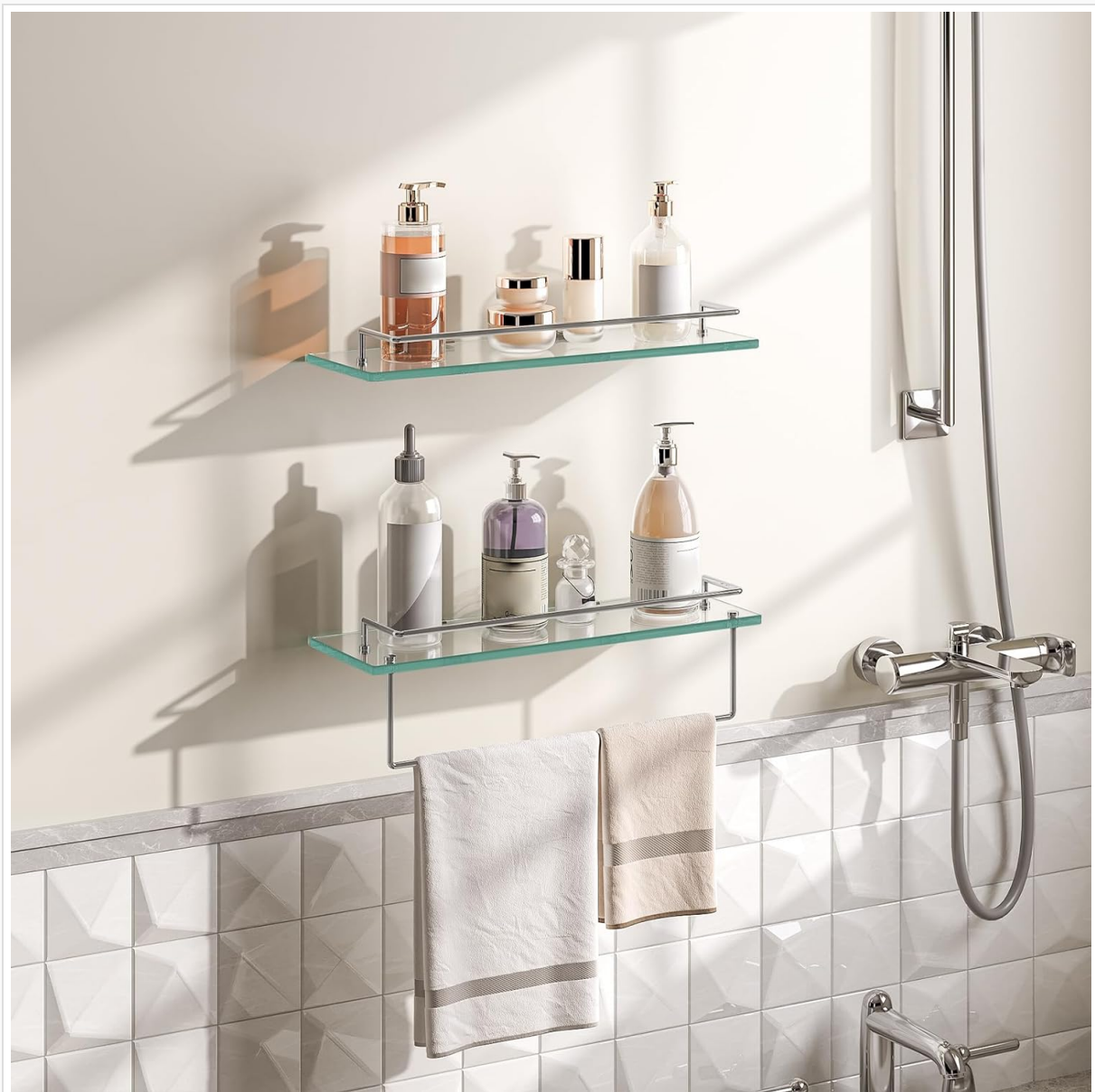
Figure 4.1: Example of Shelves in Use

This image illustrates the HOOBRO glass shelves installed in a bathroom setting, showcasing their practical application for storing various personal care products and small decorative elements. The upper shelf holds items like soap dispensers and small jars, while the lower shelf, equipped with a towel bar,