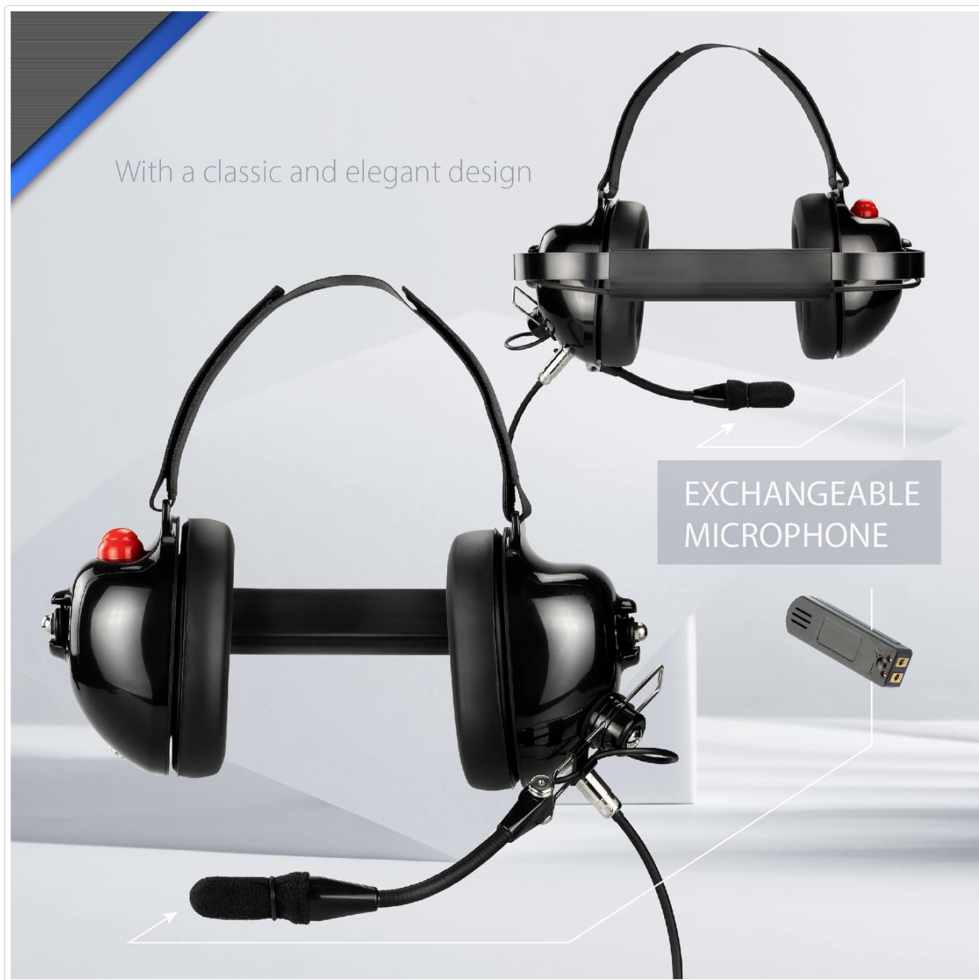
Figure 3: Headset illustrating the exchangeable microphone feature.