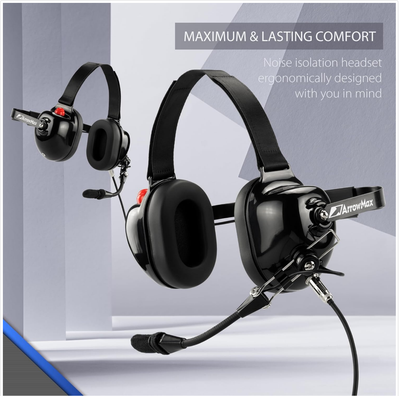
Figure 2: Headset emphasizing its ergonomic design for comfort and noise isolation.

The headset features an ergonomic design for maximum and lasting comfort, even during extended use. The ear pads are high-quality and exchangeable, providing long-lasting comfort and effective noise isolation.