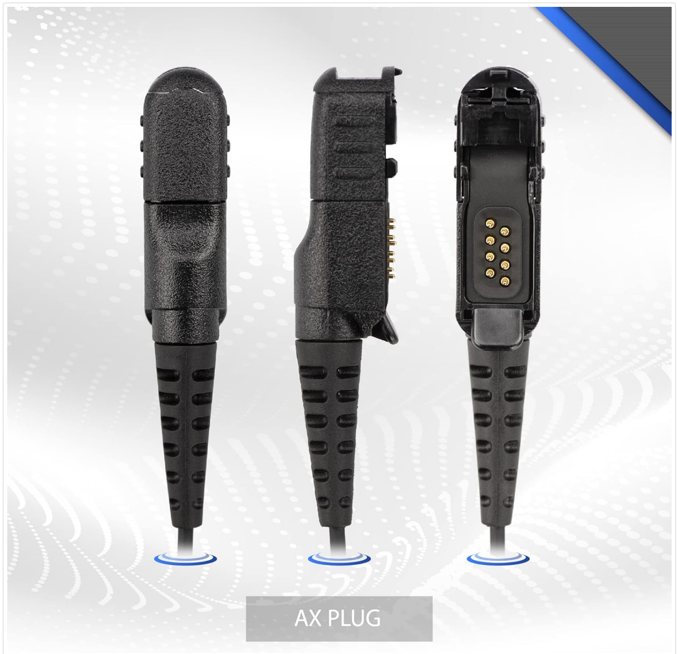
Figure 5: The AX Plug, compatible with various Motorola radio models.