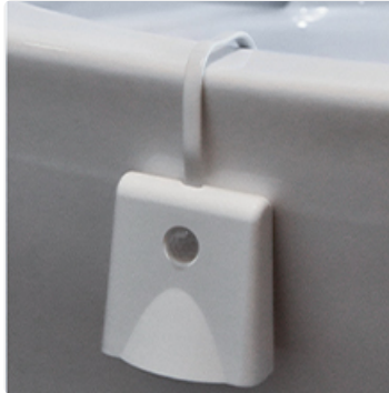
Step 3: Adjust position