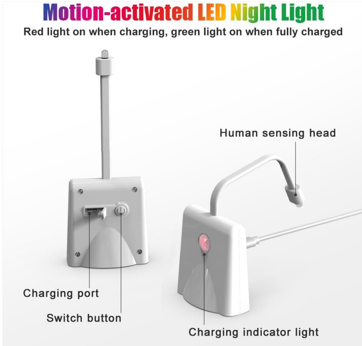
Figure 1: Product Components (Charging Port, Switch Button, Human Sensing Head, Charging Indicator Light)