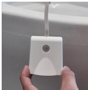
Step 1: Bend the arm