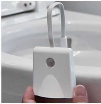
Step 2: Hang on rim