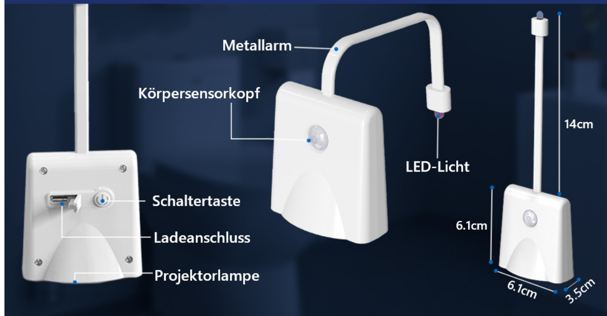
Figure 2: Product Components and Dimensions