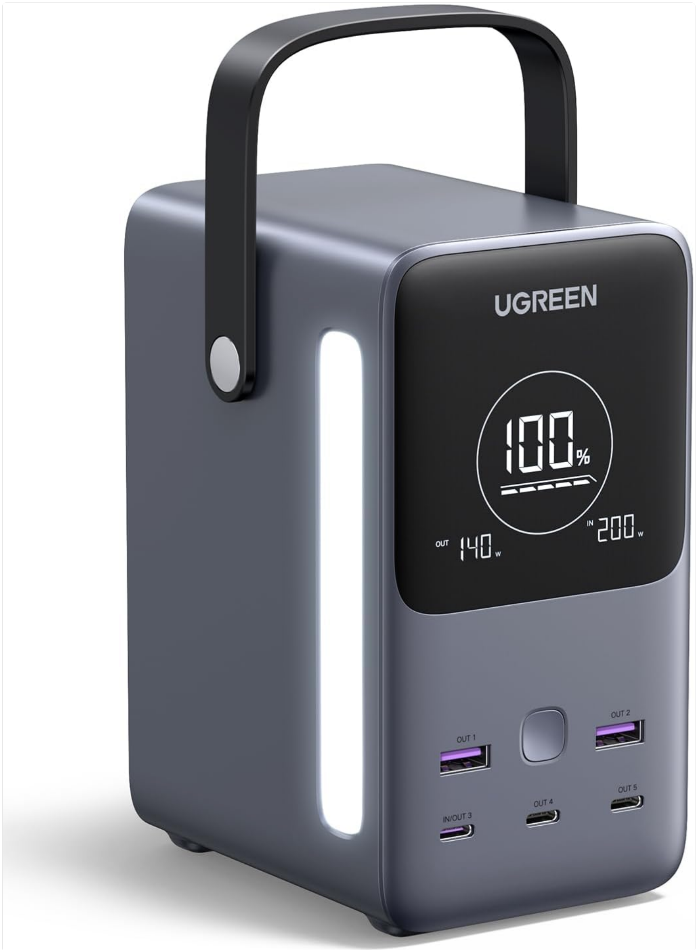
Figure 7: Front View of the Power Bank