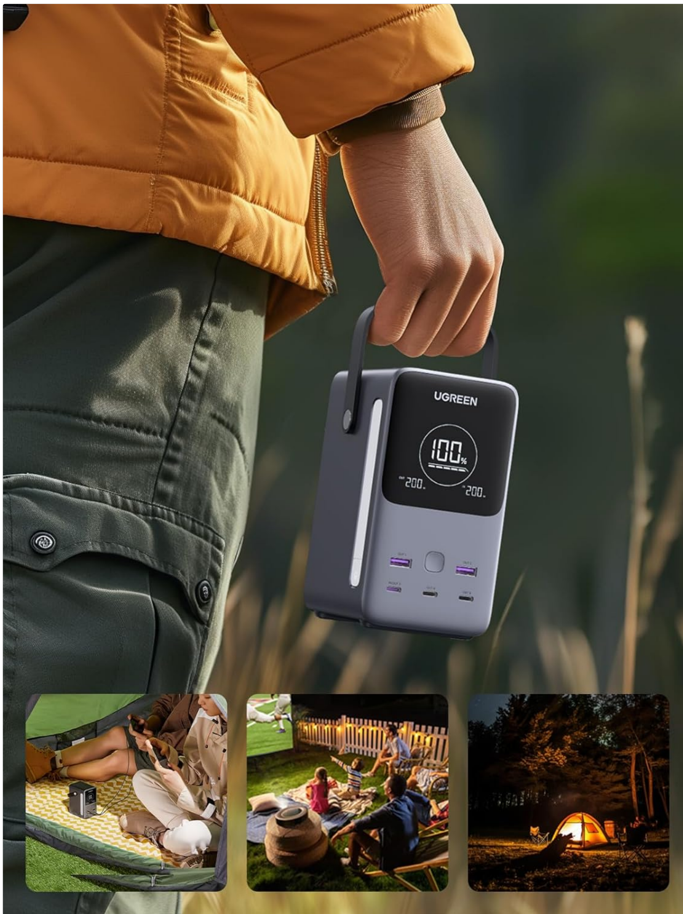
Figure 8: Power Bank LED Light in use