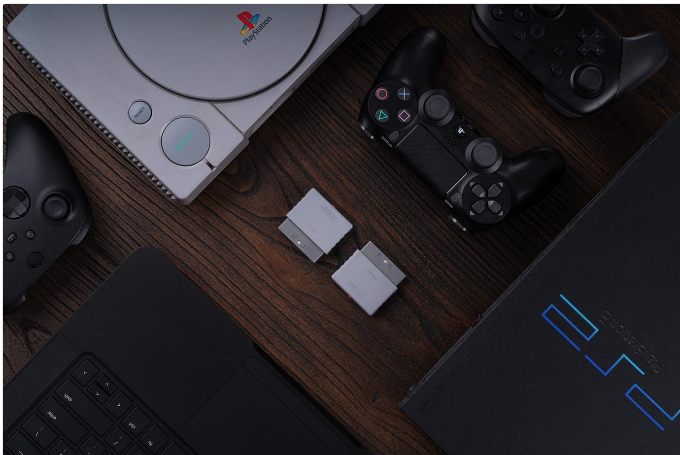
Image: An overhead view displaying the 8Bitdo Retro Adapter alongside a PlayStation 1, PlayStation 2, a laptop, and various modern controllers (Xbox, PlayStation, Switch Pro), illustrating the broad compatibility of the adapter across different systems and controllers.