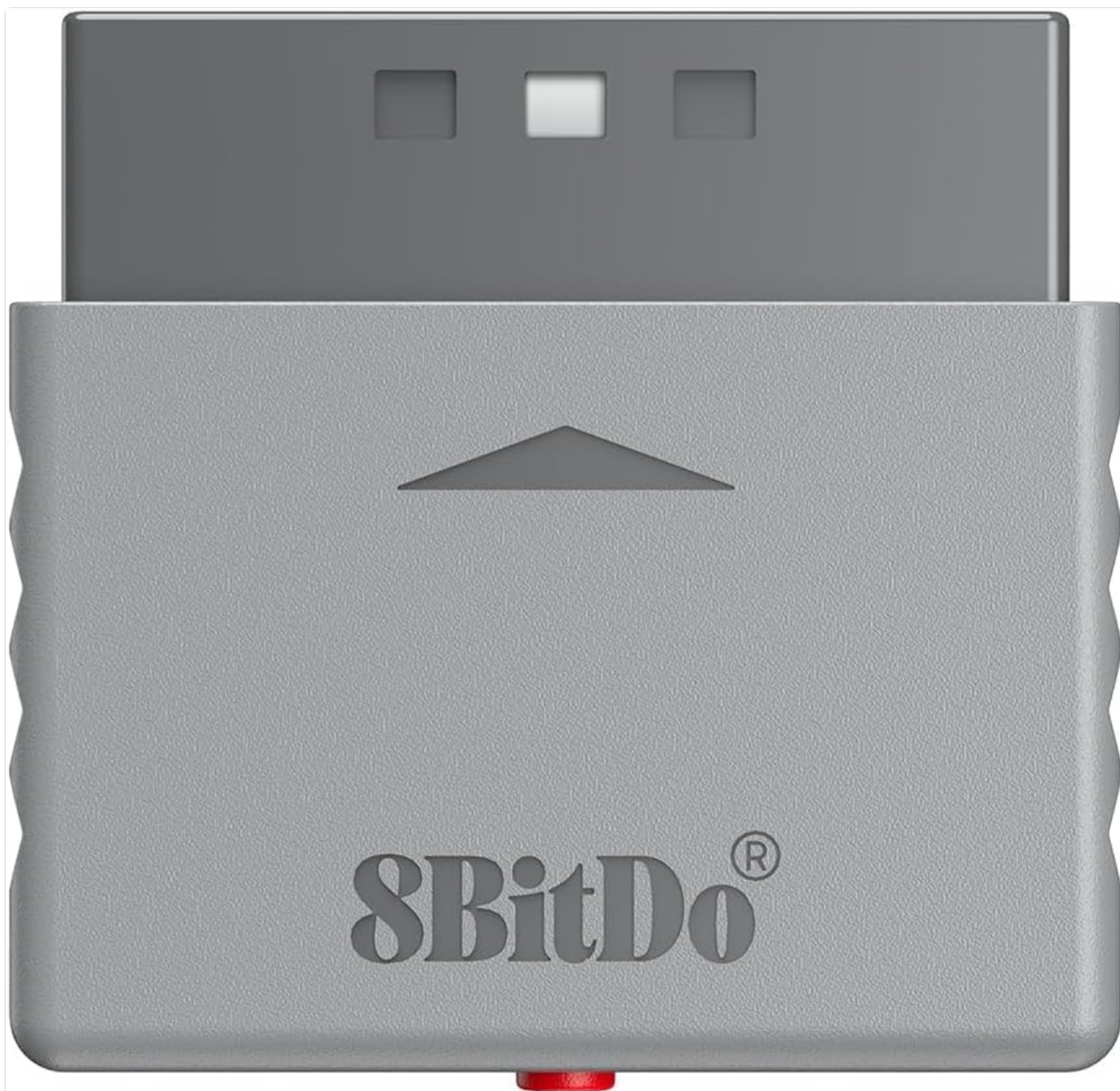
Image: Front view of the 8Bitdo Bluetooth Retro Adapter, showcasing its compact, grey design with the 8BitDo logo and a red button at the bottom.