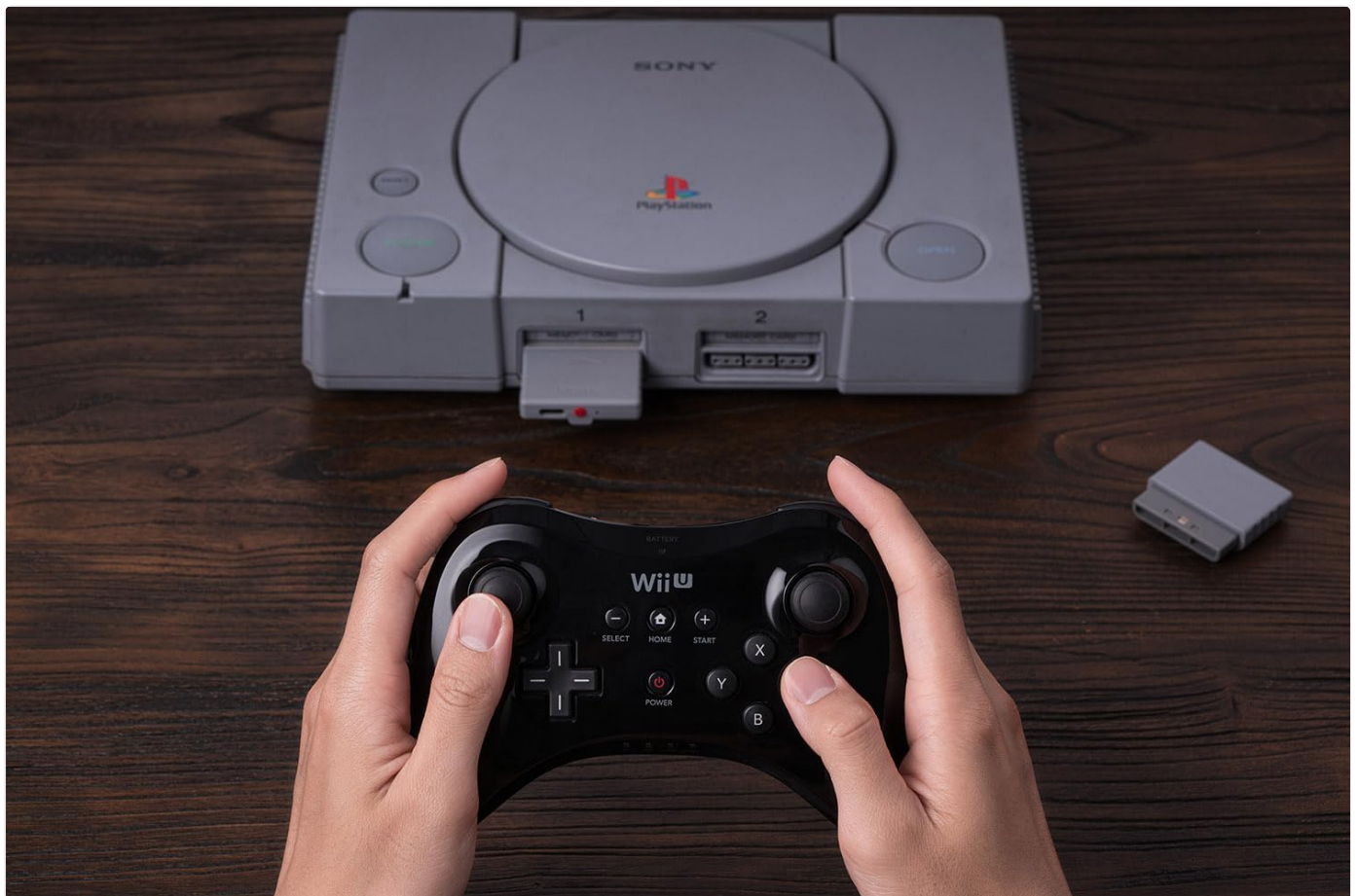
Image: The 8Bitdo Retro Adapter connected to a PlayStation 1 console, showing its compatibility with a Wii U Pro controller for wireless gaming.