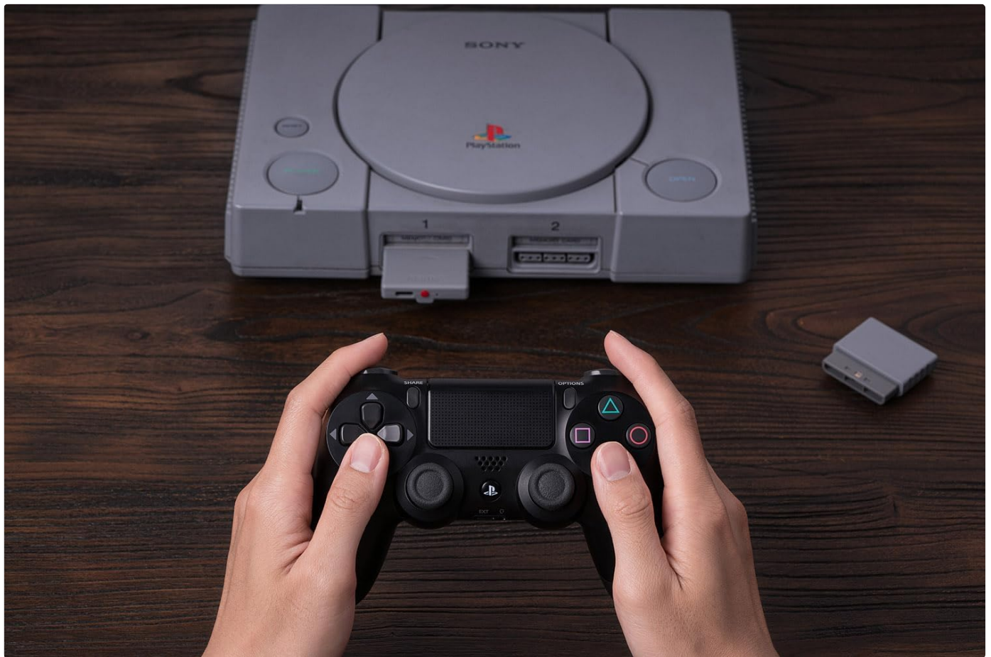
Image: The 8Bitdo Retro Adapter connected to a PlayStation 1 console, demonstrating compatibility with a PS4 DualShock 4 controller for wireless gameplay.