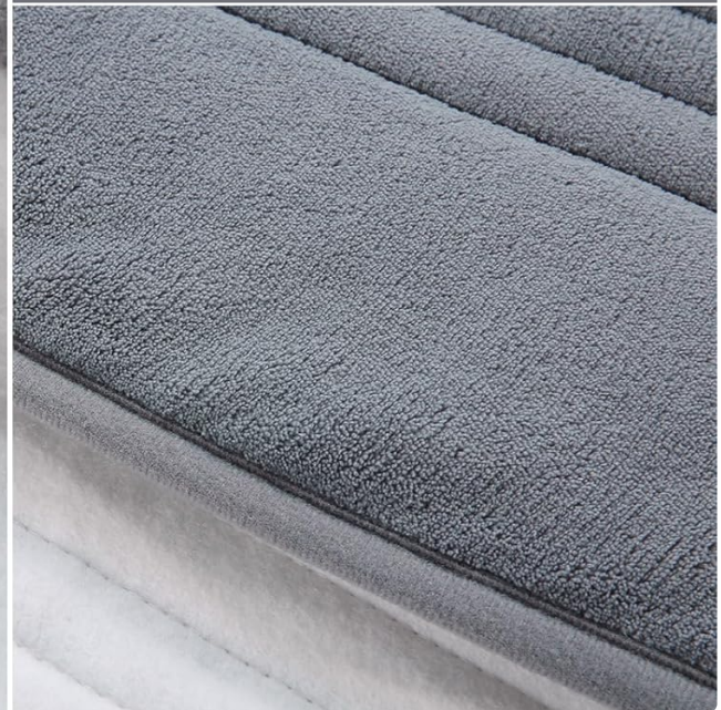
Image: A detailed view of the soft coral fleece material used for the mattress topper, emphasizing its plush and skin-friendly texture.