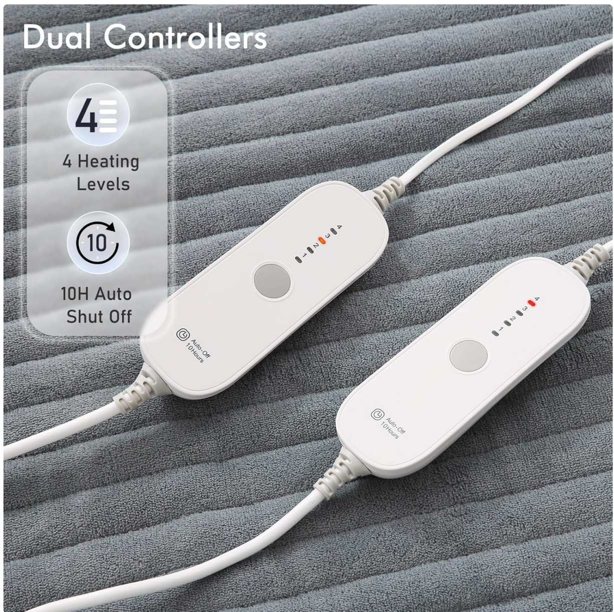
Image: Two independent controllers for the CURECURE heated mattress topper, each with controls for heating levels and auto shut-off.