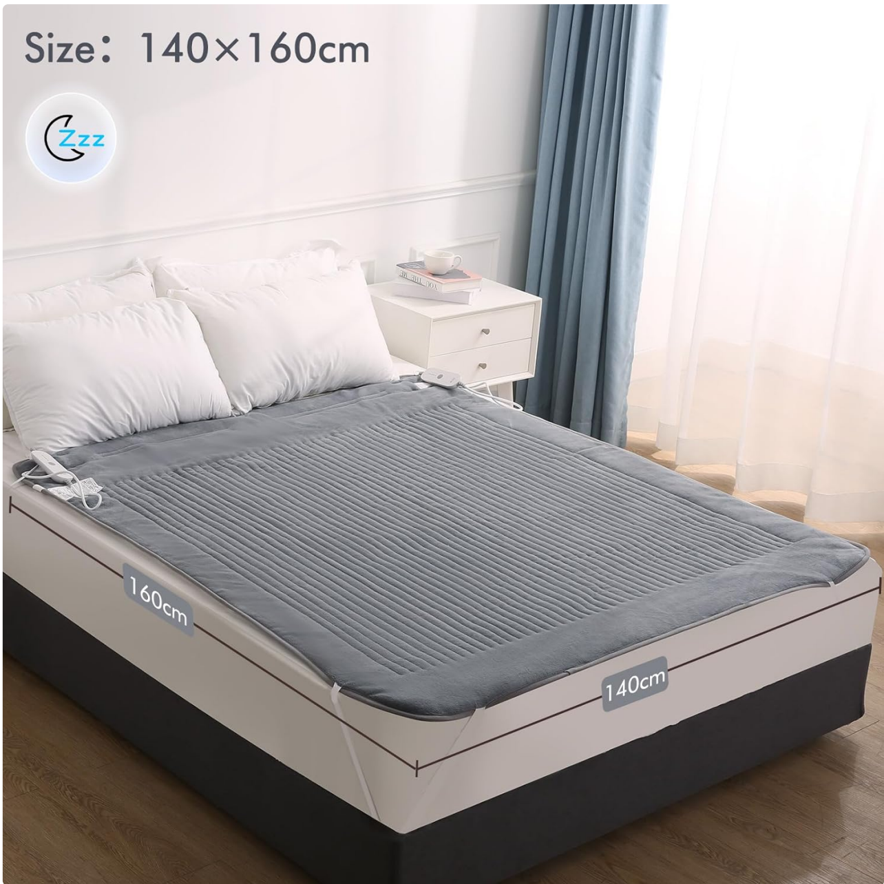
Image: The CURECURE Heated Mattress Topper on a bed, illustrating its dimensions of 140 cm by 160 cm.