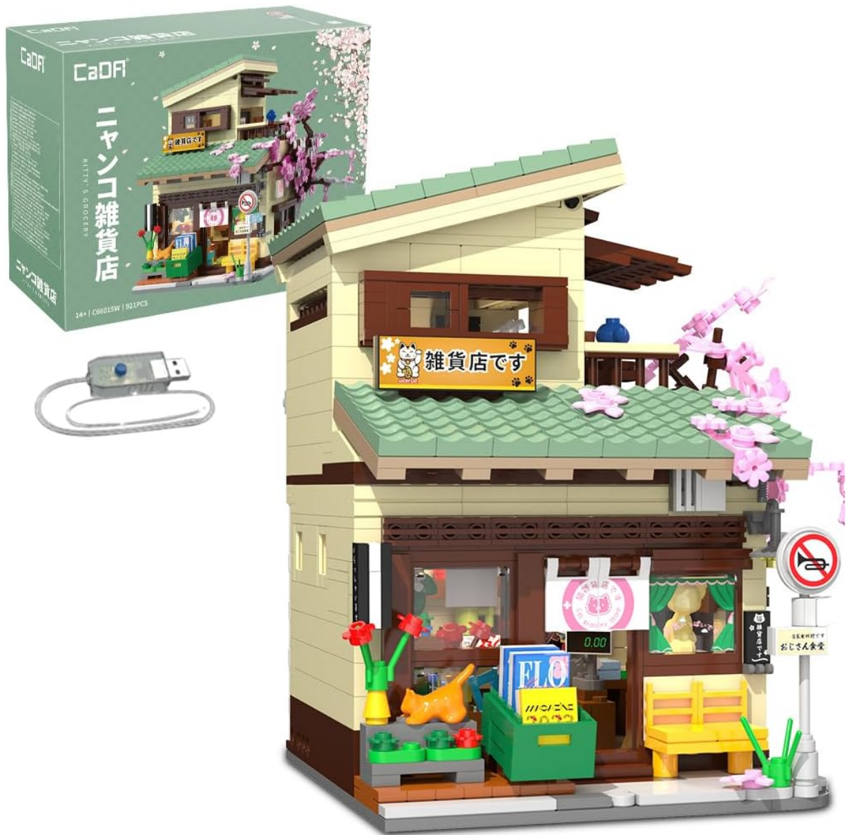
Image: The complete MISINI Japanese Kitty's Grocery Building Block Set, showcasing the assembled model alongside its packaging.