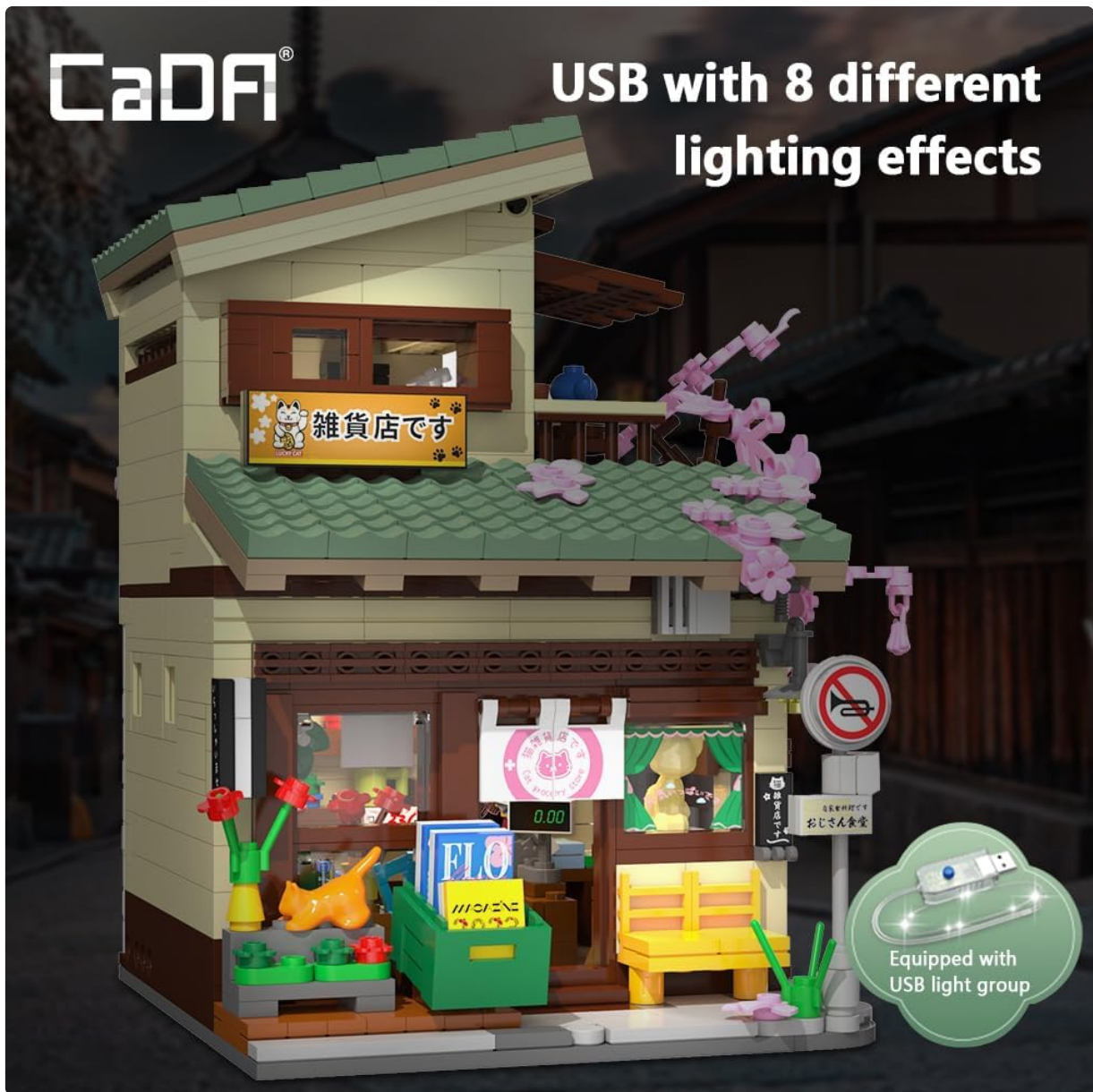
Image: The building block set illuminated at night, showcasing the effect of the integrated lighting kit.

Your browser does not support the video tag.