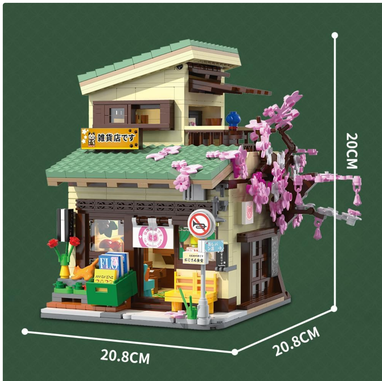
Image: A diagram illustrating the dimensions of the assembled building block set.