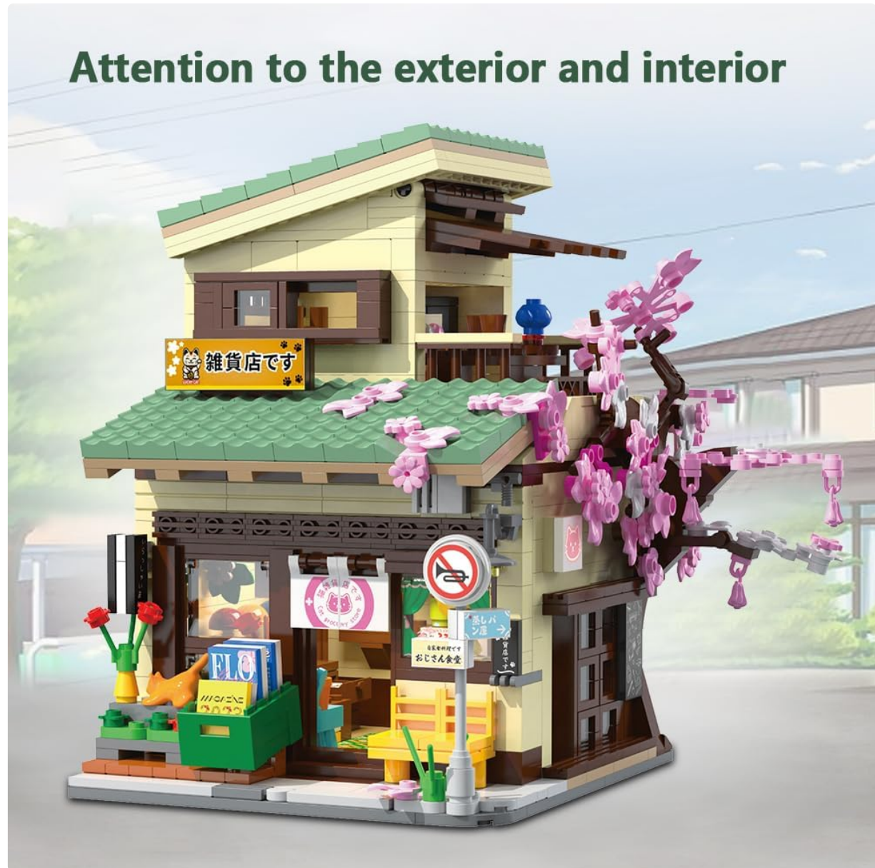
Image: A detailed view highlighting the attention to both exterior and interior design of the building block set.

This modular set can be combined with other CADA Street View Series models (C66007W, C66006W, C66010W, and C66014W) to create a larger Japanese street view city. Ensure proper alignment when connecting multiple modules.