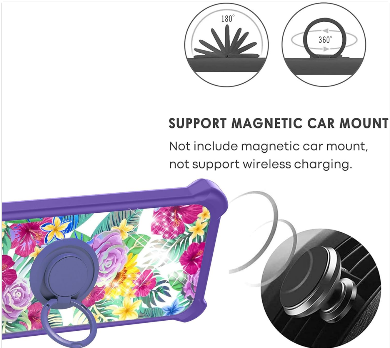
Image 5.1: Demonstrating enhanced one-hand operation and reach with the ring stand.

stand for hands-free viewing in both portrait and landscape orientations. It also provides a secure grip for one-hand operation, reducing the risk of accidental drops.