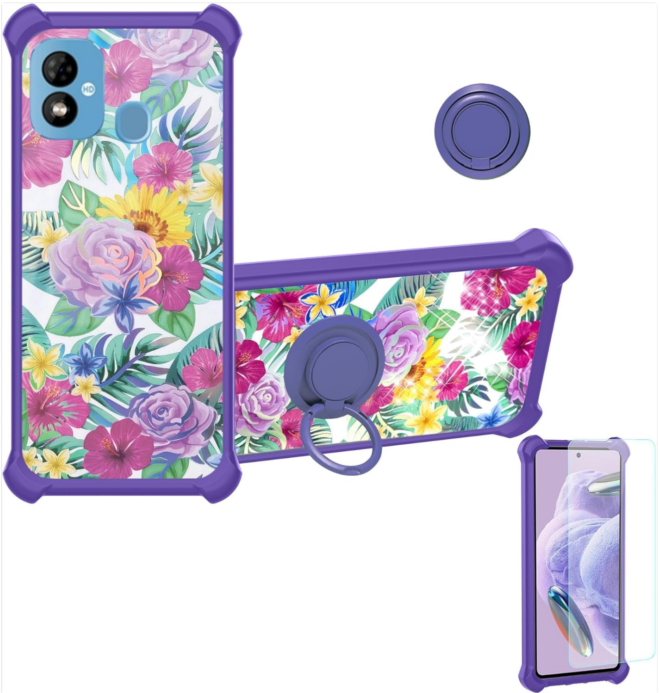
Image 3.1: Overview of the ITEL A33 Plus phone case and included tempered glass screen protector.