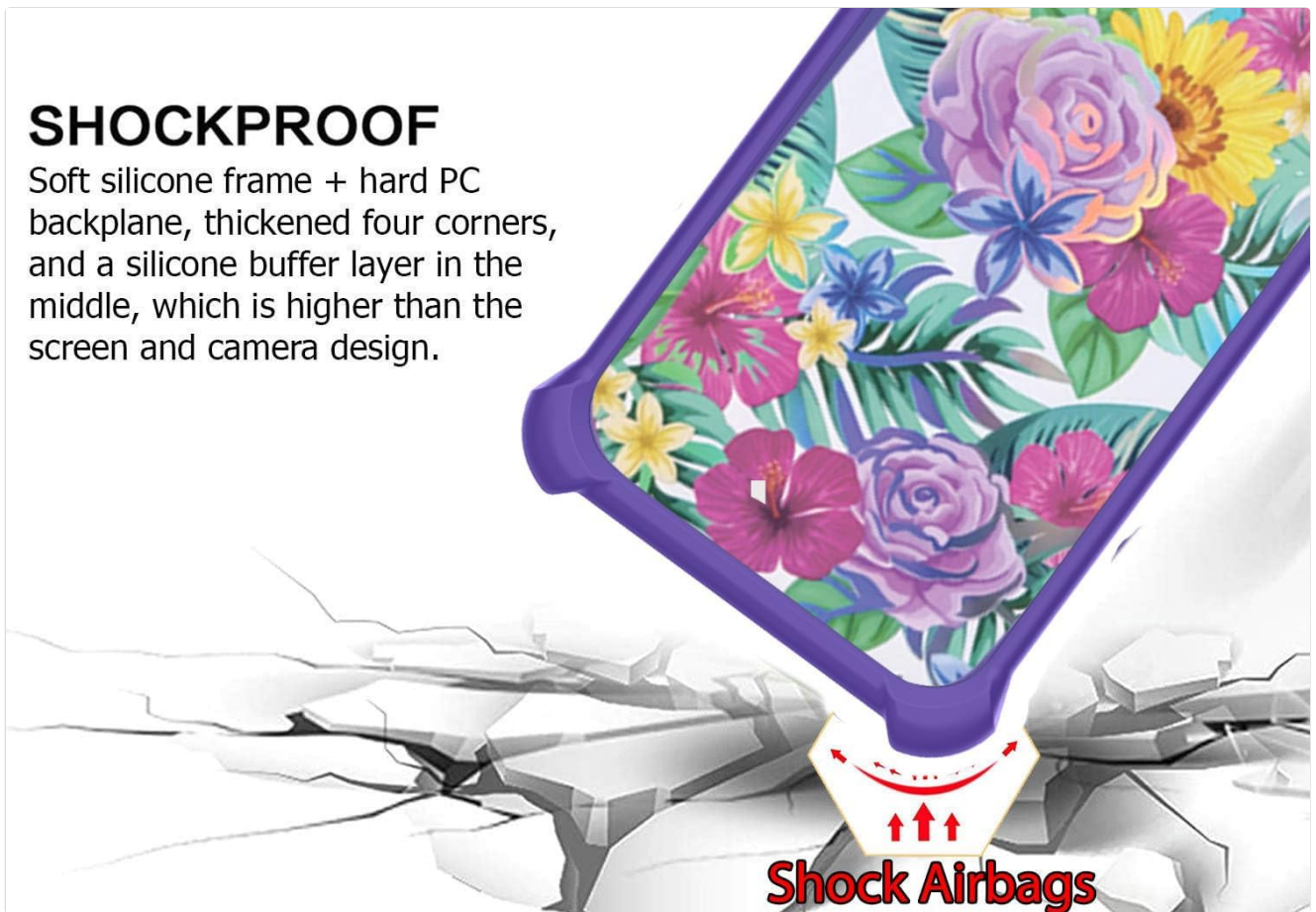
Image 3.2: Illustration of the shockproof design with corner airbags and elevated screen/camera protection.

Soft silicone frame + hard PC backplane, thickened four corners, and a silicone buffer layer in the middle, which is higher than the screen and camera design.