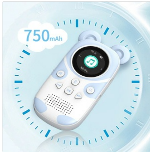
Image: The MP3 player with a clock graphic in the background, emphasizing its 750mAh battery capacity for long usage.