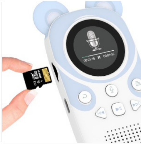
Image: A hand inserting a Micro SD card into the side slot of the MP3 player.