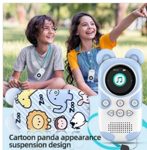
Image: Two children outdoors, one wearing the MP3 player with its lanyard, highlighting the cartoon panda design and portability.

Activate the pedometer function to track steps. Ensure the device is carried securely (e.g., using the lanyard) for accurate readings.