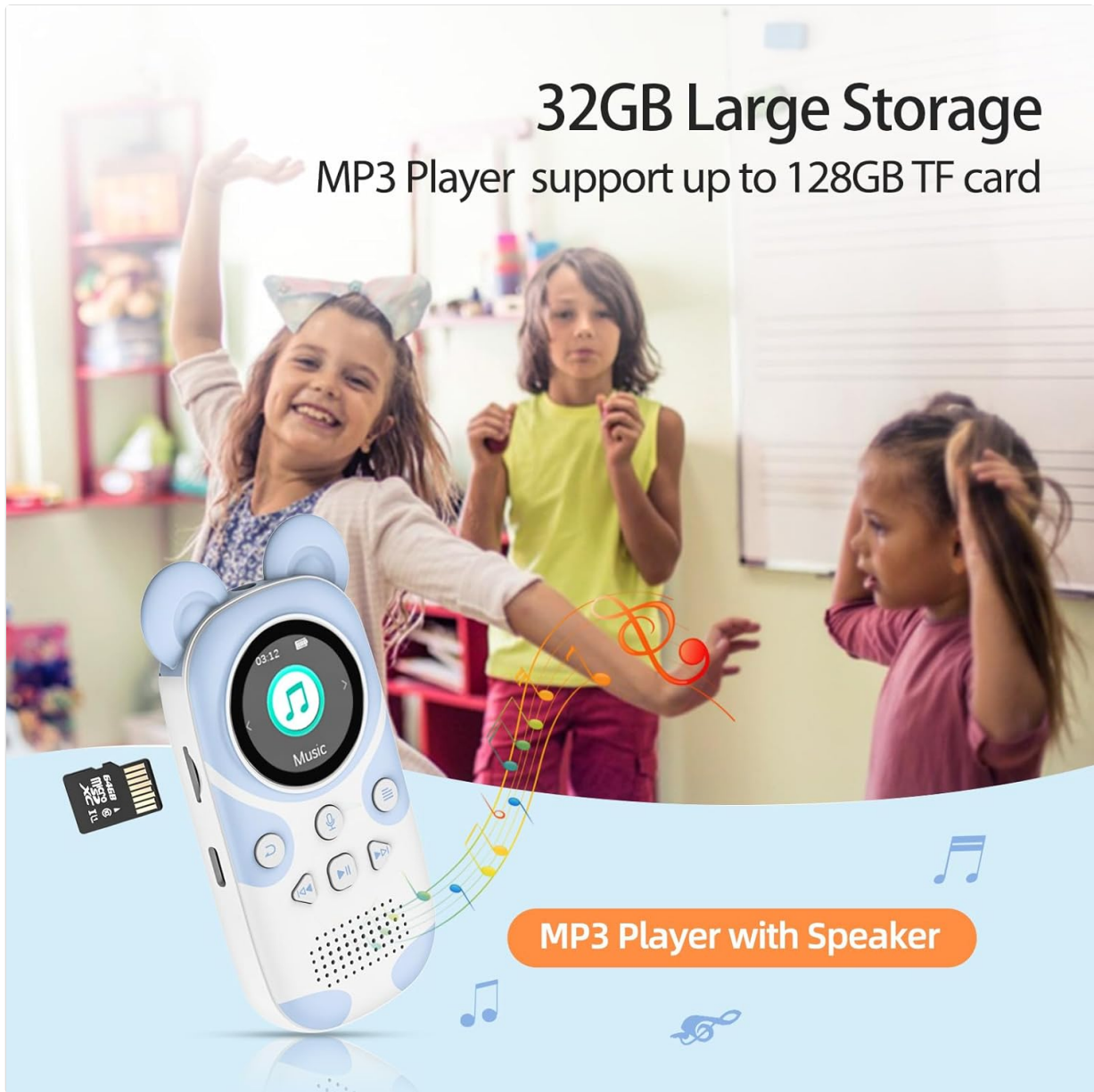
Image: The MP3 player displaying music playback, highlighting its built-in speaker and 32GB internal storage, expandable to 128GB.