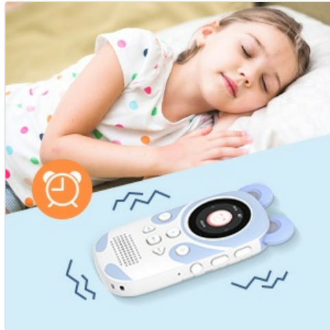
Image: The MP3 player next to a sleeping child, indicating the alarm clock feature.

Set an alarm time through the "Alarm Clock" menu. You can choose a specific sound or music file to wake up to.