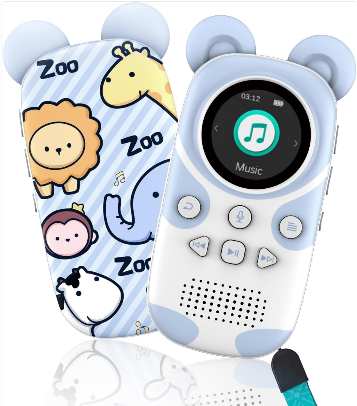
Image: Front view of the MP3 player showing the screen and control buttons, and the back view with animal illustrations.