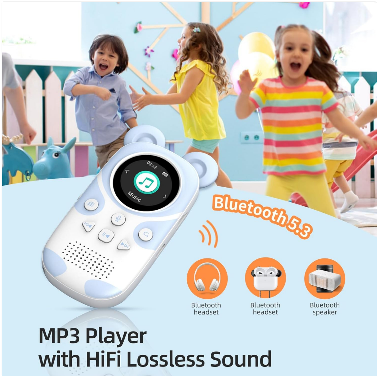
Image: The MP3 player with icons representing Bluetooth headset and speaker connections, emphasizing Bluetooth 5.3 and HiFi Lossless Sound.