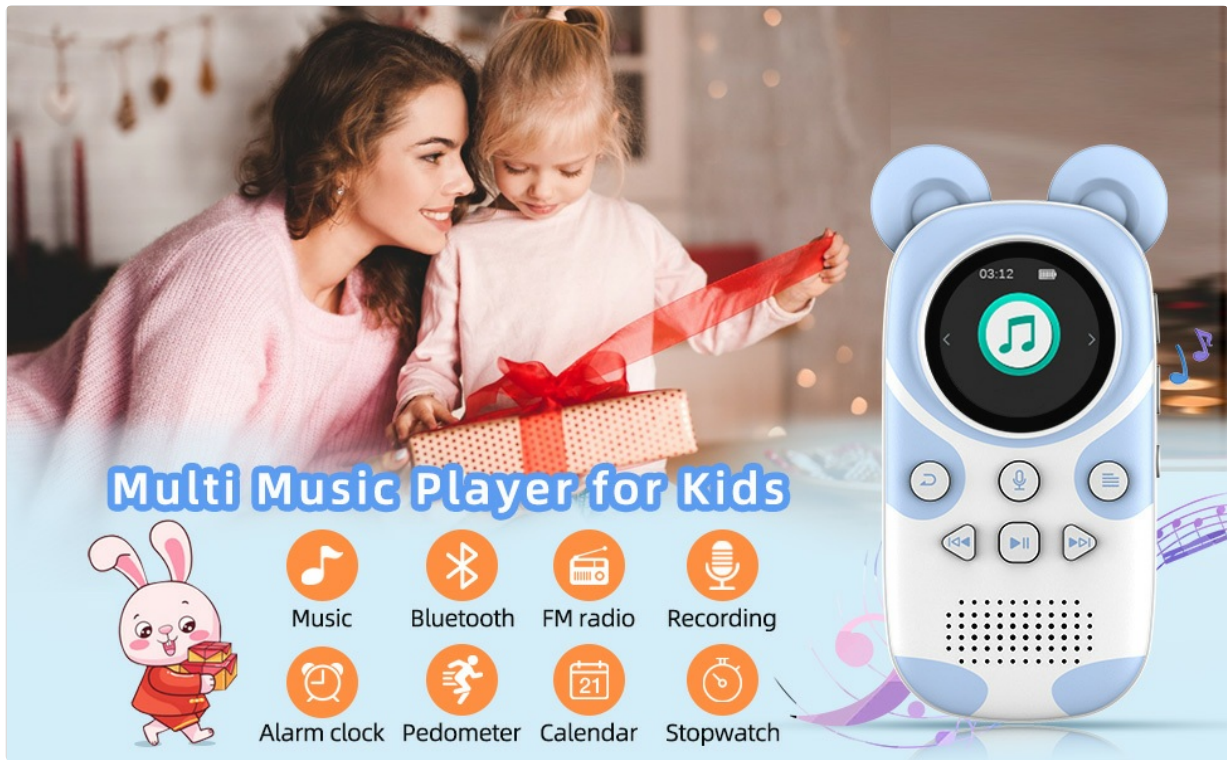
Image: An overview of the MP3 player's functions including Music, Bluetooth, FM Radio, Recording, Alarm Clock, Pedometer, Calendar, and Stopwatch.