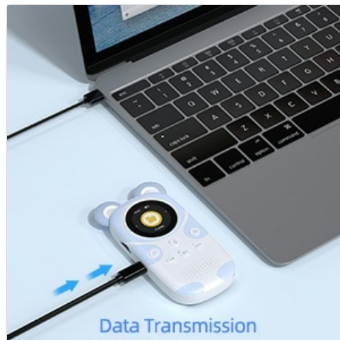
Image: The MP3 player connected via a Type-C USB cable to a laptop, illustrating data transmission and charging.

Before first use, fully charge the MP3 player. Connect the provided Type-C USB cable to the player's charging port and the other end to a USB power adapter (not included) or a computer's USB port.