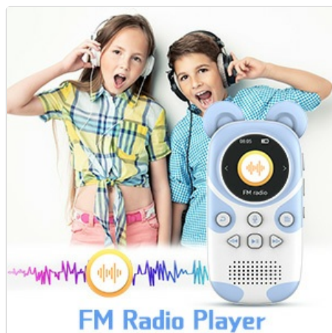
Image: The MP3 player displaying the FM Radio interface, with two children listening to music.

Plug in the earphones (they act as an antenna). Navigate to the FM Radio function. You can auto-scan for stations or manually tune to a frequency.