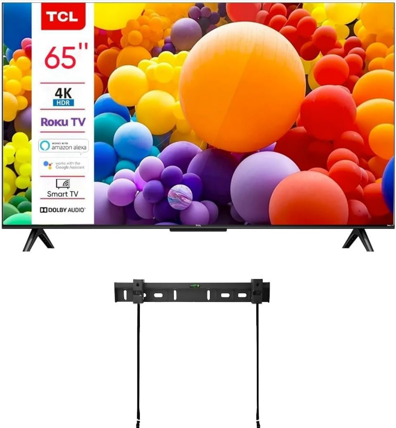
Image: Front view of the TCL 65-inch 4K UHD HDR Smart Roku TV, showcasing its slim bezels and the included wall mount kit.