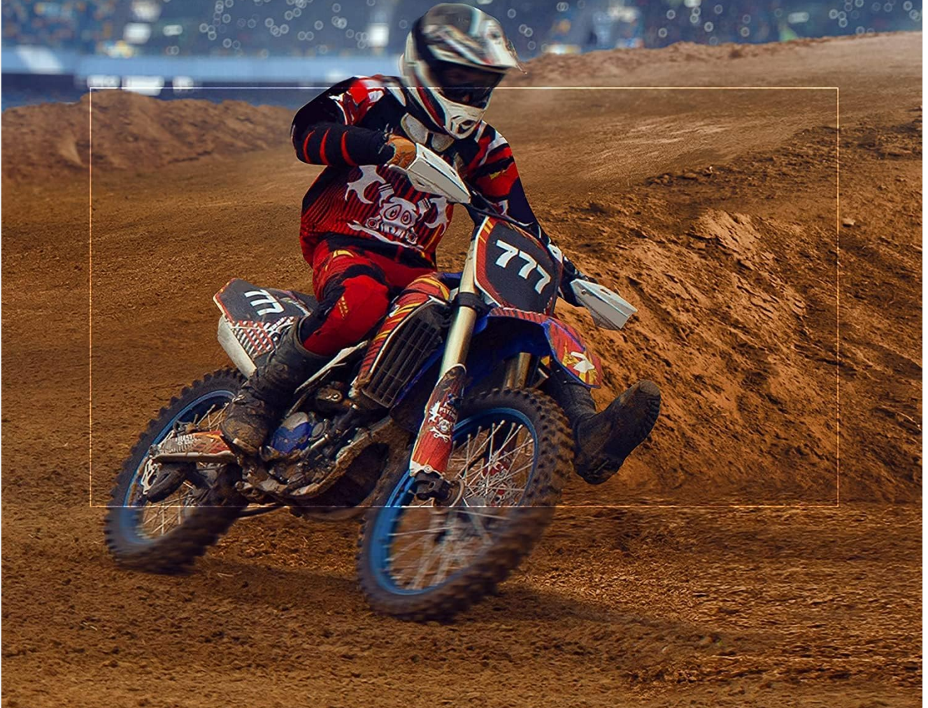
Image: A dynamic shot of a motocross rider, used to demonstrate the Motion Rate 240 with MEMC Frame Insertion technology for smooth action.