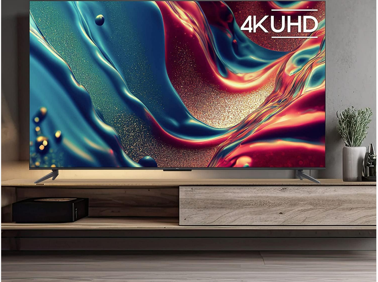
Image: A television screen showcasing a high-resolution image, emphasizing the 4K Ultra HD capability of the display.