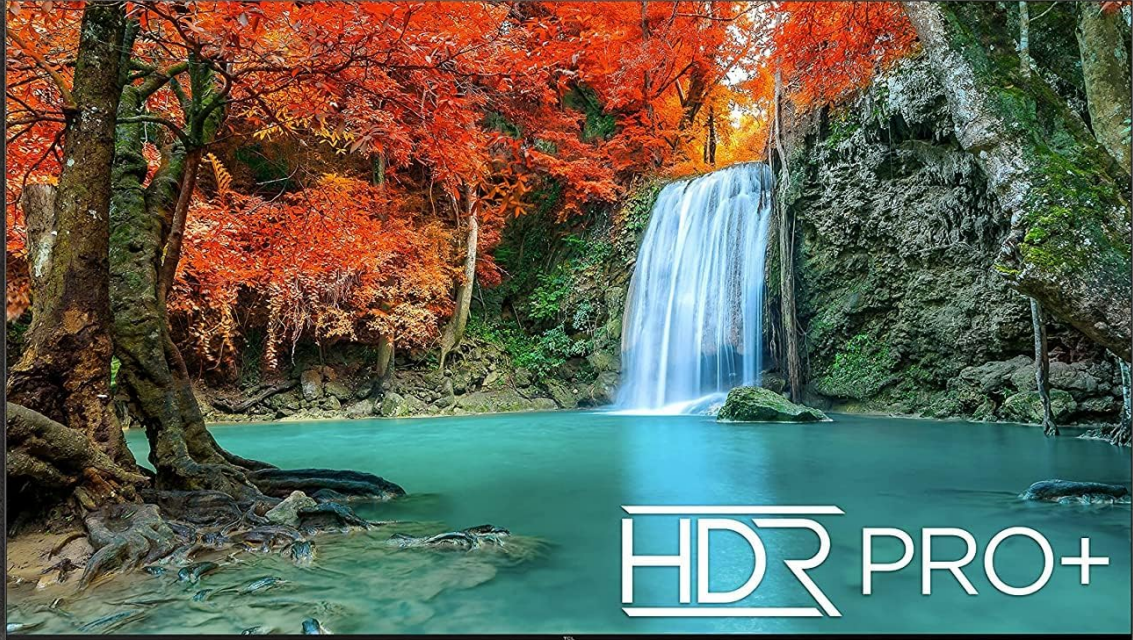
Image: A television screen displaying a high dynamic range (HDR) image of a natural landscape, illustrating the HDR PRO+ feature.