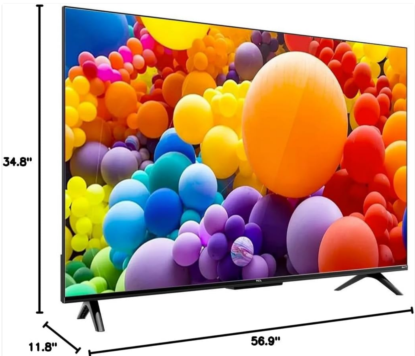
Image: A visual representation of the television's dimensions, indicating its height, width, and depth for placement planning.