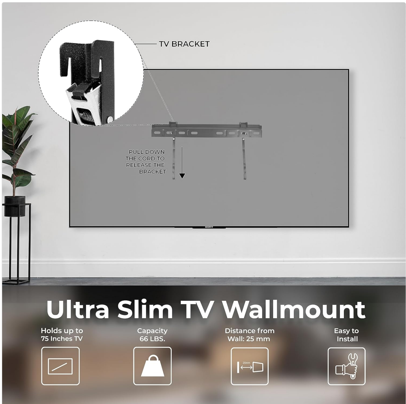
Image: An illustrative diagram demonstrating the installation process for an ultra-slim TV wall mount, highlighting the mechanism to release the TV from the bracket.