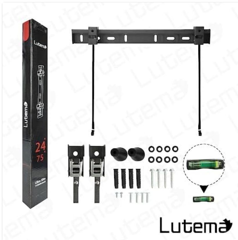
Image: A detailed view of the wall mount kit components, including the bracket, various screws, anchors, and a small spirit level for installation.