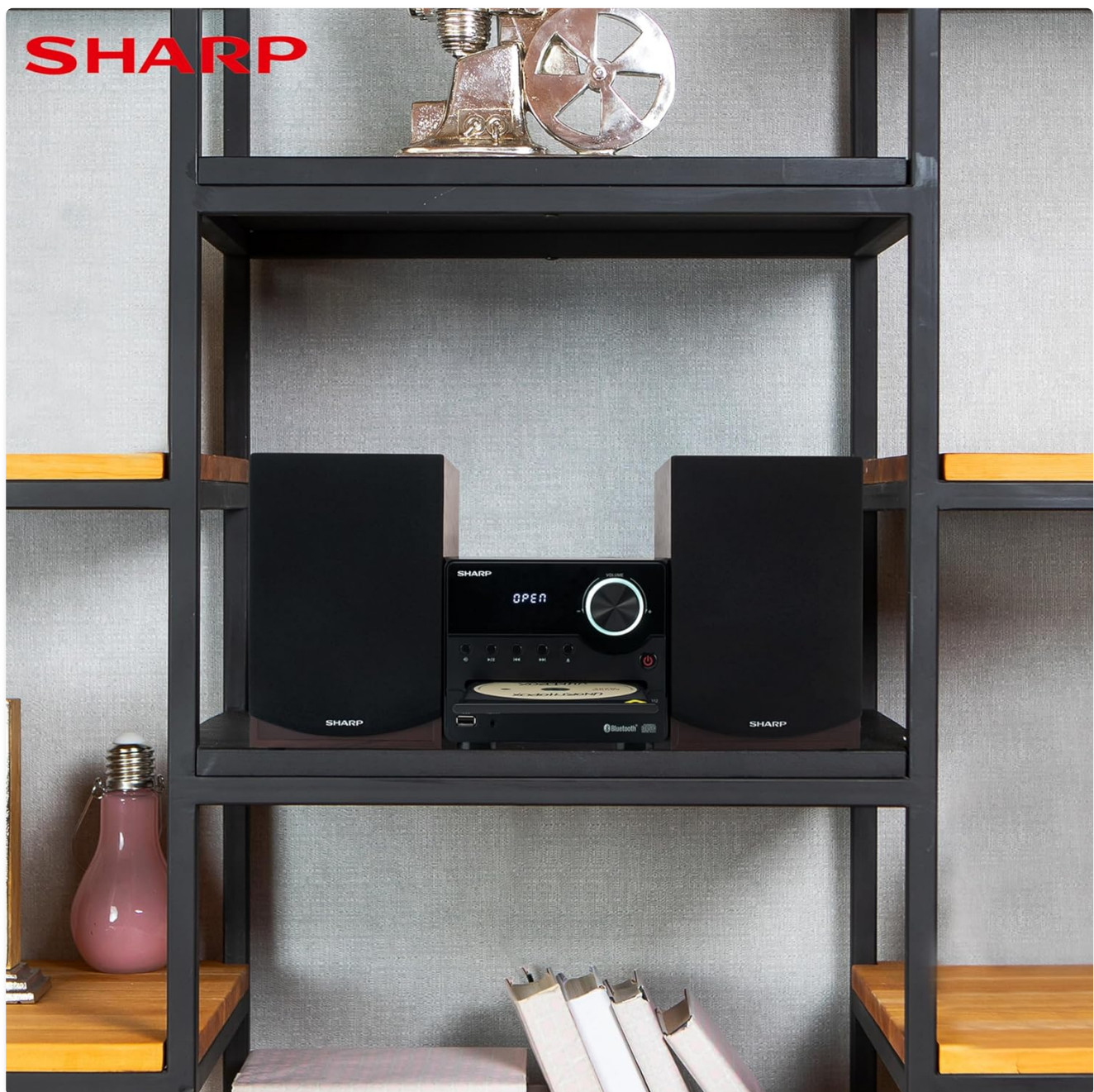
Figure 5.1: Speaker Detail