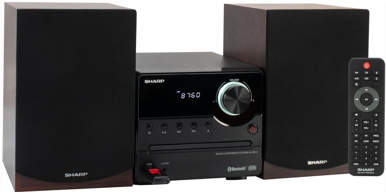
Figure 4.3: System with Remote Control

The remote control provides convenient access to all functions from a distance.