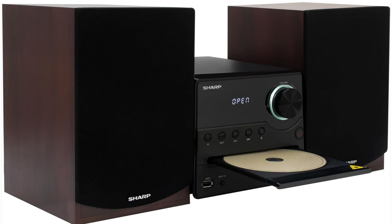
Figure 4.1: Front Panel Overview (CD Tray Open)

The front panel provides access to the main controls and input ports for convenient operation.