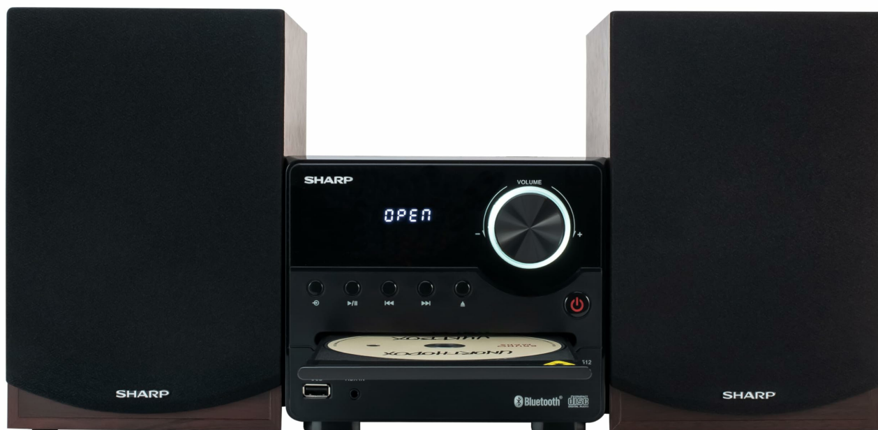
Figure 1.1: Sharp XL-B512 Micro Component System