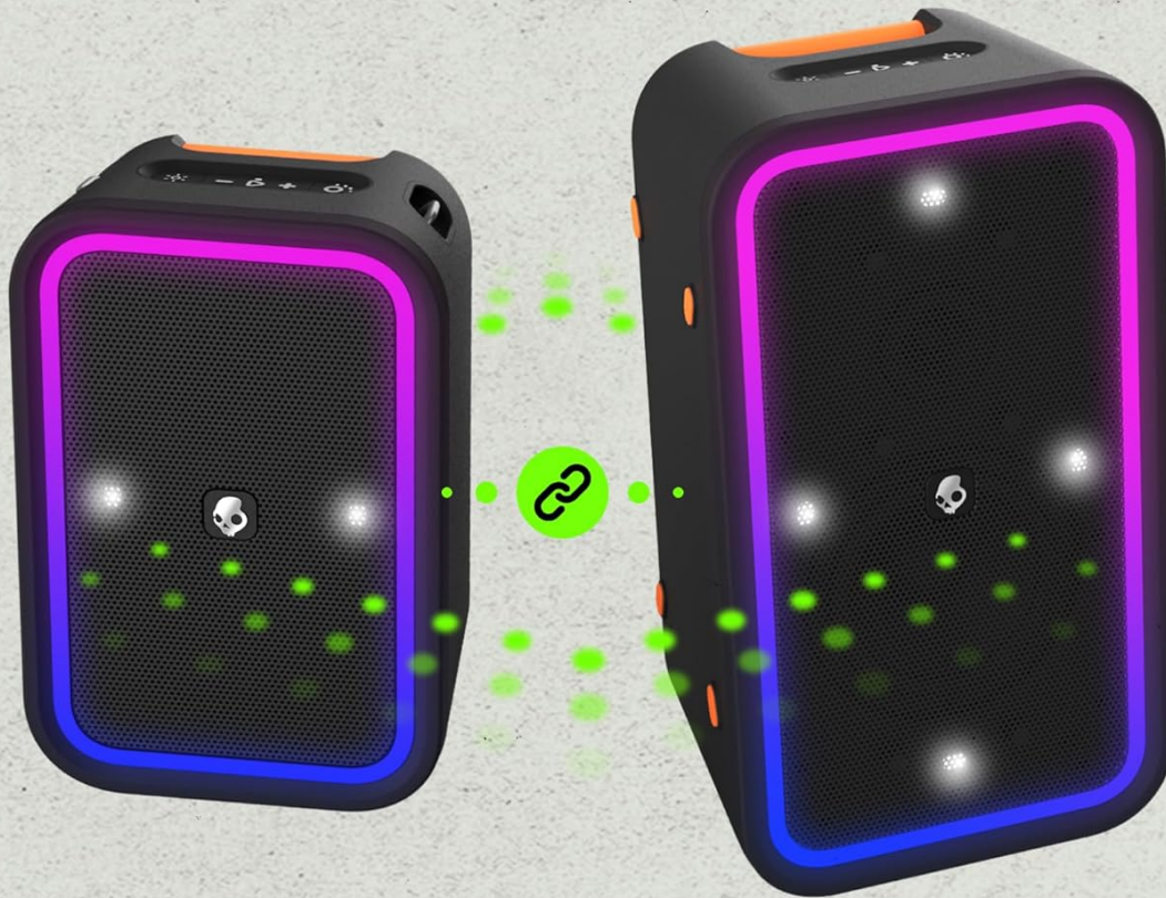
Figure 5: Top panel controls of the Skullcandy Stomp speaker, including power, volume, play/pause, and light mode buttons.

Seamless synchronization for an immersive and customizable audio experience