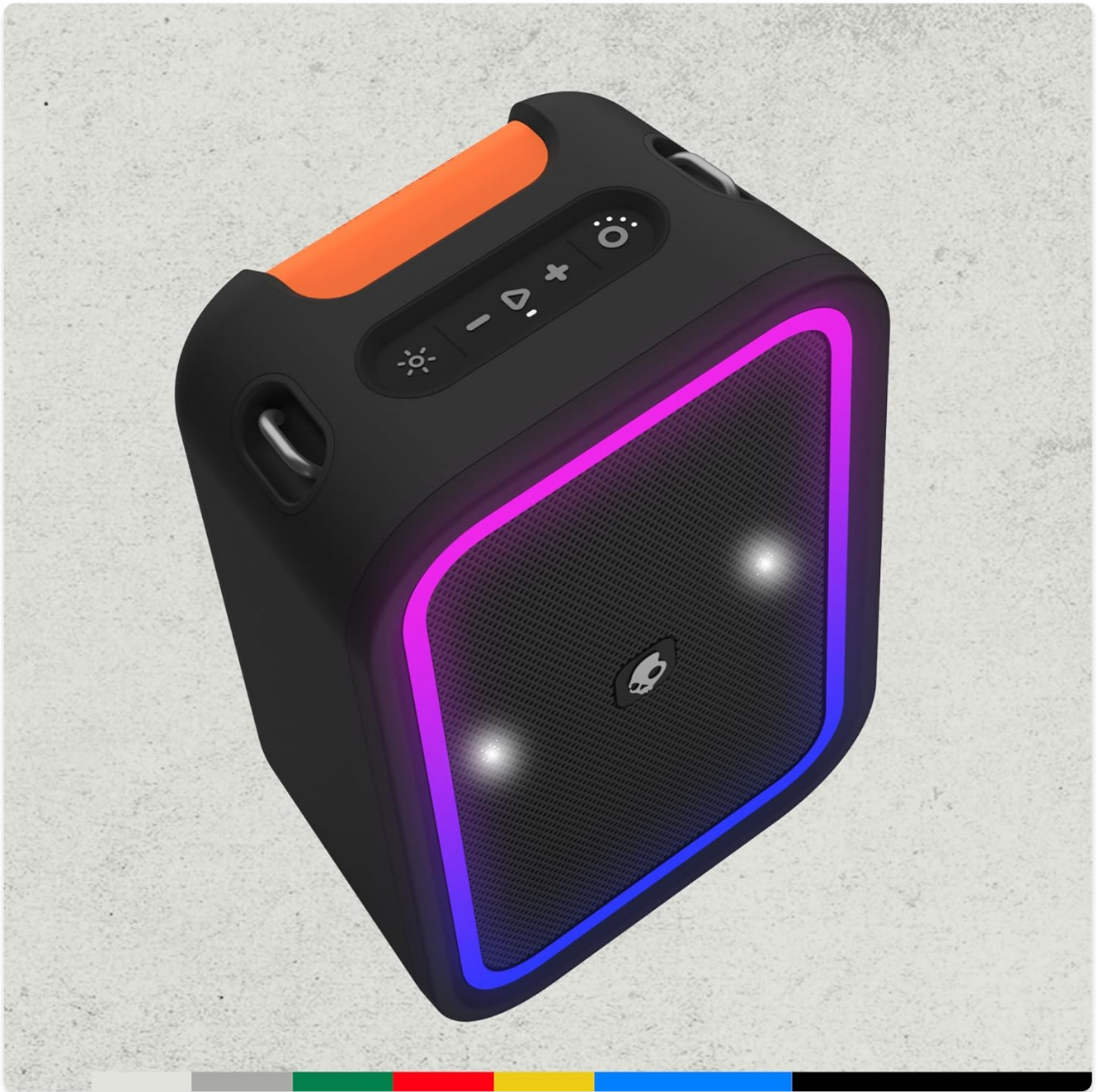
Figure 3: The Skullcandy Stomp speaker demonstrating its IPX7 water resistance, suitable for use in wet environments.