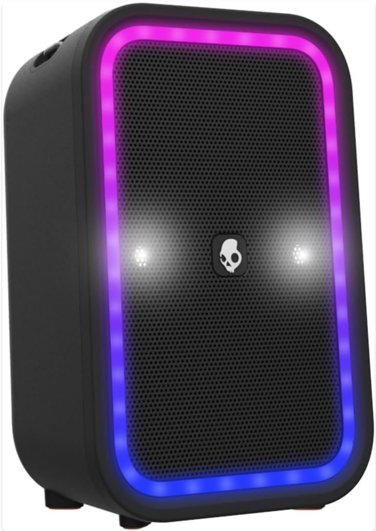
Figure 1: Skullcandy Stomp Bluetooth Speaker. This image shows the speaker from the front, highlighting its black finish and vibrant LED light strip around the grille.