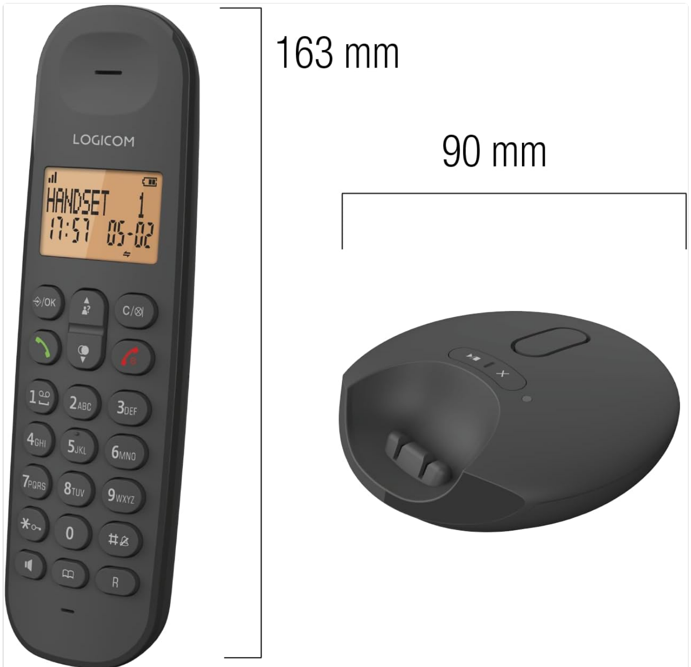
Image 7.1: Product Dimensions. This image provides a visual representation of the handset and base dimensions, indicating a handset height of 163mm and a base width of 90mm.