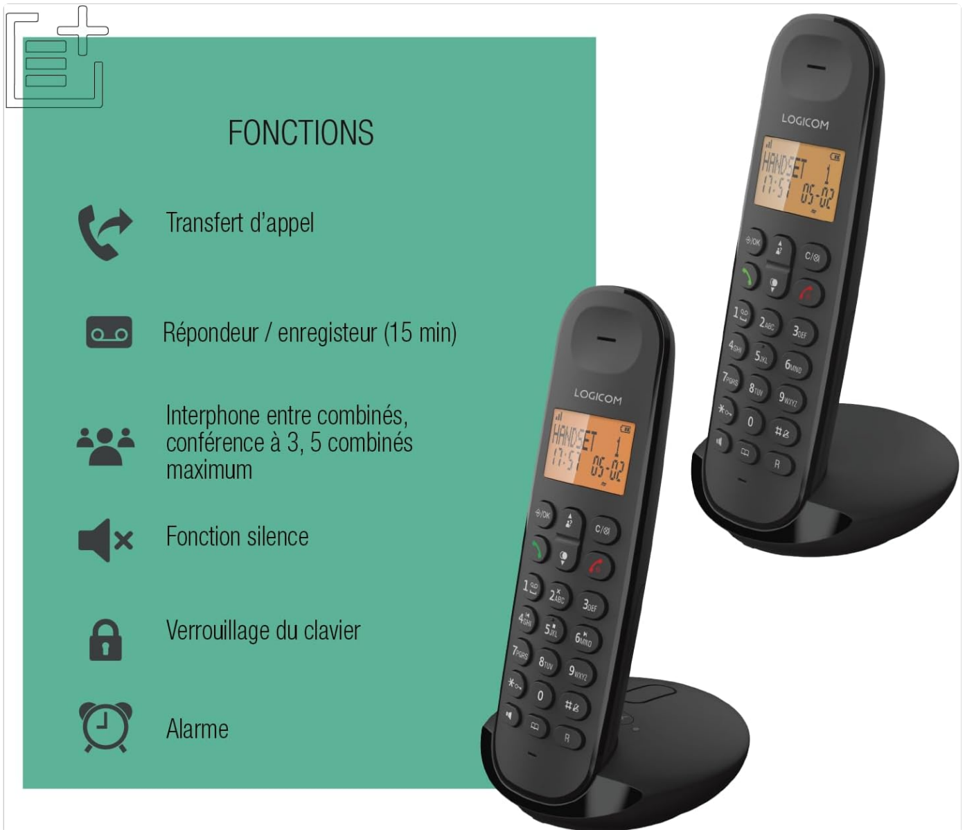
Image 4.1: Handset Functions. This image highlights key functions of the ILOA 255T handset, including call transfer, answering machine, intercom, mute function, keypad lock, and alarm.