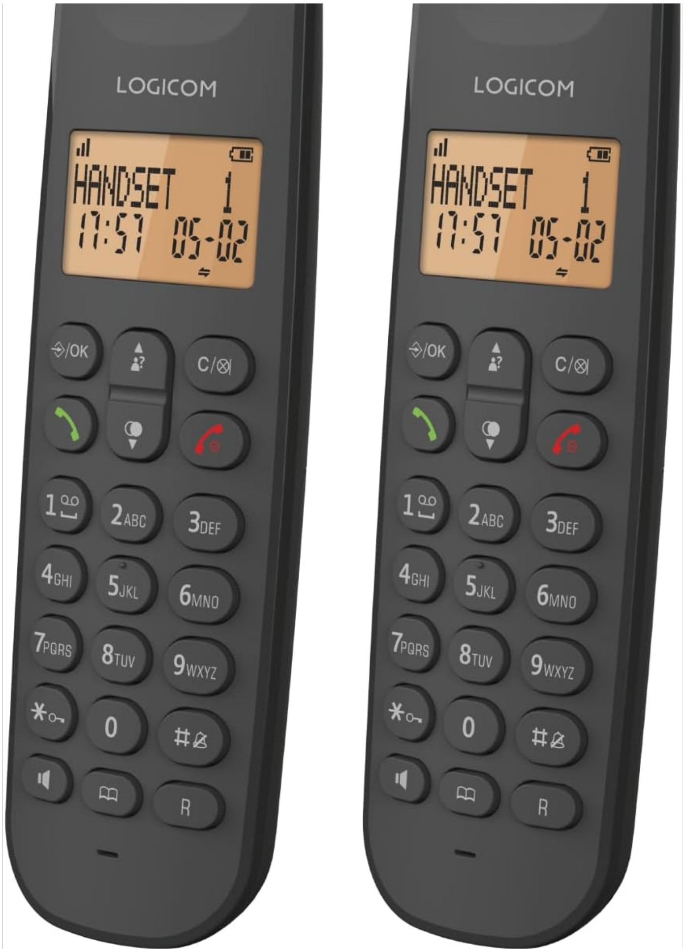
Image 4.2: Handset Characteristics. This image illustrates the features of the ILOA 255T handset, including its large 4-line screen, caller ID display, redial function for the last 5 numbers, adjustable ringer and listening volumes, 10 available ringtones, battery specifications (2x AAA NiMH, 90h standby, 7h talk time), and range (300m open field, 50m indoors).