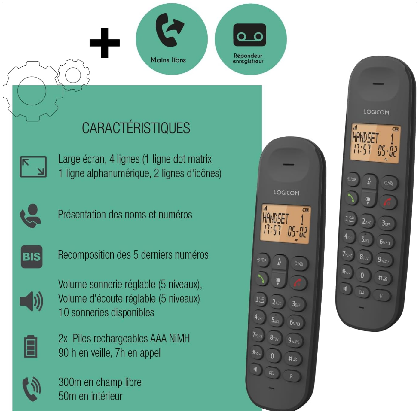
Image 1.1: Logicom ILOA 255T Cordless Phone Duo. This image displays two black cordless handsets, each placed on its respective charging base. The handsets feature a digital display and a standard telephone keypad.