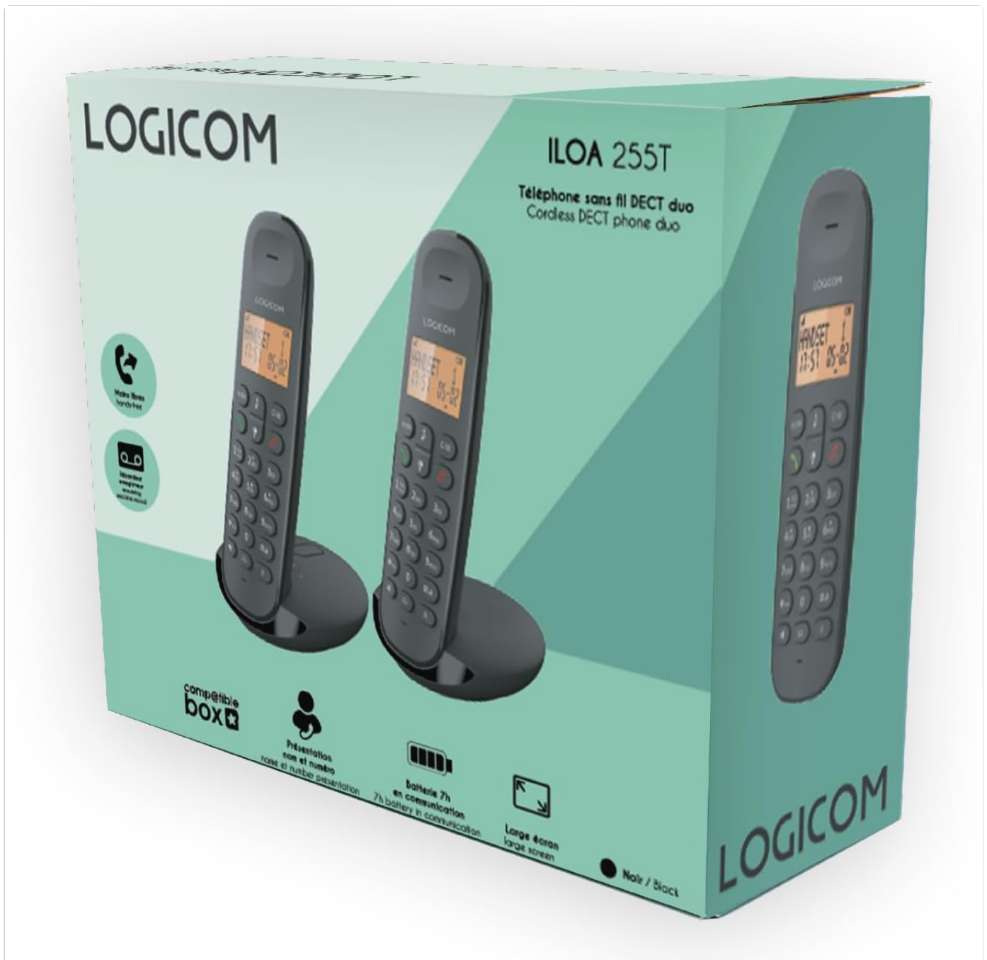
Image 2.1: Product Packaging. The image shows the retail box for the Logicom ILOA 255T, illustrating the two handsets and highlighting key features like DECT technology, answering machine, and battery life.