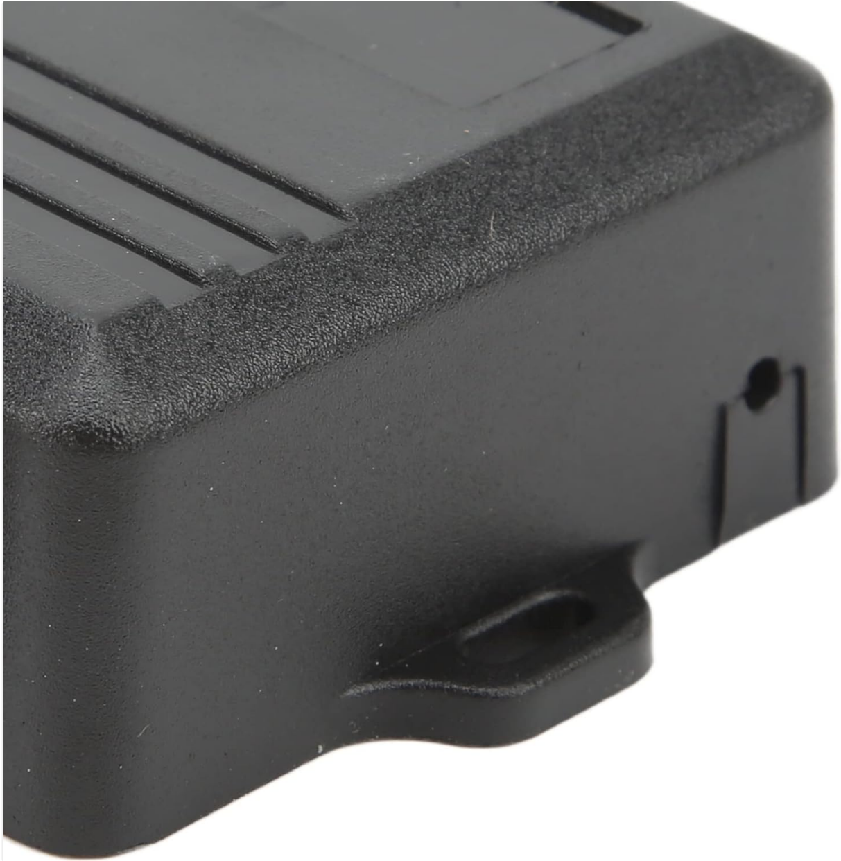
Image: A detailed view of the power window closer module, showing its compact design and the multi-pin connector for wiring integration.