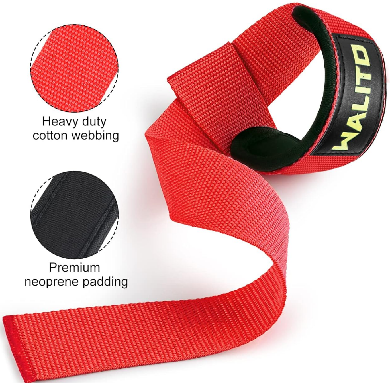
Image 3.1: Detail of materials: heavy-duty cotton webbing and premium neoprene padding.