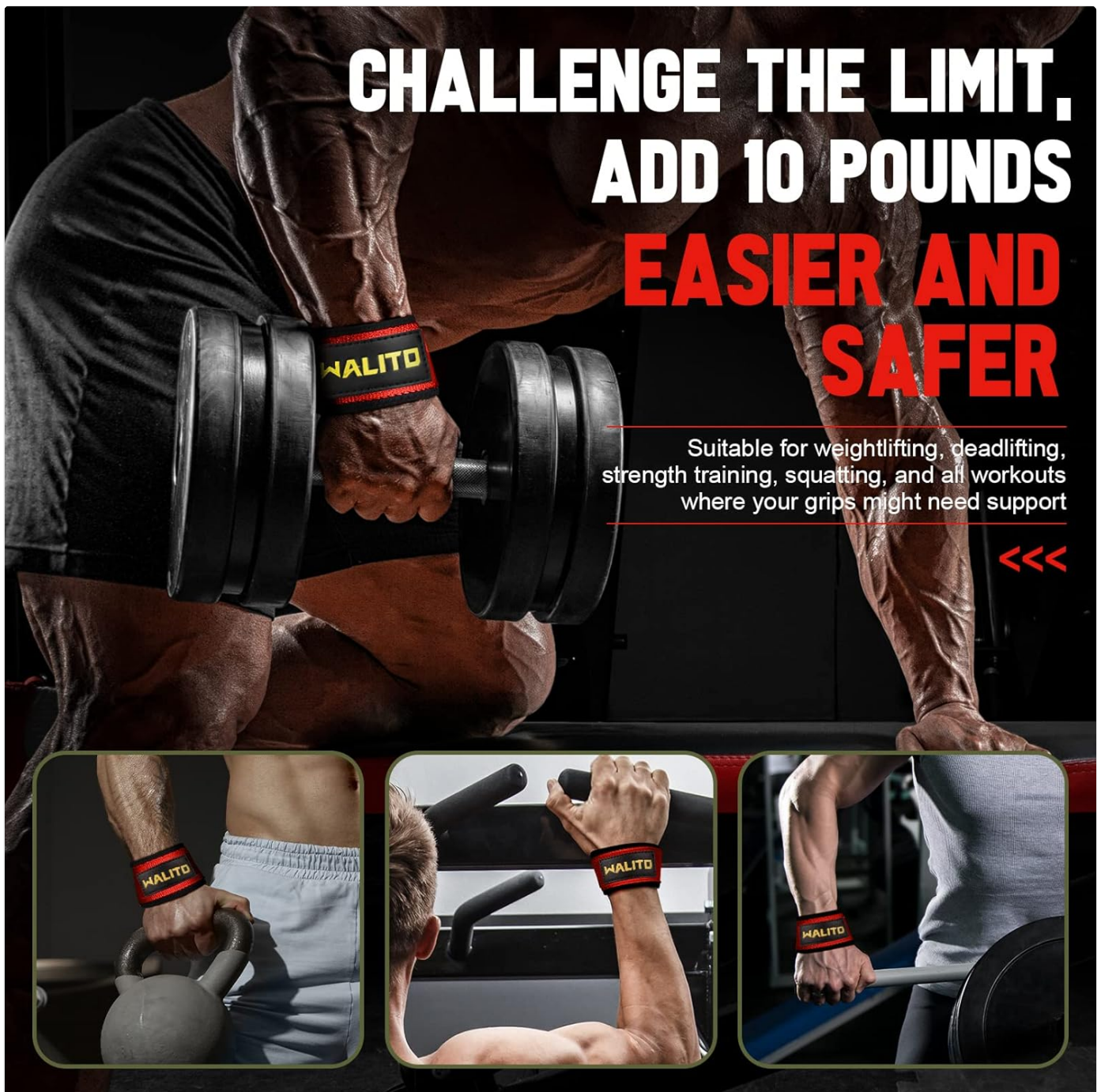
Image 4.2: WALITO lifting straps in use during different strength training exercises.