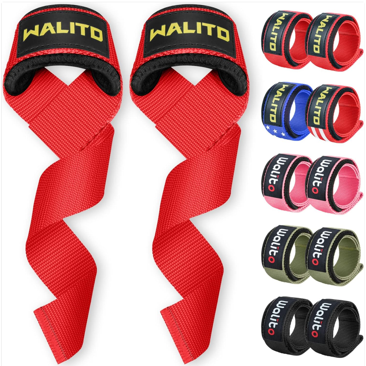
Image 1.1: WALITO Gym Weight Lifting Straps (Red) and other available colors.