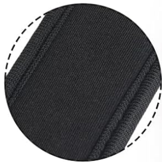
Premium neoprene padding