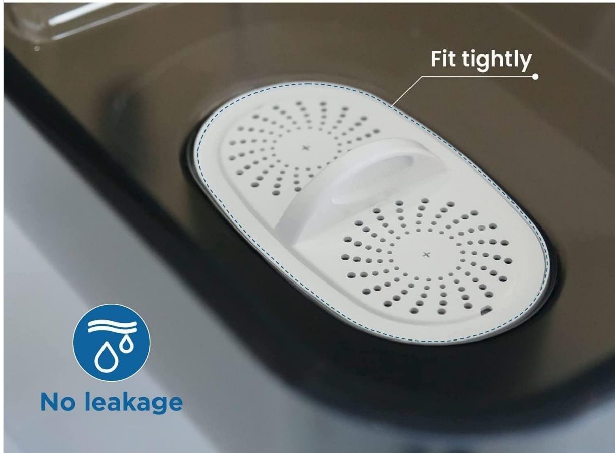
Figure 3: Ensure the filter is installed tightly to prevent unfiltered water from dripping into the filtered water.