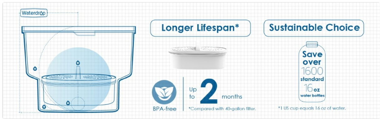
Figure 5: The WD-PF-01A Plus filter offers a longer lifespan and is a sustainable choice.