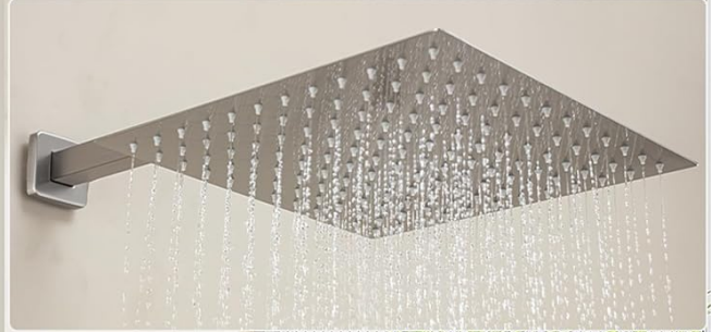
Rain Shower Mode