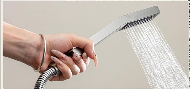
Handheld Shower Mode