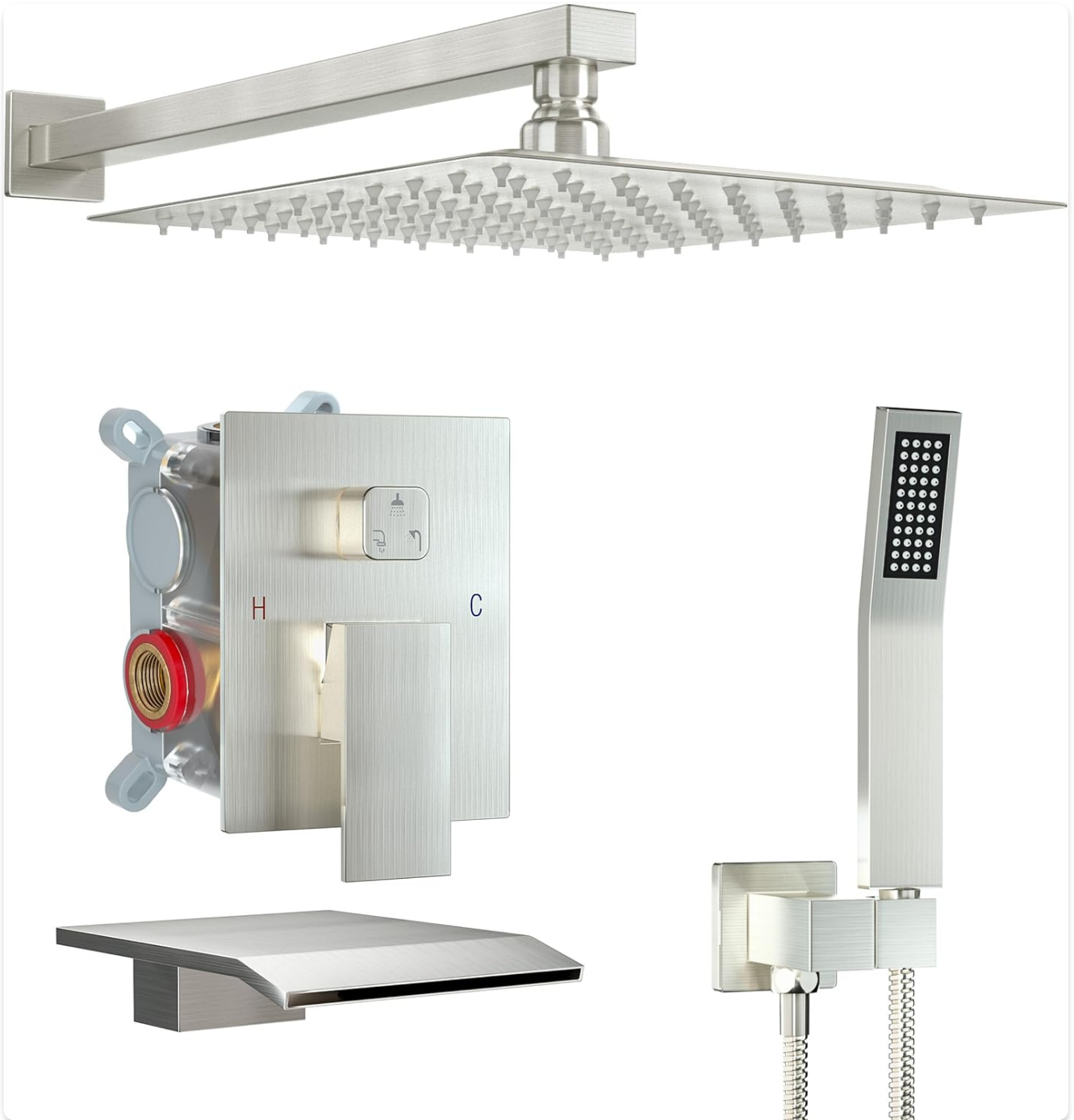
Image: The complete ShiureBath 12 Inch Shower Faucet Set, showcasing the rain shower head, control valve, handheld shower, and tub spout, all in a brushed nickel finish.