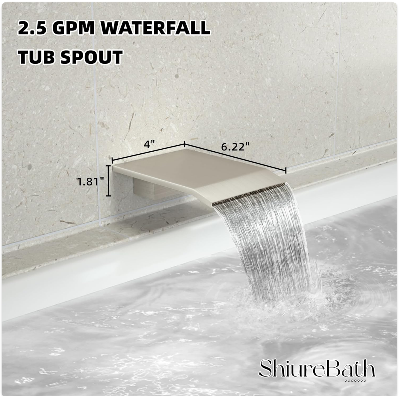
Image: The 2.5 GPM waterfall tub spout, showing its dimensions (4" width, 6.22" projection, 1.81" height) and the smooth, wide water flow it provides.