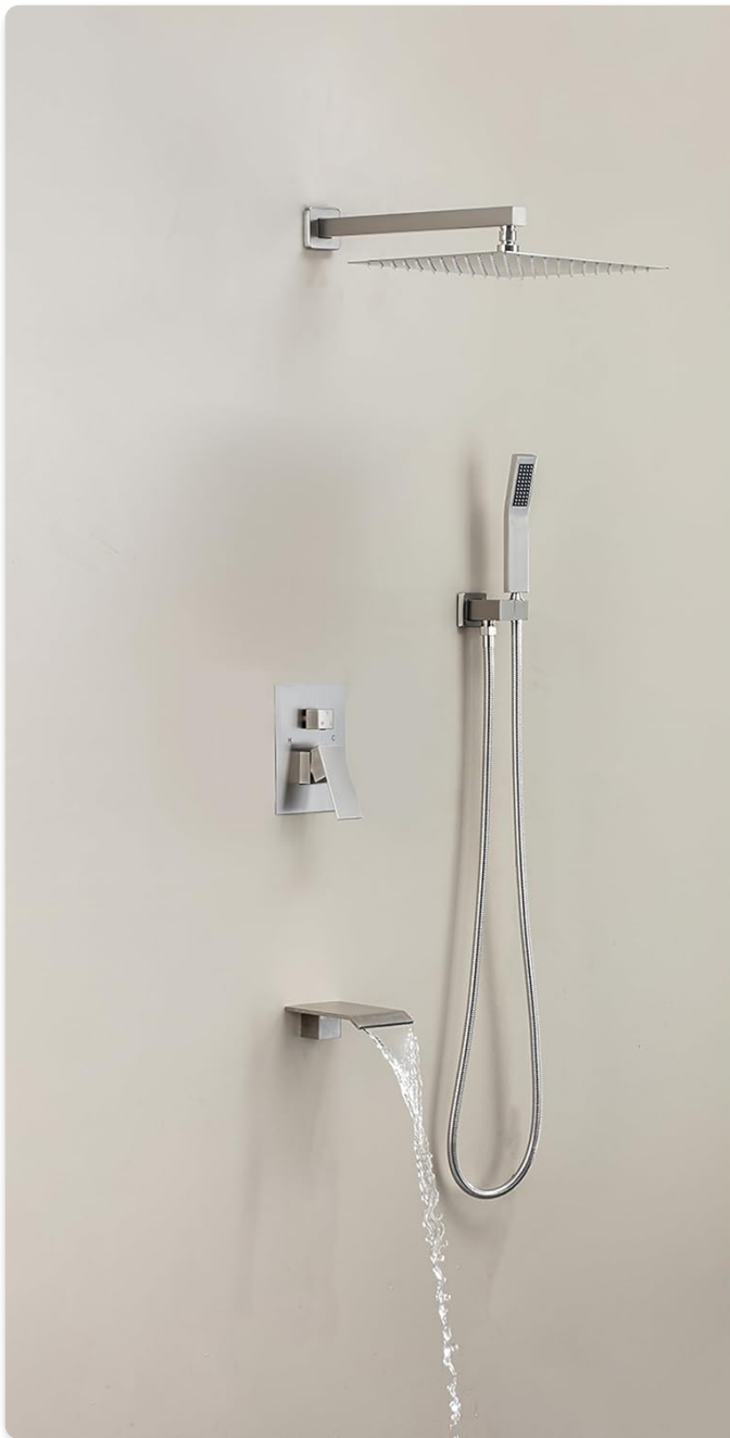
Image: Illustration of the three functional modes: overhead rain shower, handheld shower, and tub spout, demonstrating the versatility of the system.