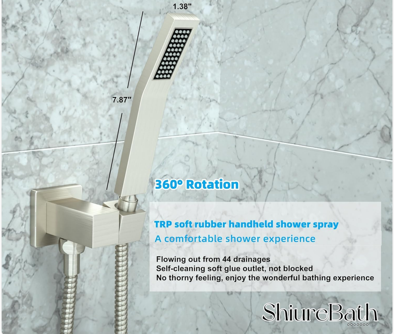
Image: The handheld shower head with its dimensions (7.87" length, 1.38" width) and features like TRP soft rubber for a comfortable experience and 44 drainages for efficient flow.