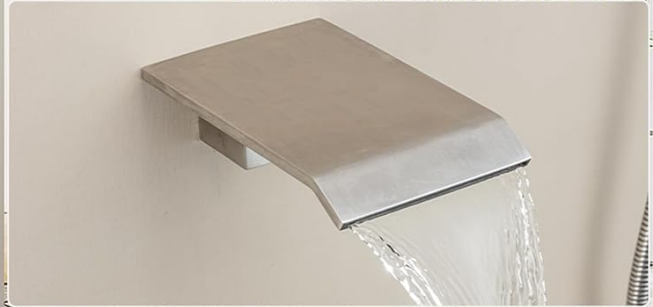
Tub Spout Mode