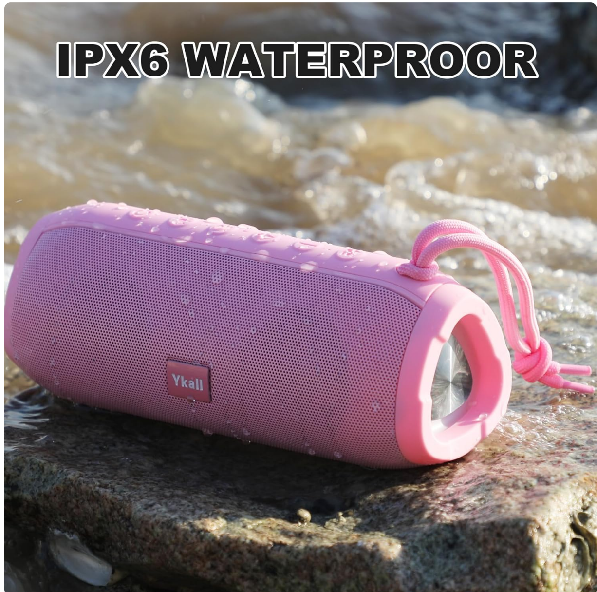
The Ykall T3 speaker demonstrating its IPX6 waterproof capability, shown on wet rocks near a body of water.