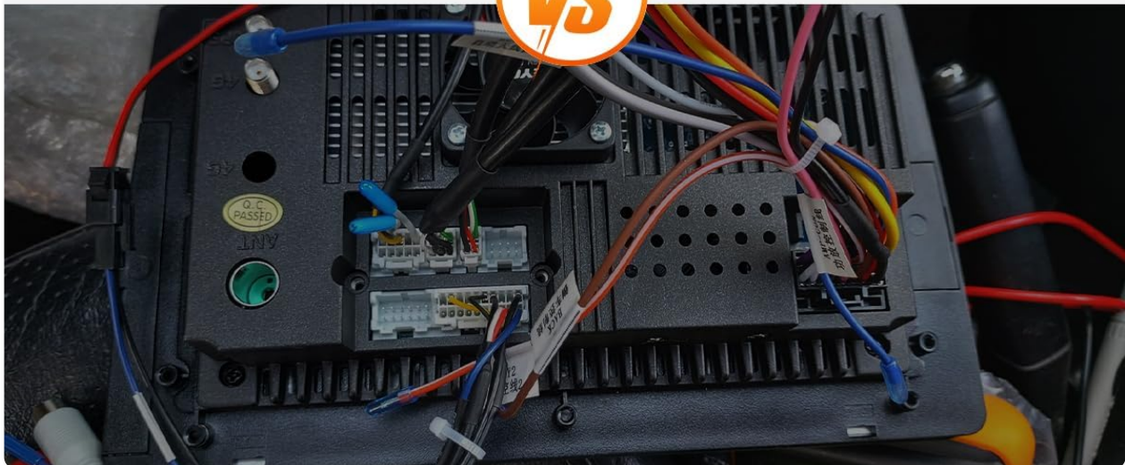
Image 3.2: Illustration of quick and easy installation methods compared to traditional car stereo wiring.