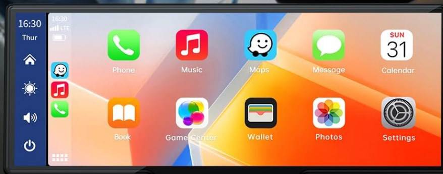
Image 4.3: Hands-free operation using Siri and Google Assistant for safer driving.