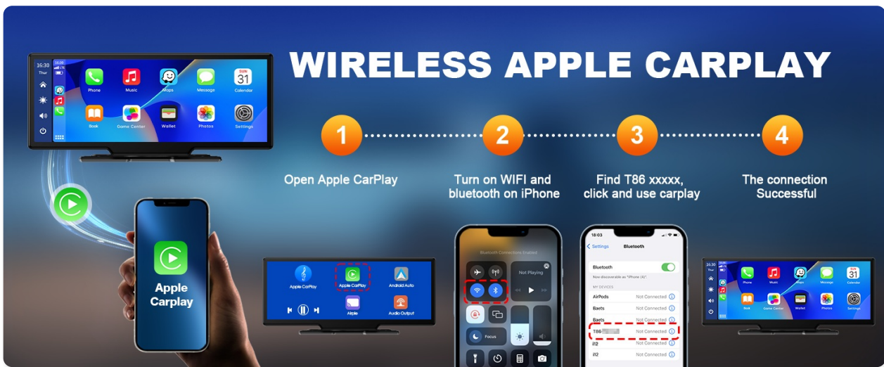
Image 4.4: Steps for establishing a wireless Apple AirPlay connection for screen mirroring.