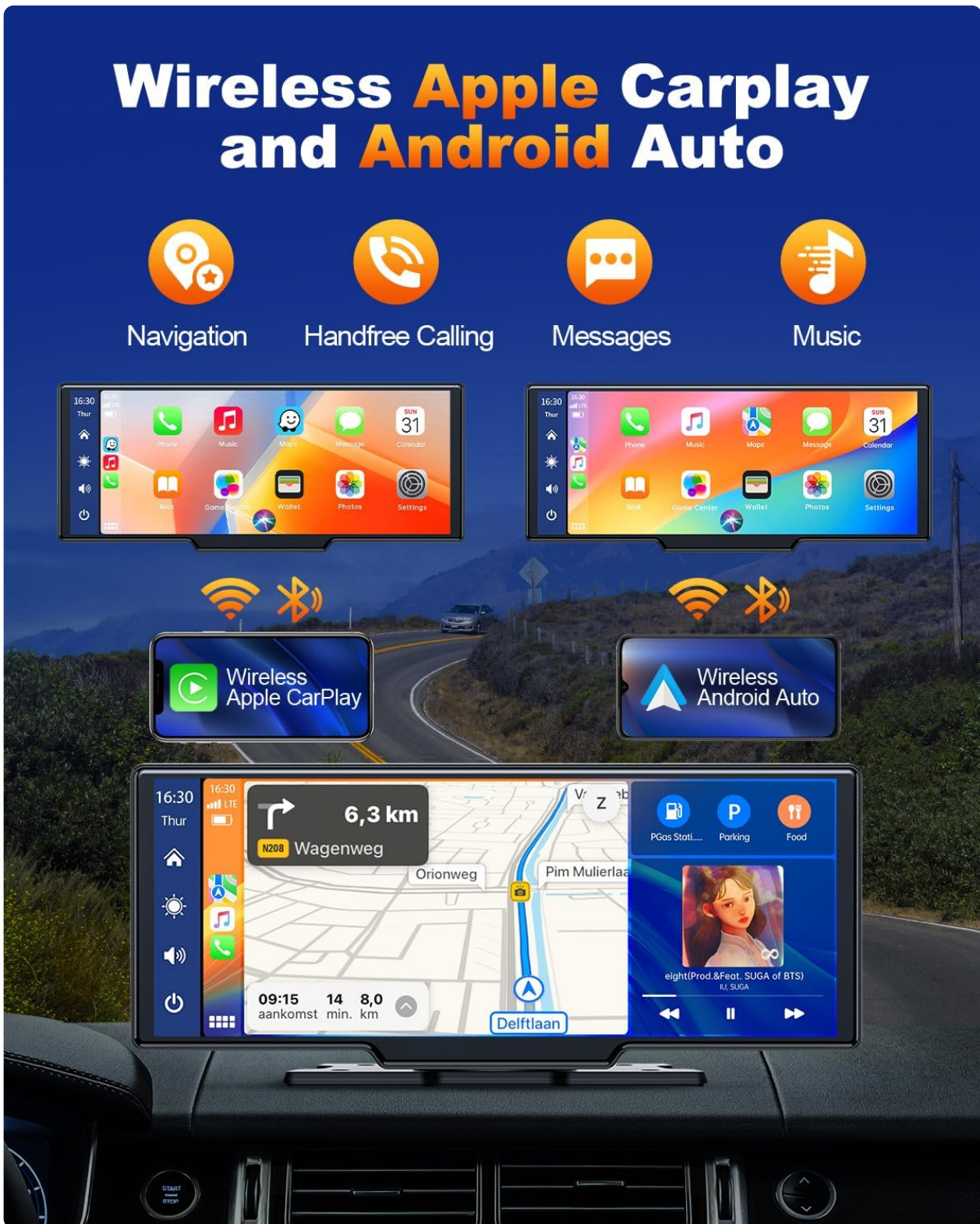
Image 4.2: The main interfaces for Wireless Apple CarPlay and Android Auto, highlighting key functions.