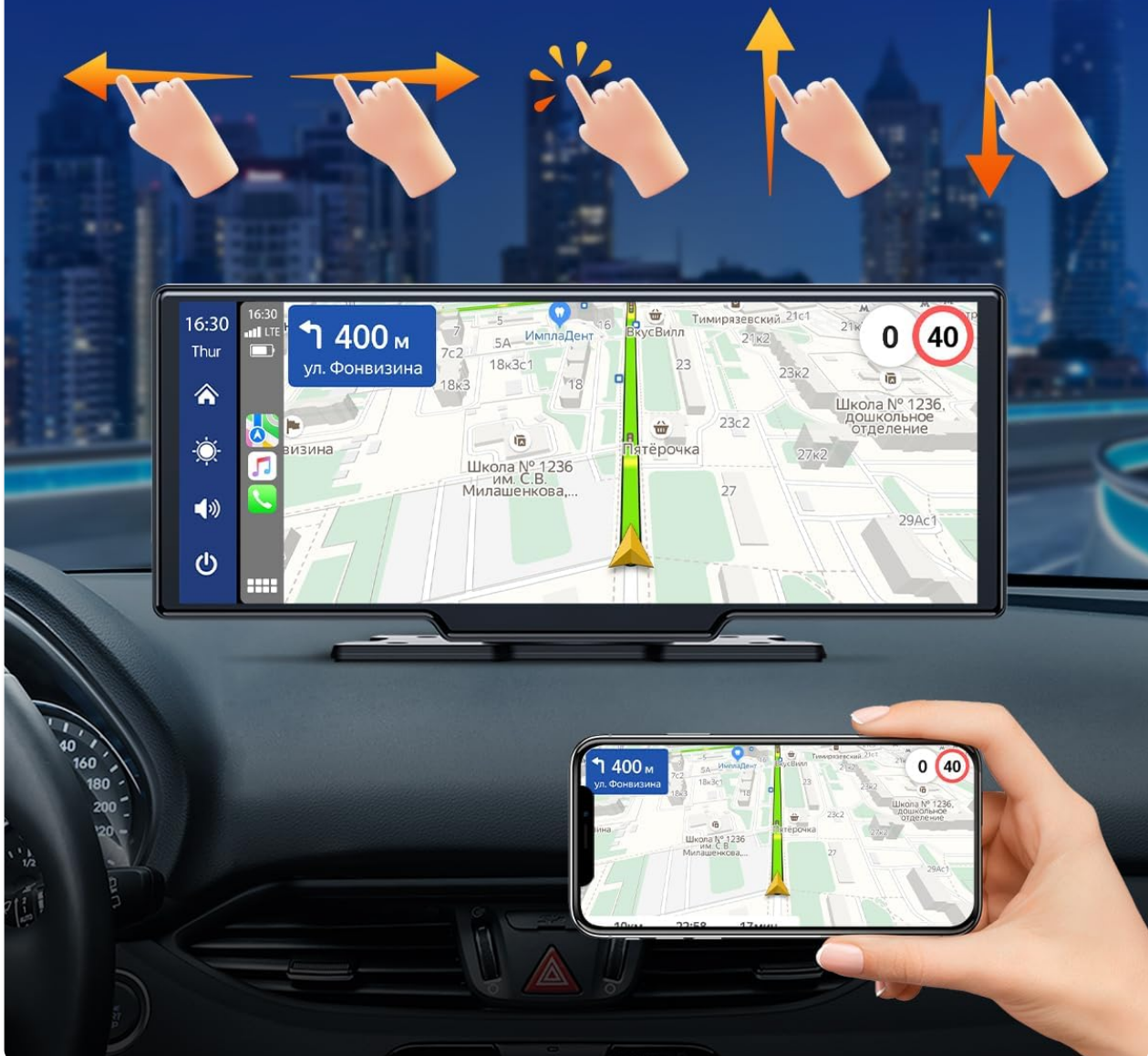
Image 4.1: The responsive 9.26-inch touch screen supports various gestures for intuitive control.

Resolution rate 1296*600 HD capacitive touch screen makes the screen more sensitive and smooth