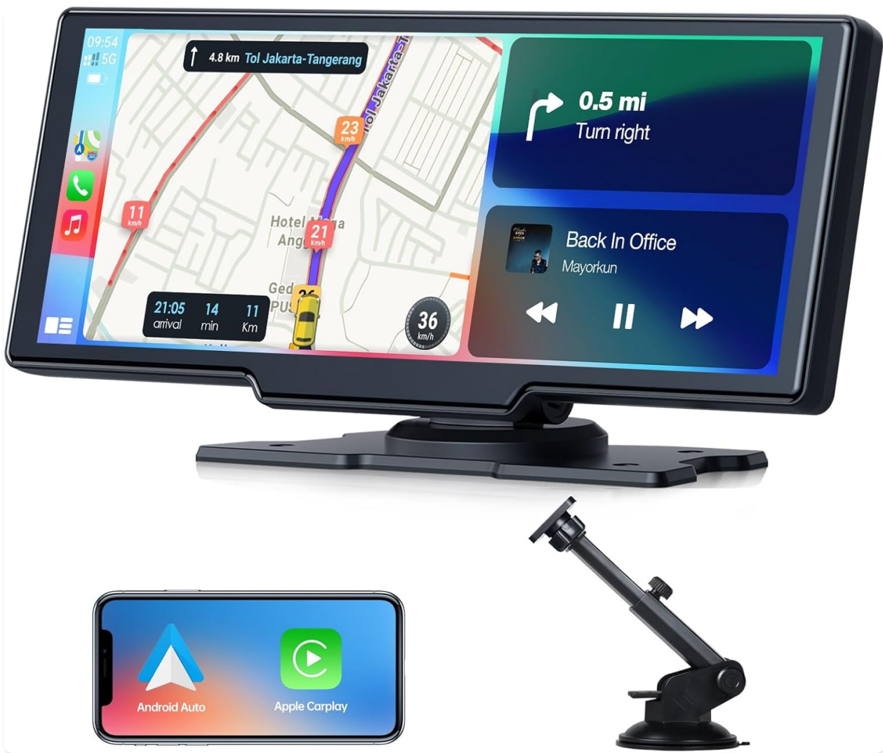
Image 1.1: The Volam 9.26 inch portable car display, showcasing its large screen, included mounting bracket, and compatibility with Apple CarPlay and Android Auto.