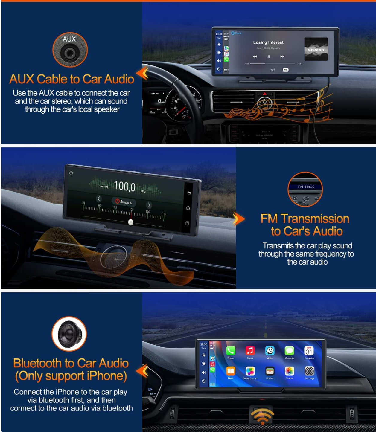
Image 4.5: Various options for connecting the display's audio to your car's sound system.