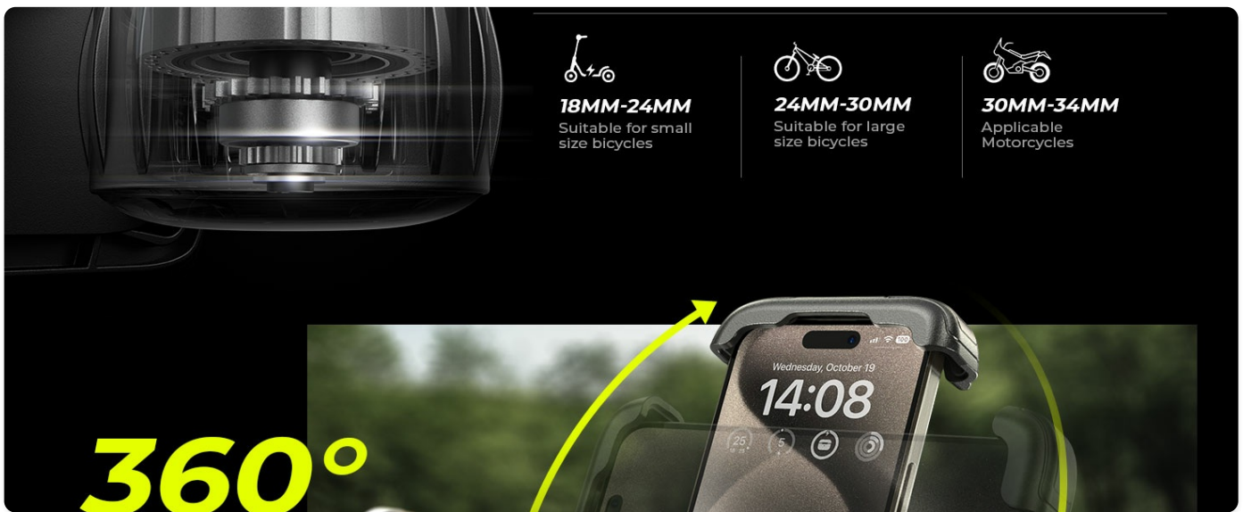
Figure 4: The mount allows for full 360-degree rotation for optimal viewing.

Your browser does not support the video tag.