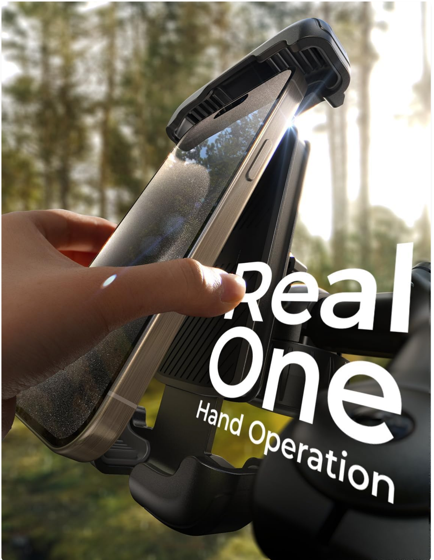
Figure 3: Demonstrating the easy one-hand phone insertion.