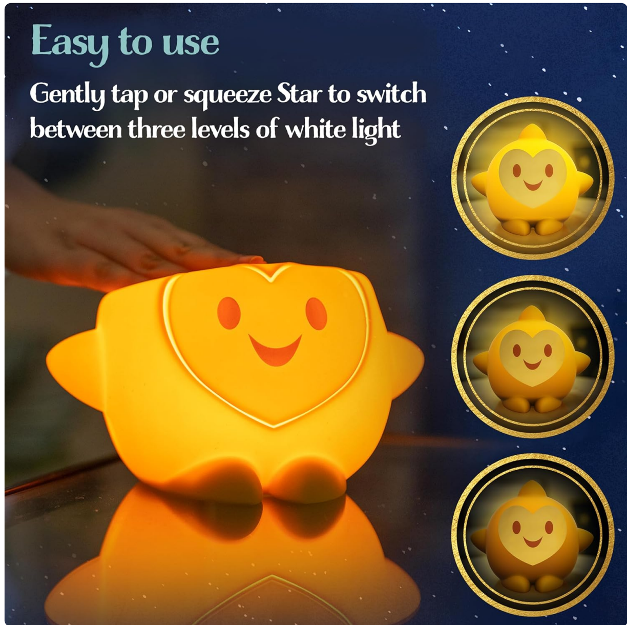
Image: Demonstrating how to tap the light to adjust brightness.

Once the light is ON, gently tap or squeeze the soft silicone body of the Star Squishy Light to cycle through three levels of white light (high, medium, low).