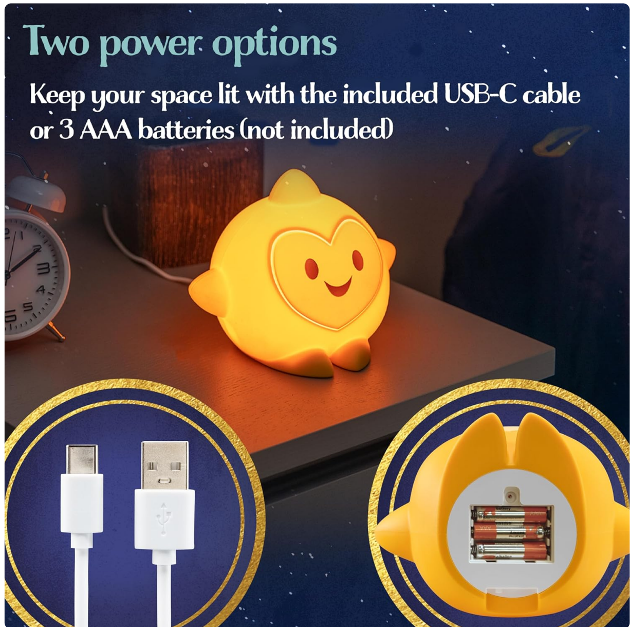
Image: The two power options for the light: USB-C cable and 3 AAA batteries.

Insert the USB-C end of the included cable into the port on the back of the light. Plug the USB-A end of the cable into a 5V, 1A USB-A power adapter (not included) or a compatible USB port.