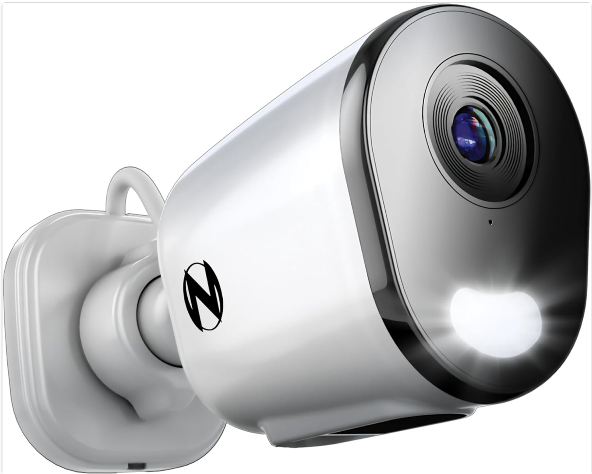
Image 2: Side view of the Night Owl FTD4 2K Deterrence Camera, highlighting its compact design and mounting base. The camera connects via a single BNC cable.

Note: While the product specifications mention "Wi-Fi" for Wireless Communication Technology, the primary video/audio/power connection for this camera is wired via BNC. Wi-Fi functionality may pertain to mobile app connectivity or other system features, not direct video transmission from the camera itself.