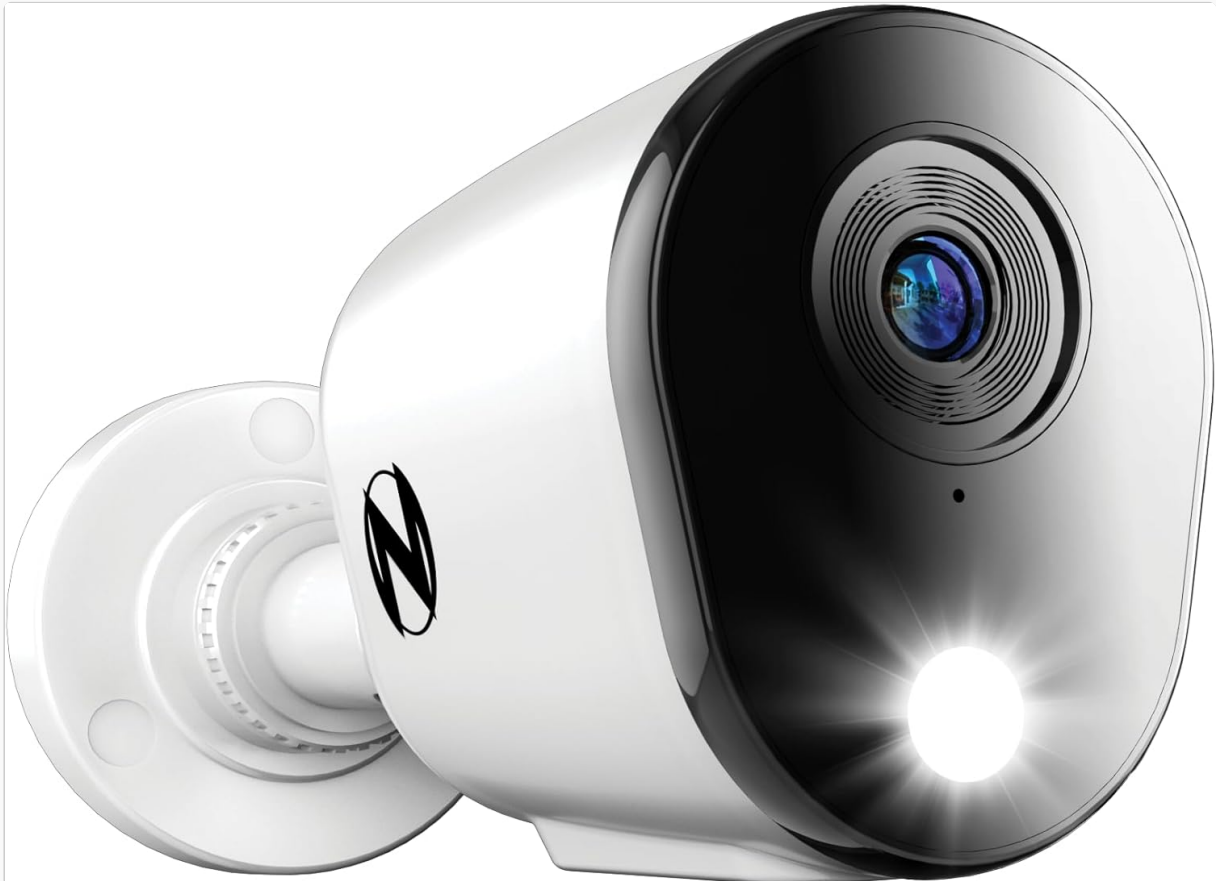
Image 1: Front view of the Night Owl FTD4 2K Deterrence Camera, showing the lens and integrated spotlight. This camera is designed for both indoor and outdoor surveillance.