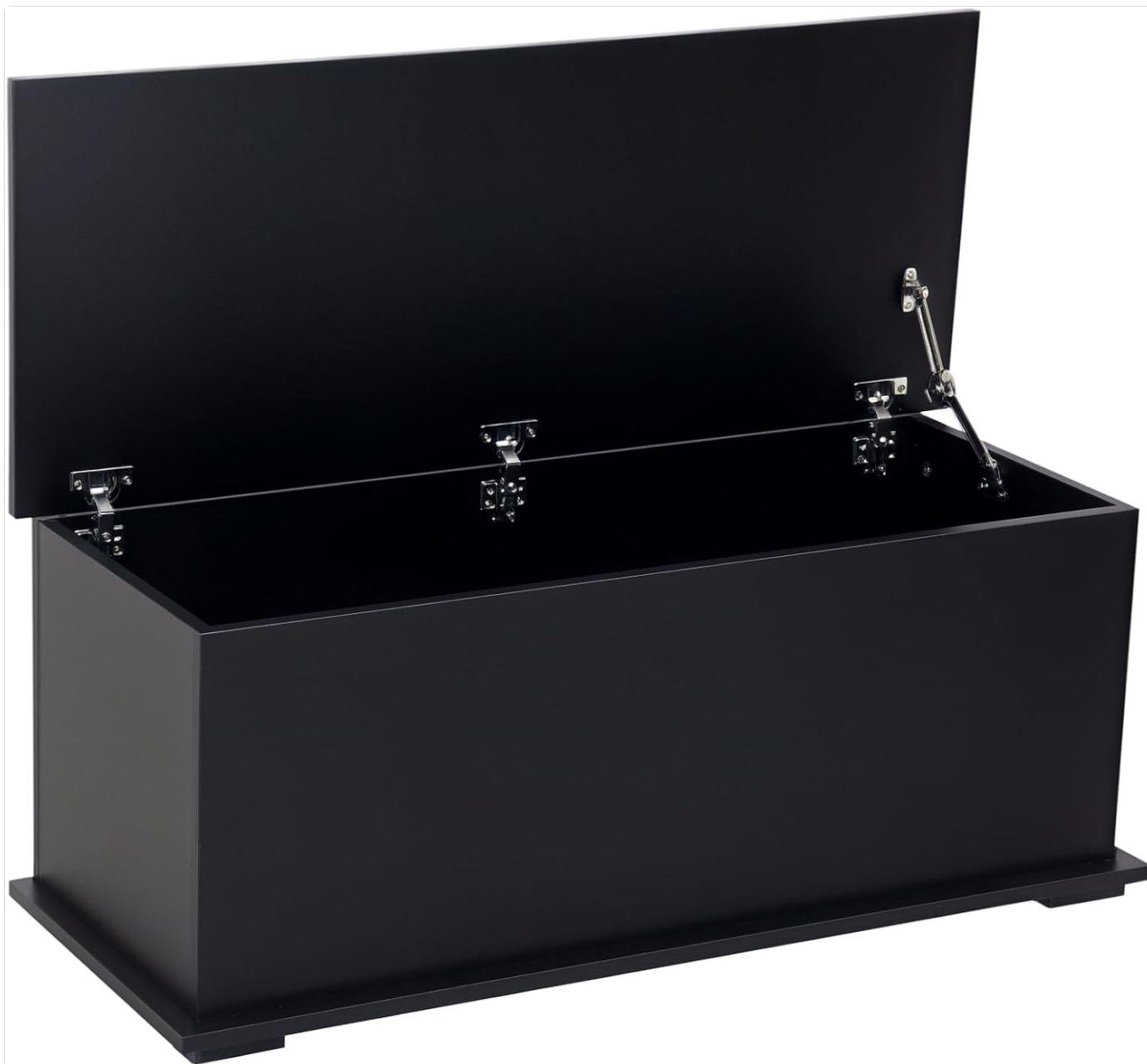
Image 1.1: The HOMCOM 39.5" Lift Top Storage Chest with its lid fully open, showcasing the interior storage space.