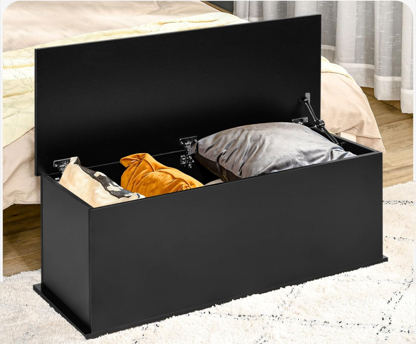
Image 5.1: The storage chest interior, demonstrating its ample capacity for various household items.

Sufficient inner space for holding books, toys or blankets