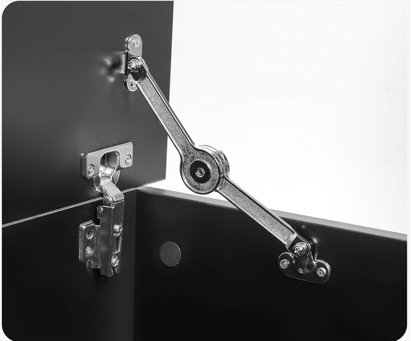
Image 4.1: A detailed view of the safety hinge, which prevents the lid from slamming shut.

Comes with safety hinge to prevent lid slamming