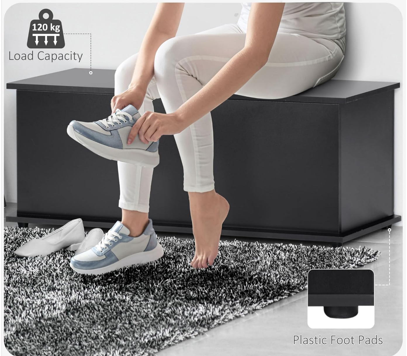
Image 4.2: The storage chest in use as a bench, demonstrating its load capacity and the non-slip foot pads at the base.