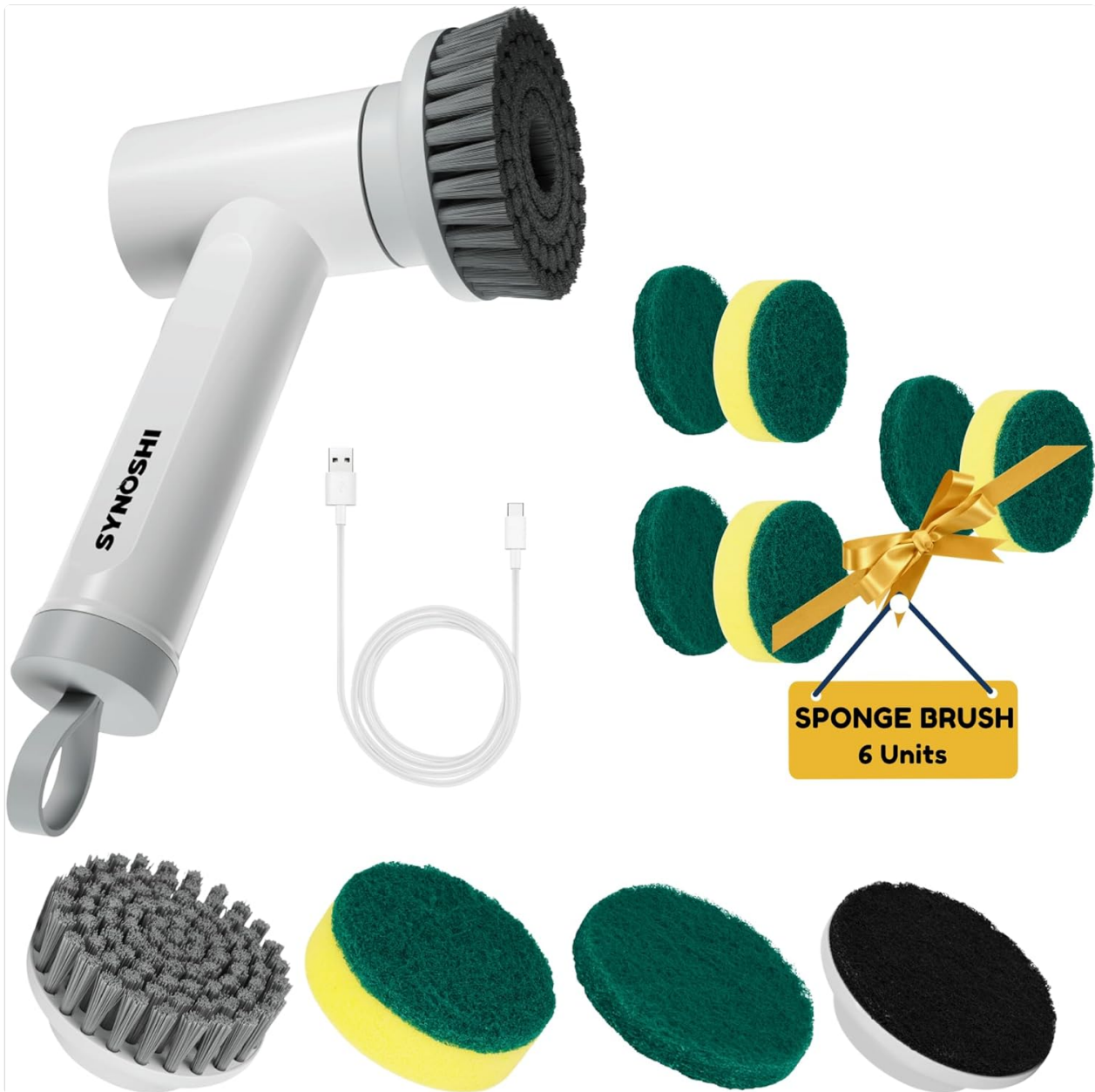
Image: The SYNOSHI Electric Spin Scrubber unit with its included brush heads and charging cable.