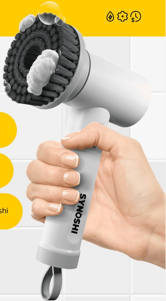
Image: Key features of the SYNOSHI Electric Spin Scrubber, including its waterproof design and multiple brush head compatibility.