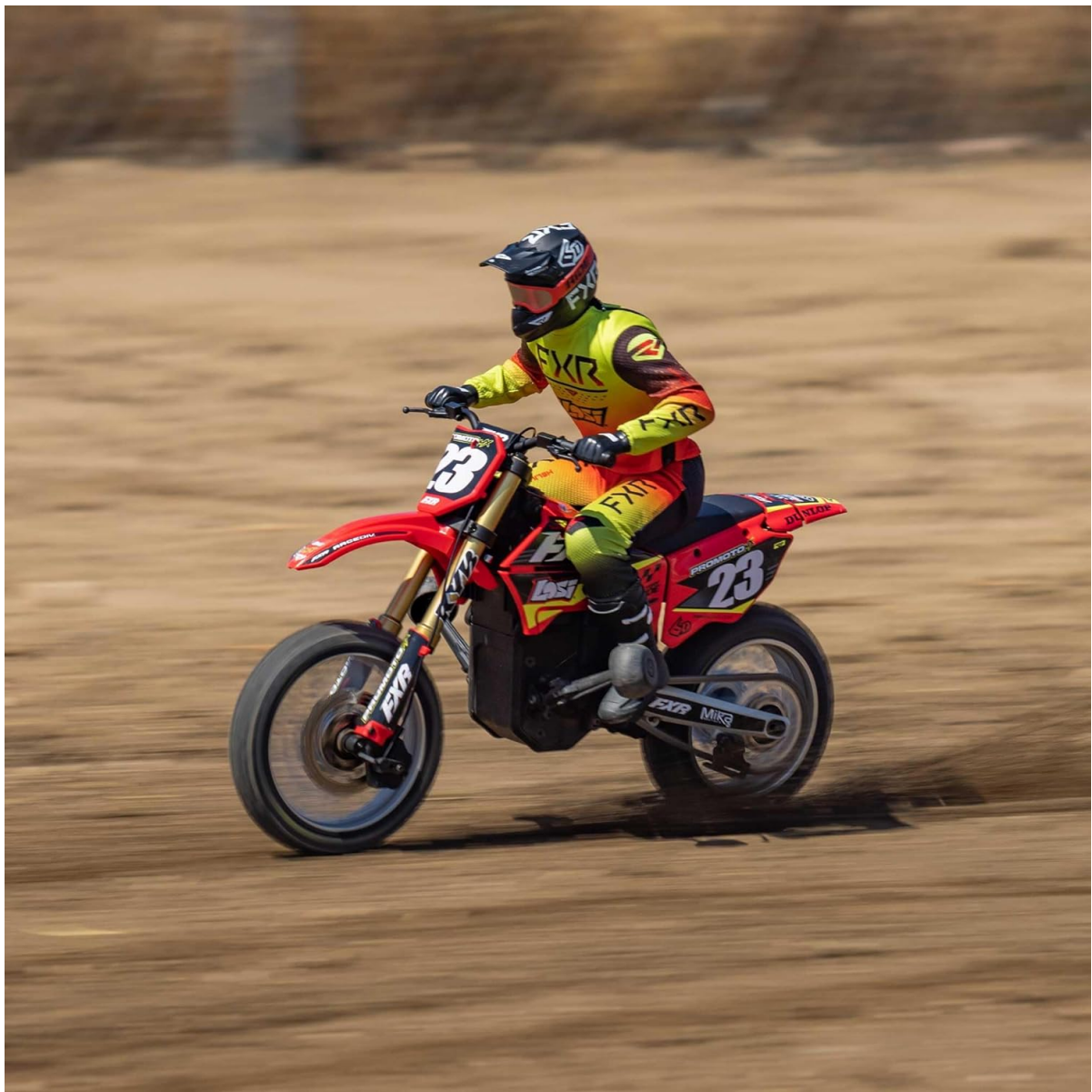
The Promoto-MX demonstrates excellent cornering ability on a dirt track.