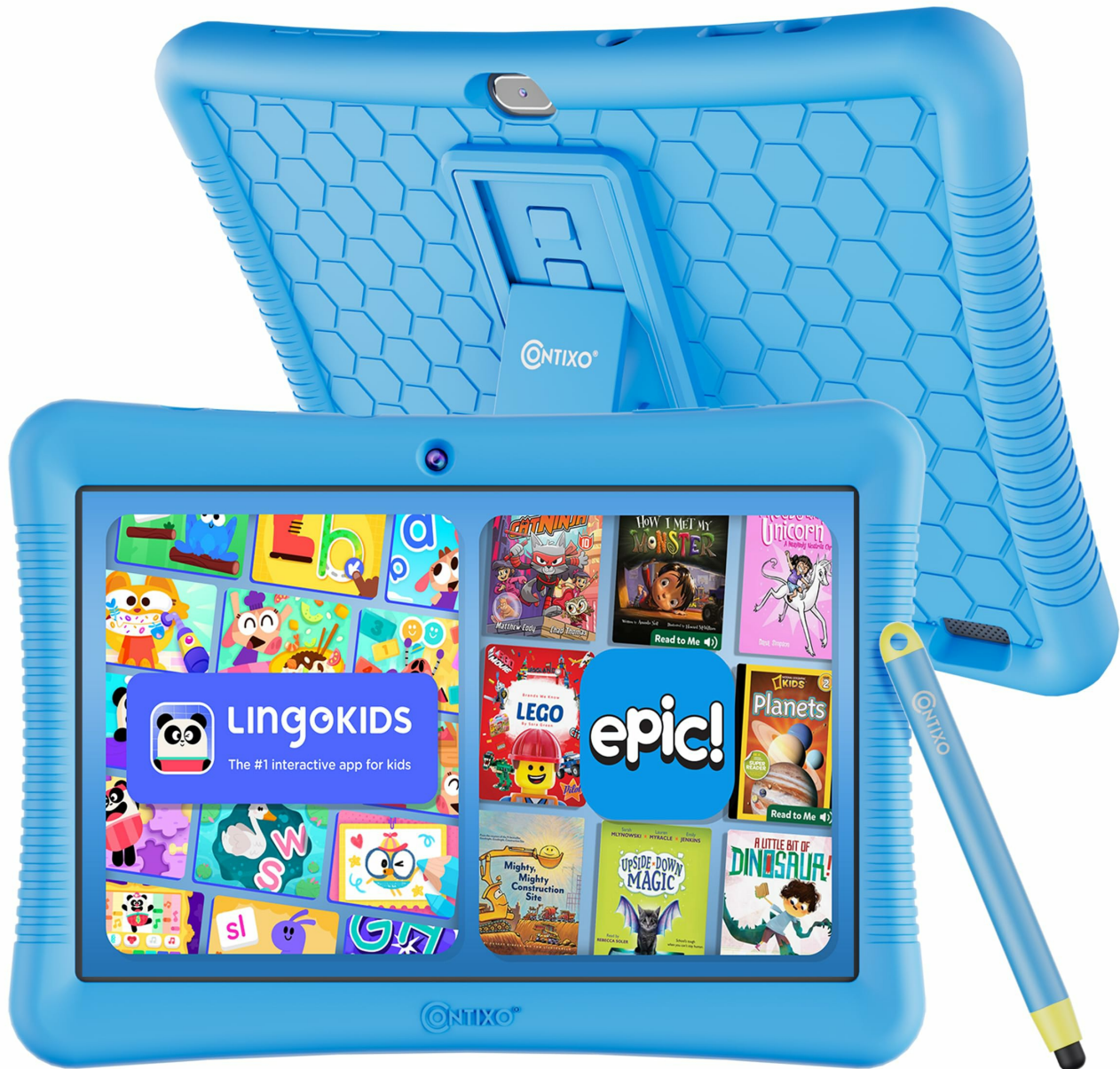
Figure 1: Contixo K102 Kids Tablet with its protective case.