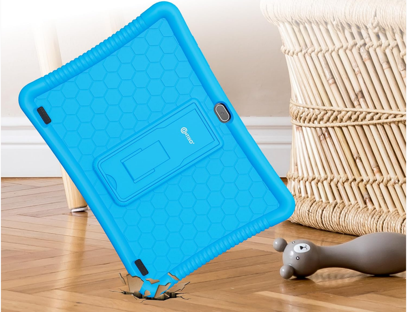
Figure 2: The Contixo K102 tablet secured in its shockproof case with the kickstand deployed.

Soft silicone built for drops, bumps, and little hands