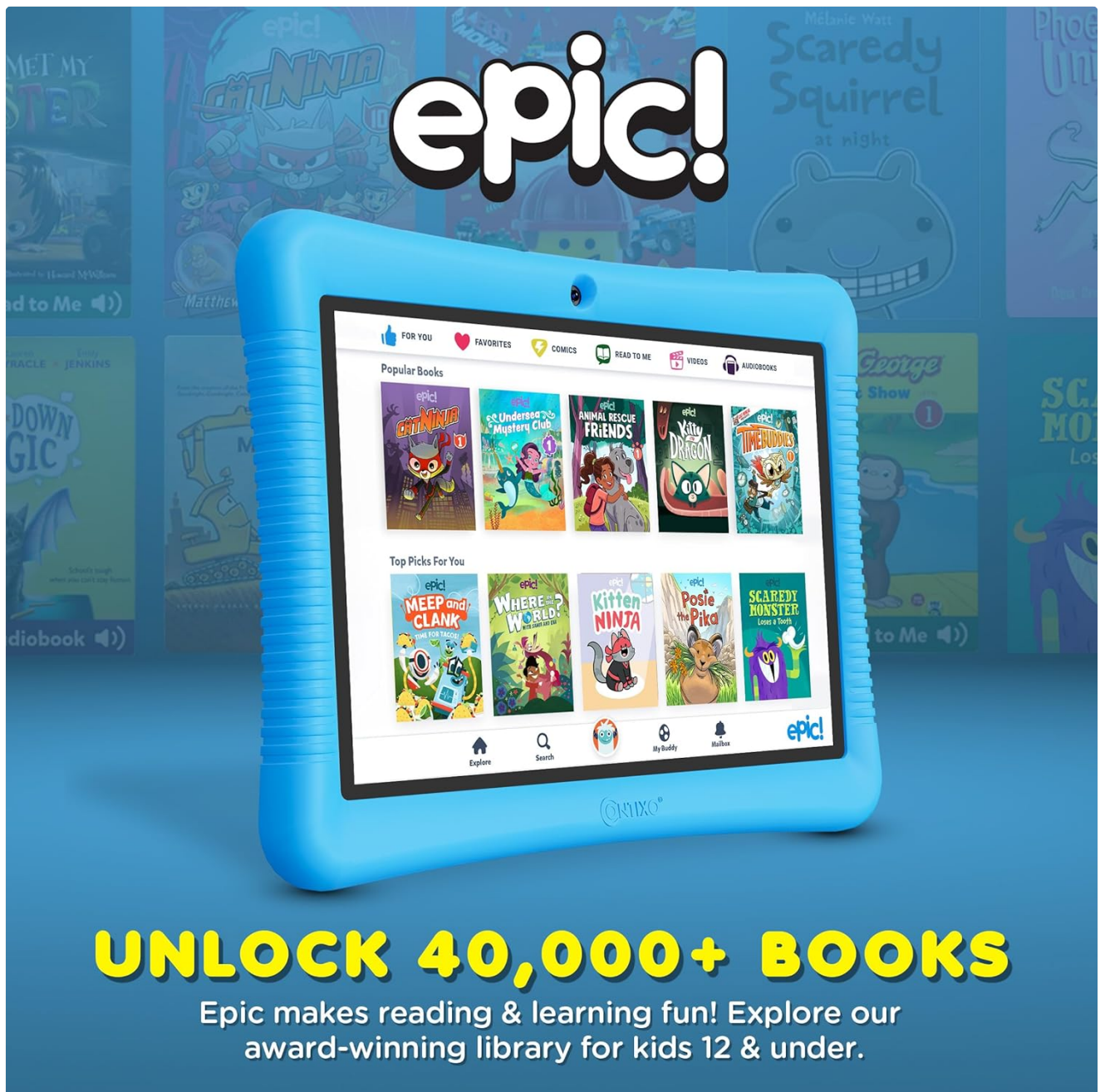
Figure 4: The tablet screen displaying the Epic! app, providing access to a library of over 40,000 books.