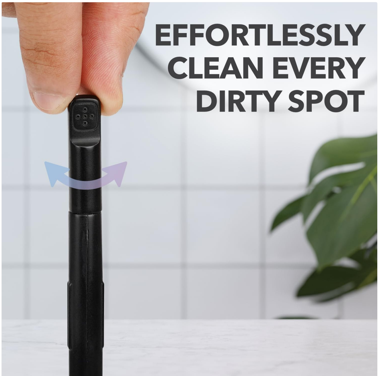
Figure 5: Two water pressure options: Soft and Strong.

This image illustrates the two distinct water pressure settings available on the BLAUX Portable Bidet: a softer flow for sensitive areas and a stronger flow for more thorough cleaning.