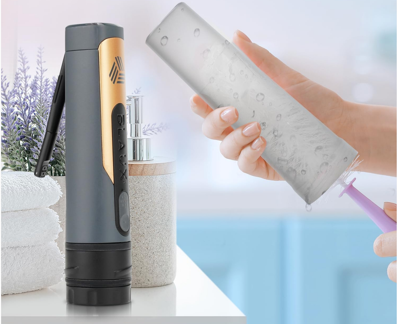
Figure 1: Included components of the BLAUX Portable Electric Handheld Bidet.

This image displays all items included in your BLAUX Portable Electric Handheld Bidet package: the main bidet unit, the detachable water tank, the magnetic charging cable, three identification color rings, and the instruction manual.