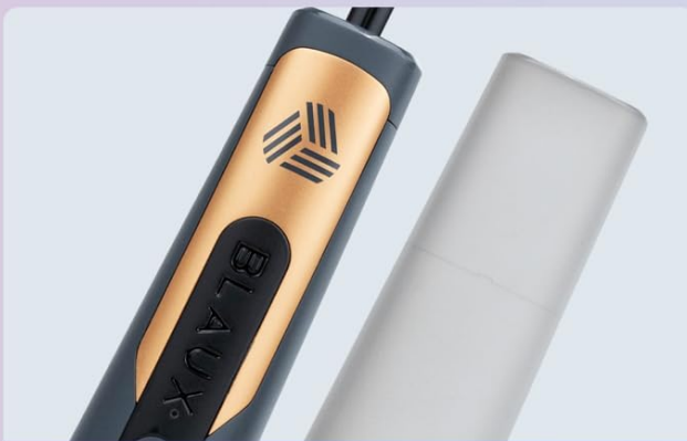
Non-slip Premium Material