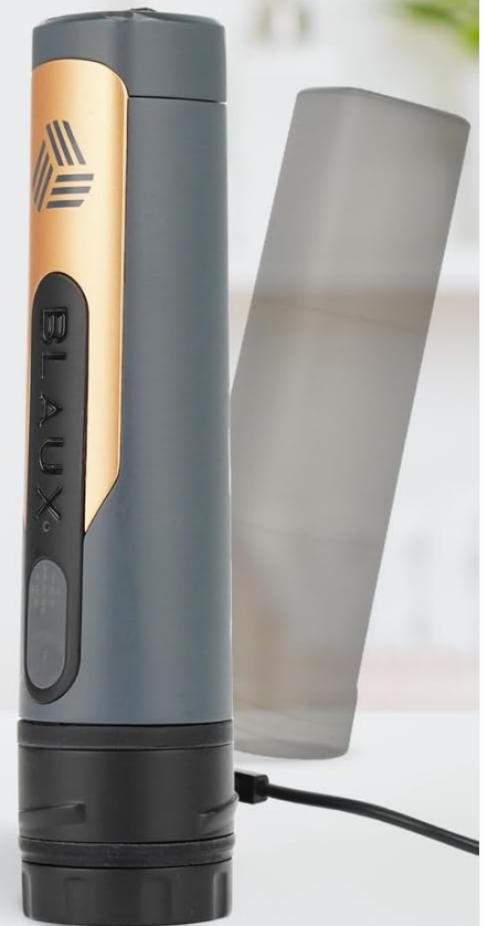
Figure 7: Cleaning the water tank.

This image demonstrates the ease of cleaning the detachable water tank of the BLAUX Portable Bidet using a small brush.