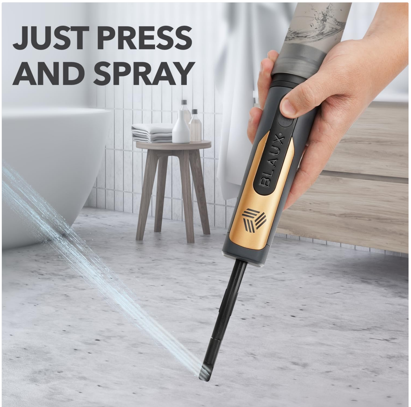
Figure 4: Activating the bidet for use.

This image shows the BLAUX Portable Bidet in action, with a hand pressing the button to initiate the water spray, emphasizing its ease of use.