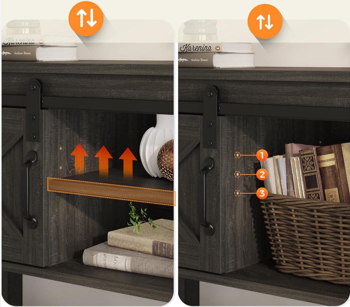
Image: A closer look at the adjustable shelf mechanism, illustrating its three possible height settings.