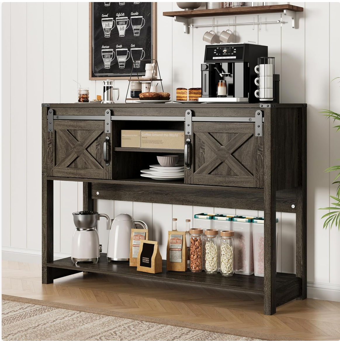
Image: The RoyalCraft Console Table, showcasing its design and functionality in a home environment.