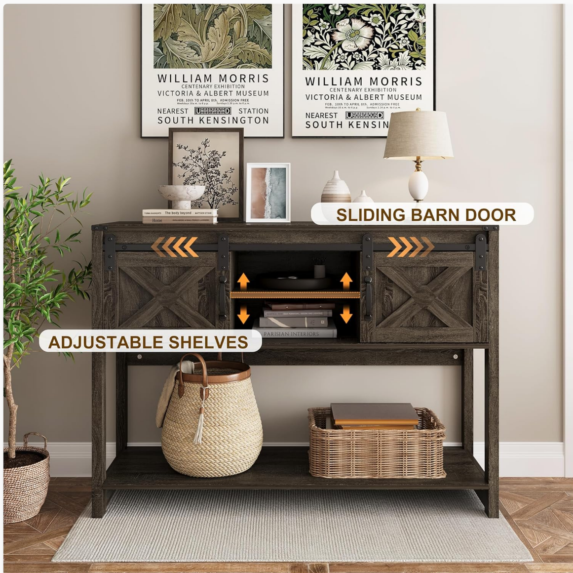
Image: Visual representation of the sliding barn doors and the adjustable shelf feature.