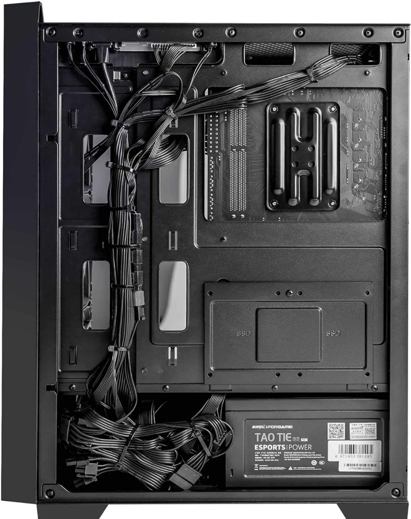
Image 4.1: Internal view highlighting cable management and storage bays.

Periodically review and manage your 1TB M.2 NVMe SSD storage. Delete unnecessary files, uninstall unused programs, and consider using cloud storage for large files to optimize system performance.