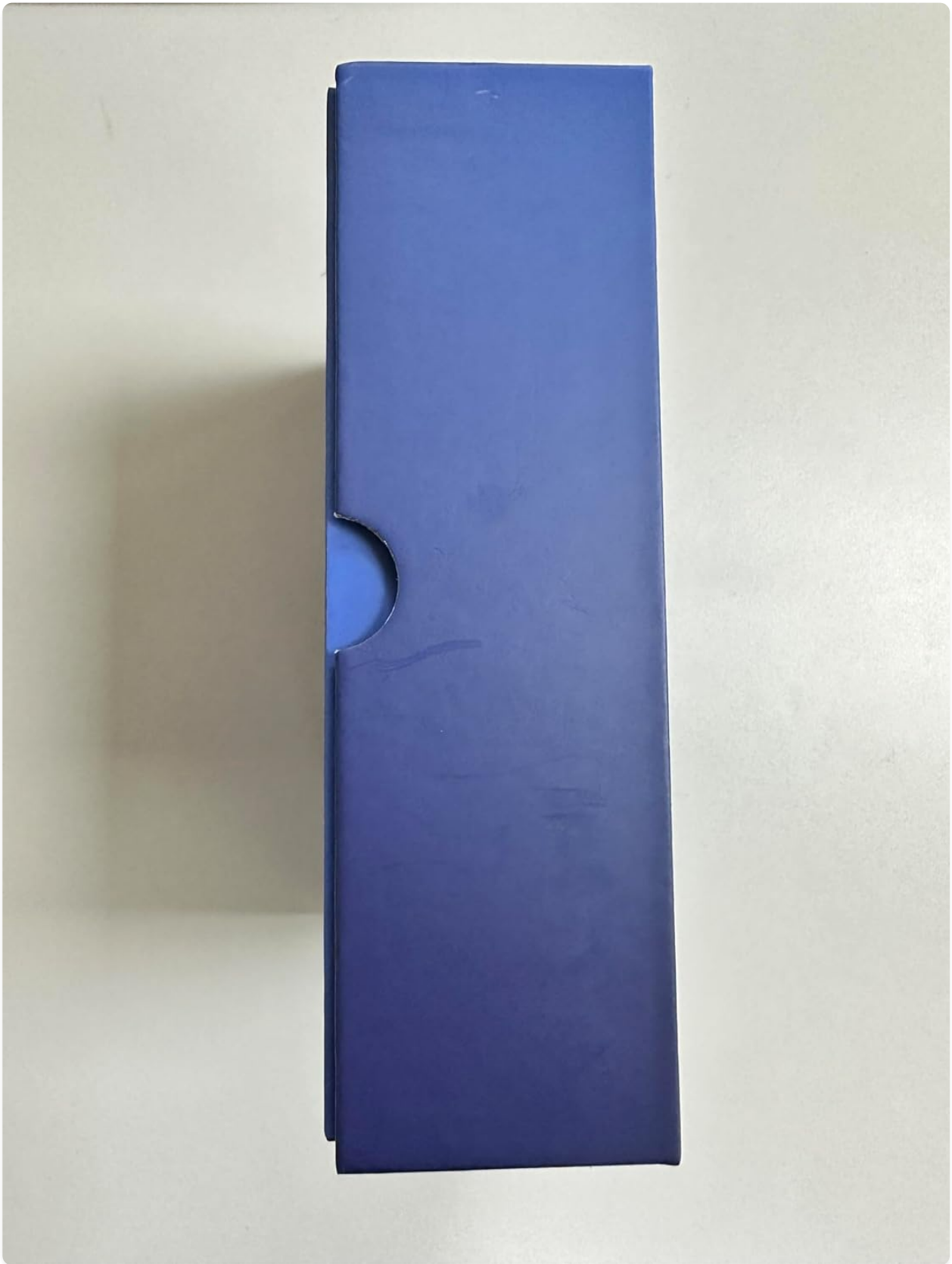
Image: The device highlighting the one-button protection feature.