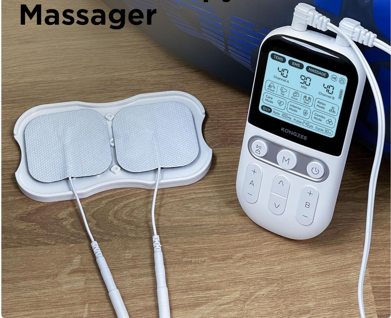
Image: The portable electrotherapy massager unit with electrode pads and wires.