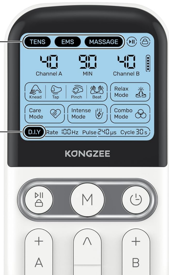
Image: Close-up of the device screen highlighting the TENS, EMS, Massage, and D.I.Y modes.

The users can customize rate, pulse and cycle to their preferences for an effective, comfortable and personalized massage experience.