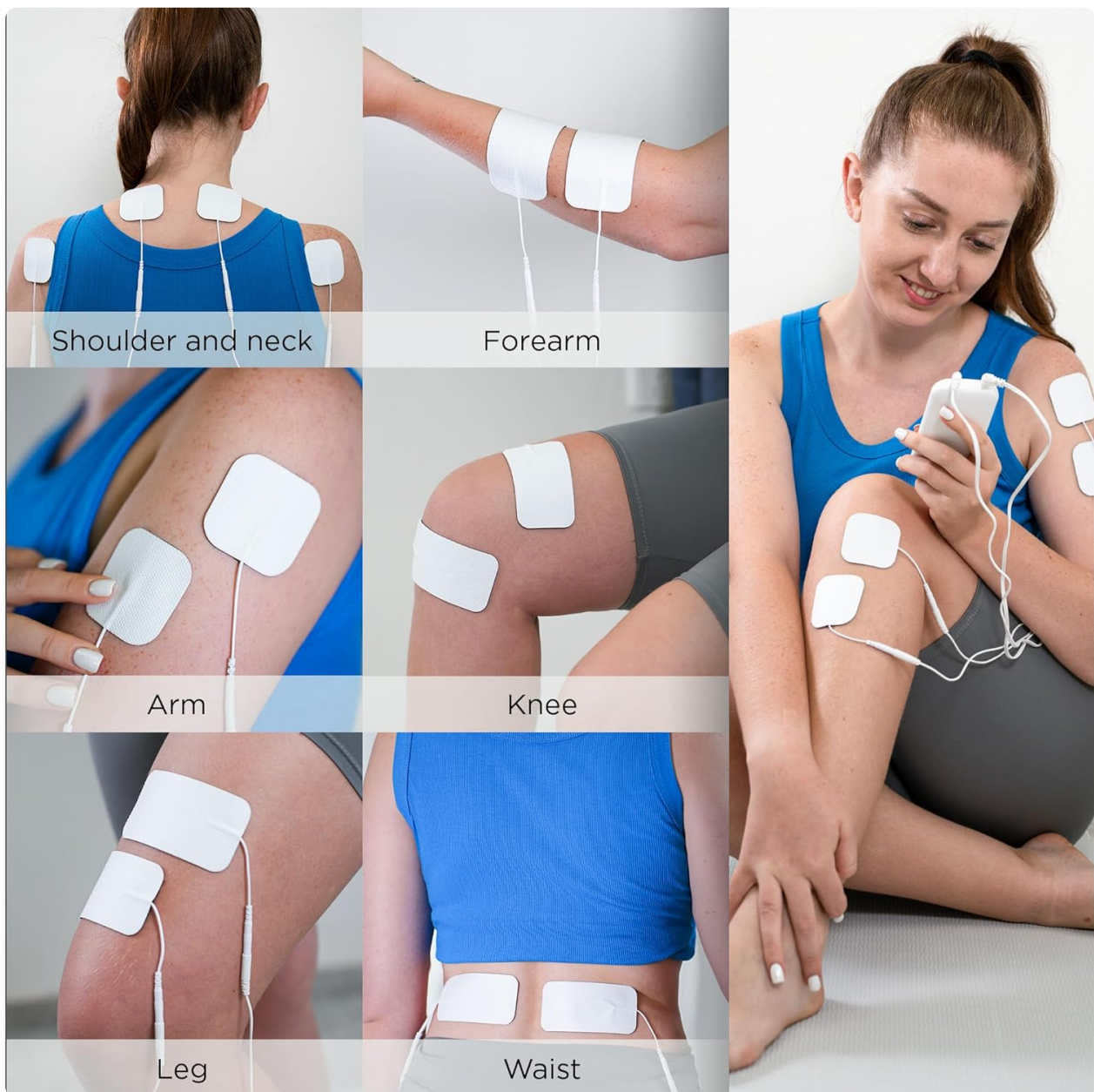
Image: Visual guide for electrode pad placement on different body areas including shoulder, forearm, arm, knee, leg, and waist.