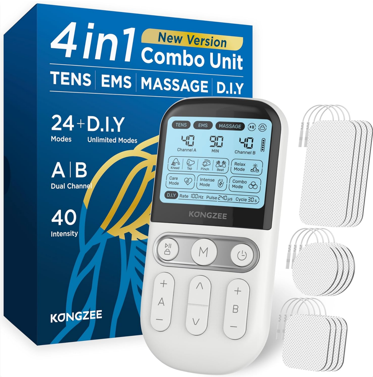
Image: The Kongzee 4-in-1 Muscle Stimulator with its packaging and electrode pads.