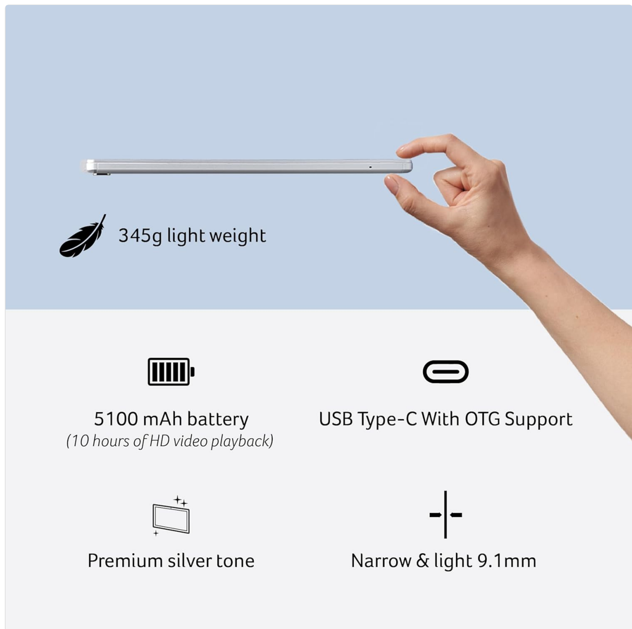
Figure 5.4: The tablet features a 5100 mAh battery, USB Type-C with OTG support, a lightweight design at 345g, and a narrow 9.1mm profile with a premium silver tone finish.