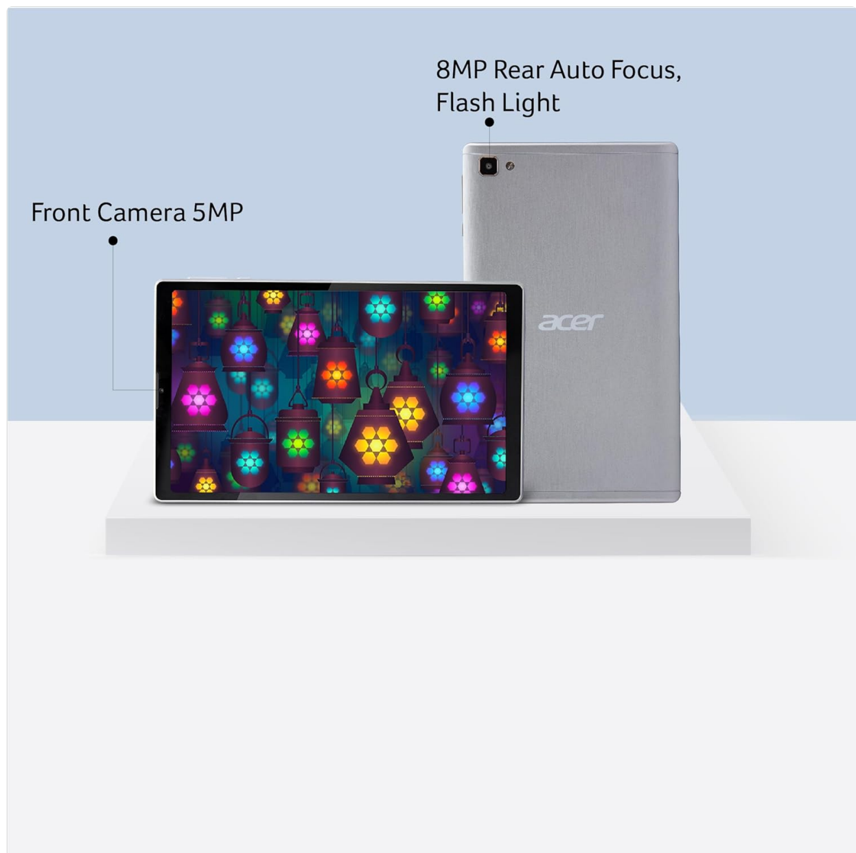
Figure 5.2: The tablet features a 5MP front camera and an 8MP rear camera with auto-focus and flash light for capturing photos and videos.