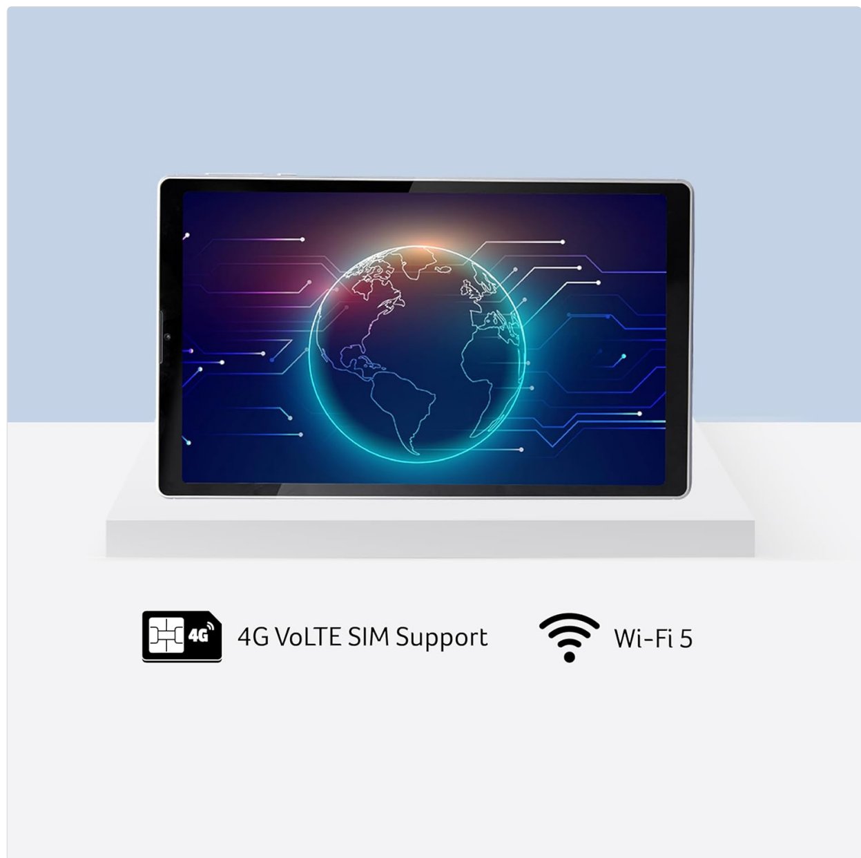
Figure 3.4: Overview of key features including Android 13, 4GB RAM, 64GB internal memory, up to 1TB expandable storage, 4G VoLTE SIM support, MediaTek Octa-core MTK8768 processor, 8.7-inch IPS display, 5100 mAh battery, USB Type-C, Wi-Fi 5, 8MP rear camera, 5MP front camera, and premium silver tone design.