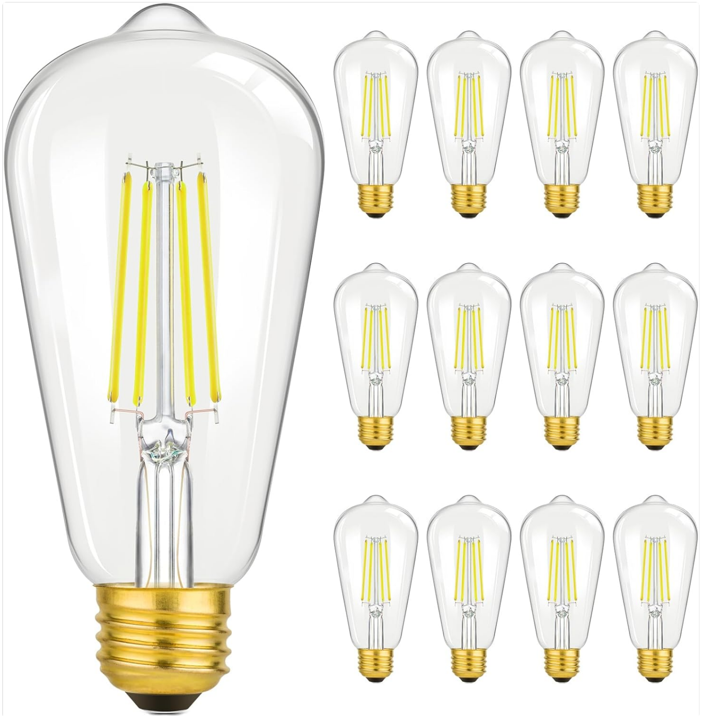
Image: Brightever ST64 LED Edison Bulb and 12-pack. These bulbs feature a clear glass design with visible LED filaments, resembling traditional Edison bulbs.