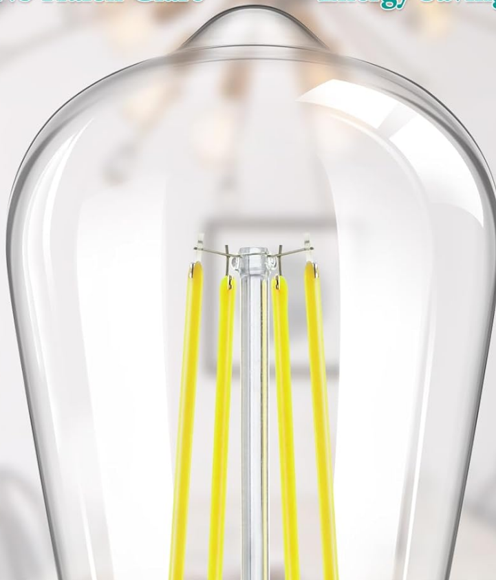
Image: Visual representation of the bulb's features including energy saving, high brightness, and eye-friendly design.