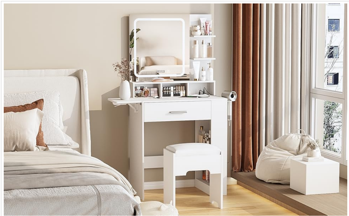
Image: Fully assembled Fameill Vanity Desk in a bedroom, showcasing its design and features.