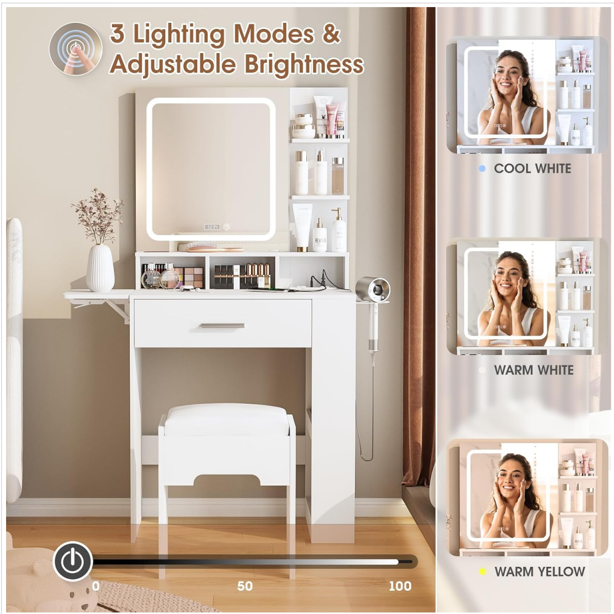
Image: Visual representation of the three adjustable lighting modes (Cool White, Warm White, Warm Yellow) and brightness control for the mirror.

Your browser does not support the video tag.