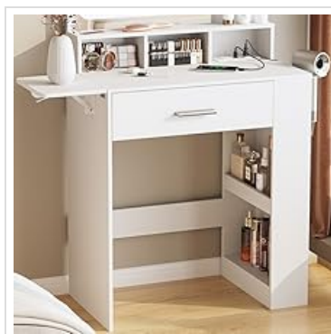
Image: Detail of the integrated charging station with two plug sockets and two USB ports.