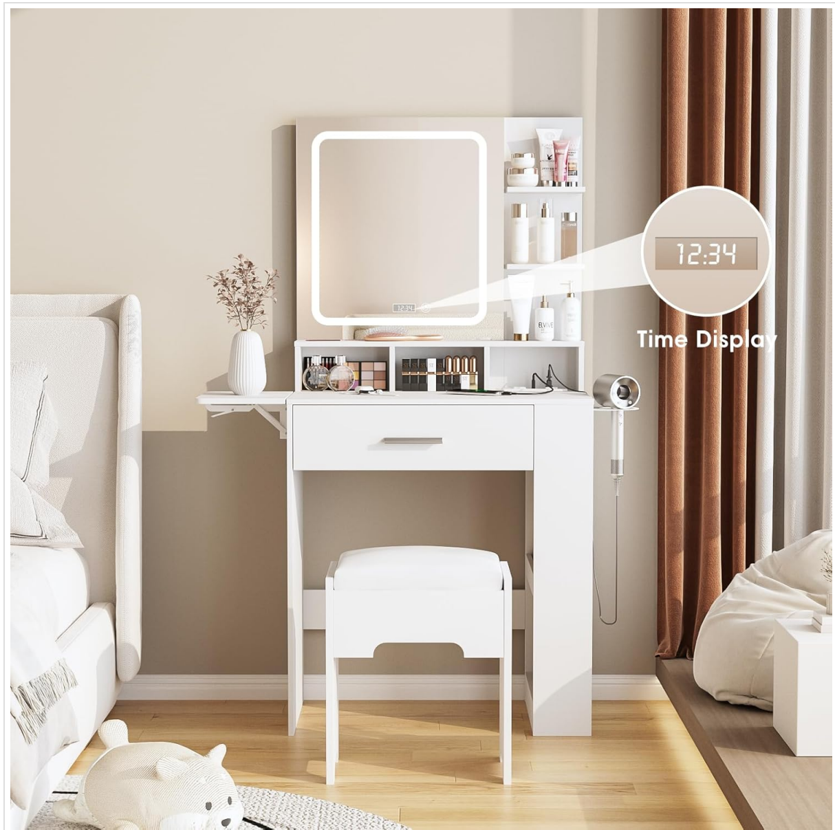
Image: The mirror's integrated time display and touch-sensitive power button for the LED lights.