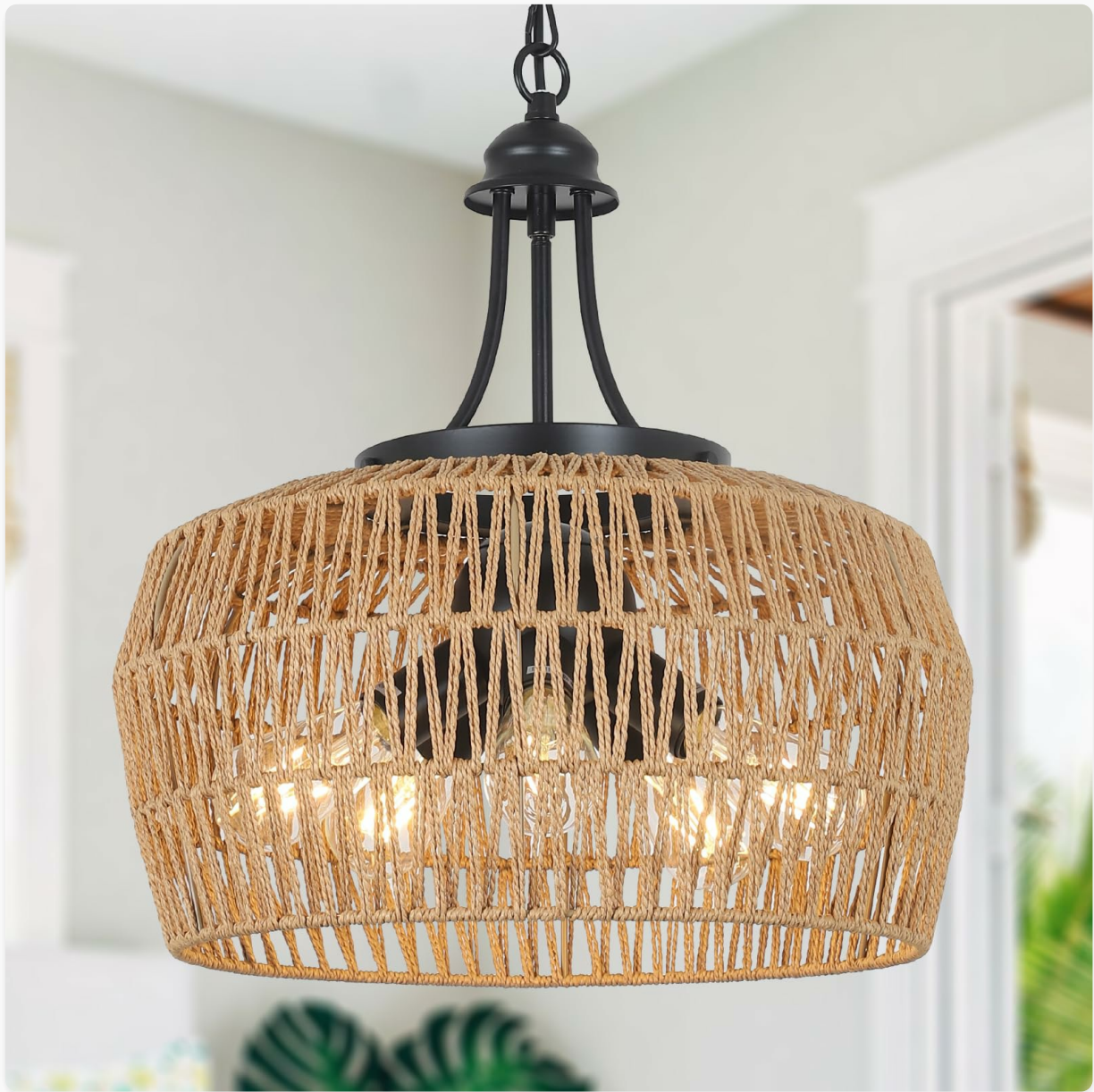
Image 1: The HMVPL 5-Light Rattan Farmhouse Chandelier in a dining room setting.