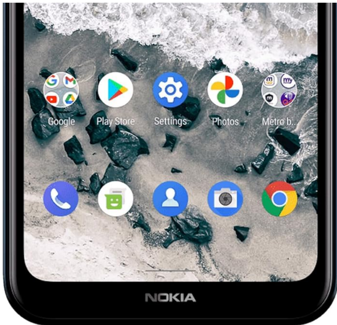
Figure 3: Nokia X100 home screen with various application icons.