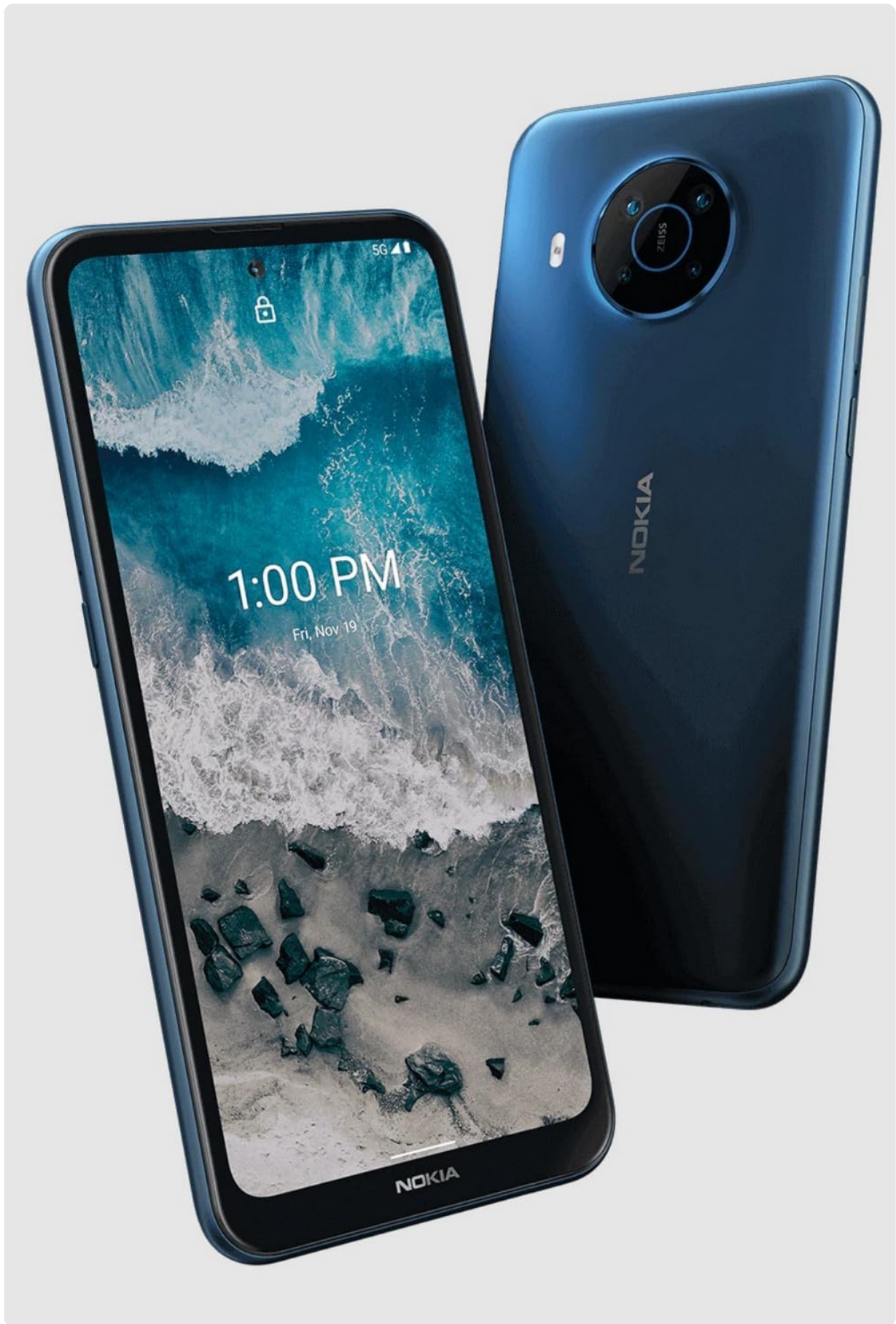
Figure 1: Nokia X100 5G Smartphone, showcasing its sleek design and Midnight Blue finish.

Please read this manual carefully to ensure proper use and to maximize the features of your Nokia X100.