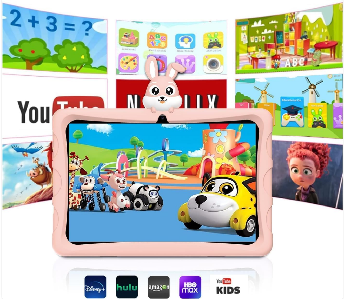
Image 6.3: Widevine L1 support enables high-quality streaming from popular services.