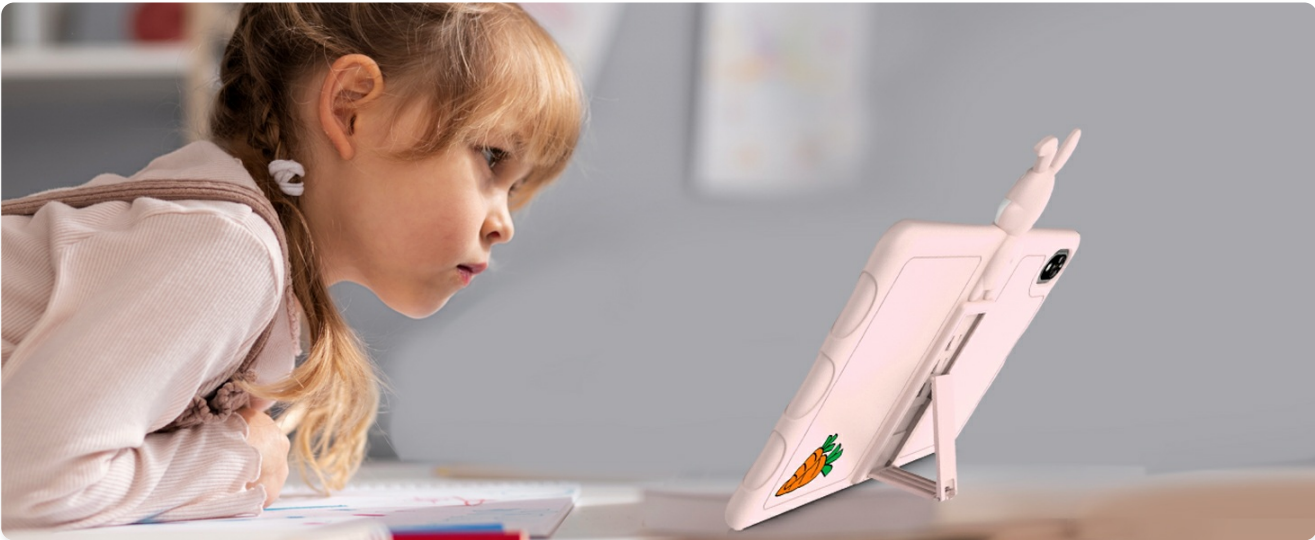
Image 9.1: The tablet's memory and storage capabilities for smooth performance.