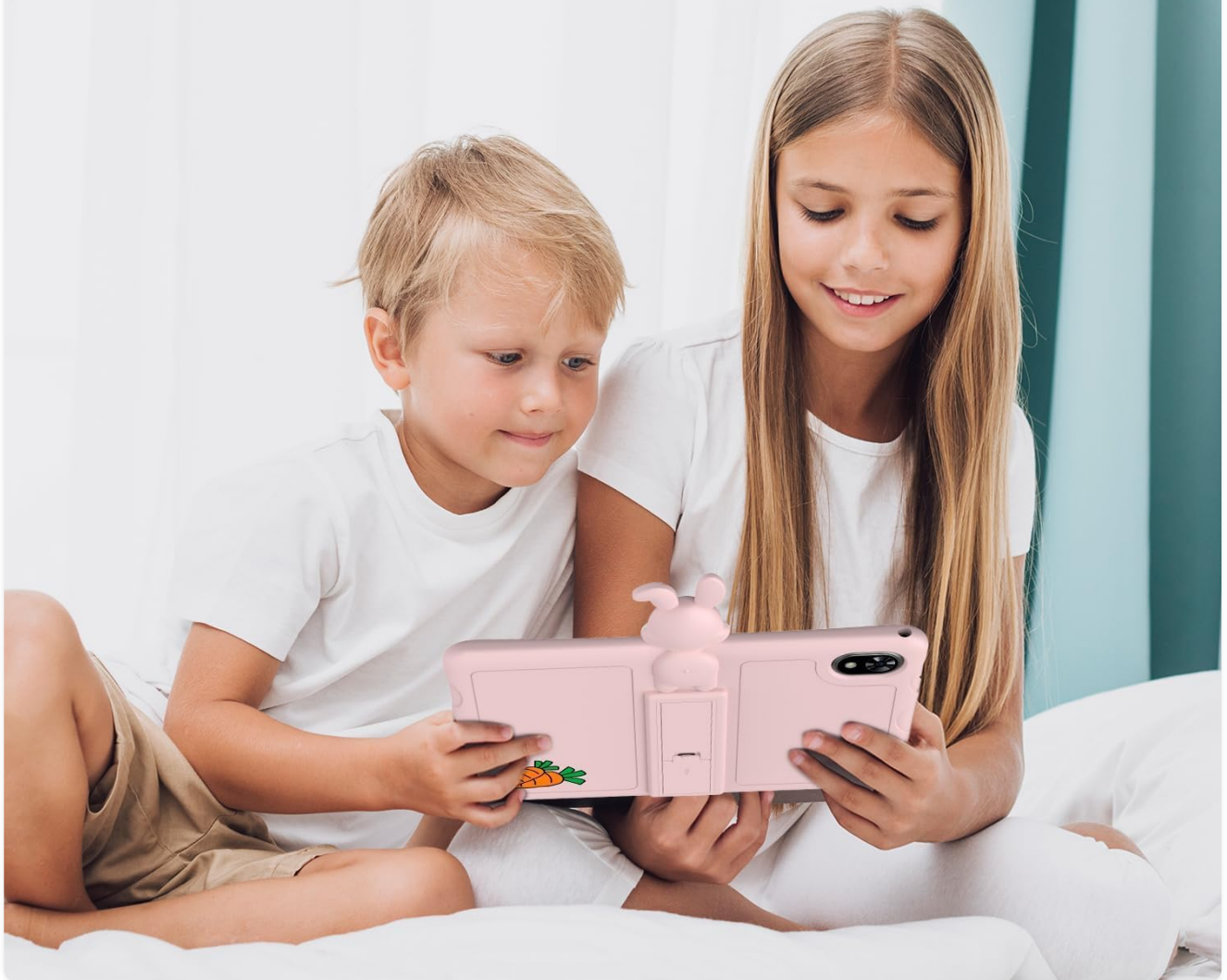
Image 4.1: Children enjoying the DOOGEE U9 Kid Tablet, illustrating its key features.