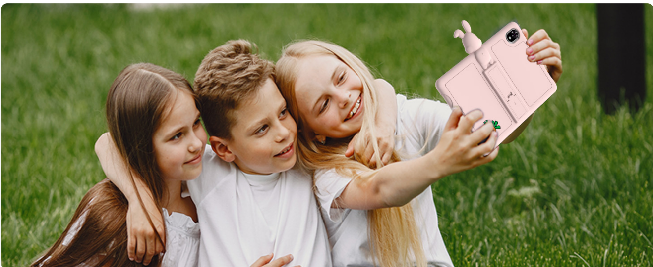
Image 6.2: A wide range of free learning applications are available for children.