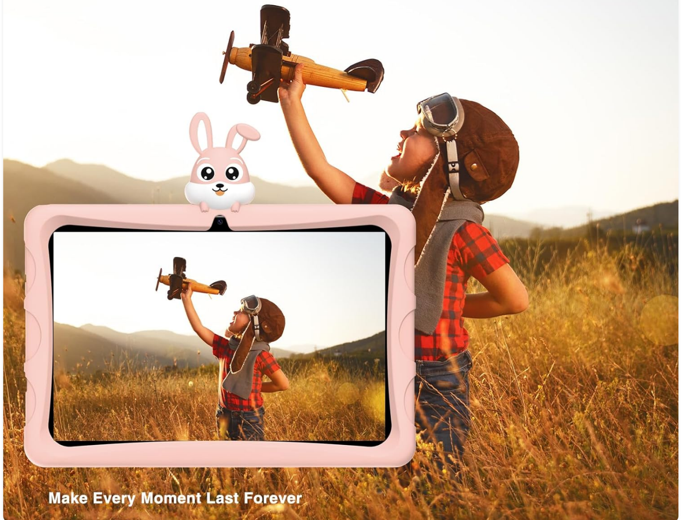
Image 4.2: The tablet's dual camera system, suitable for capturing memories.