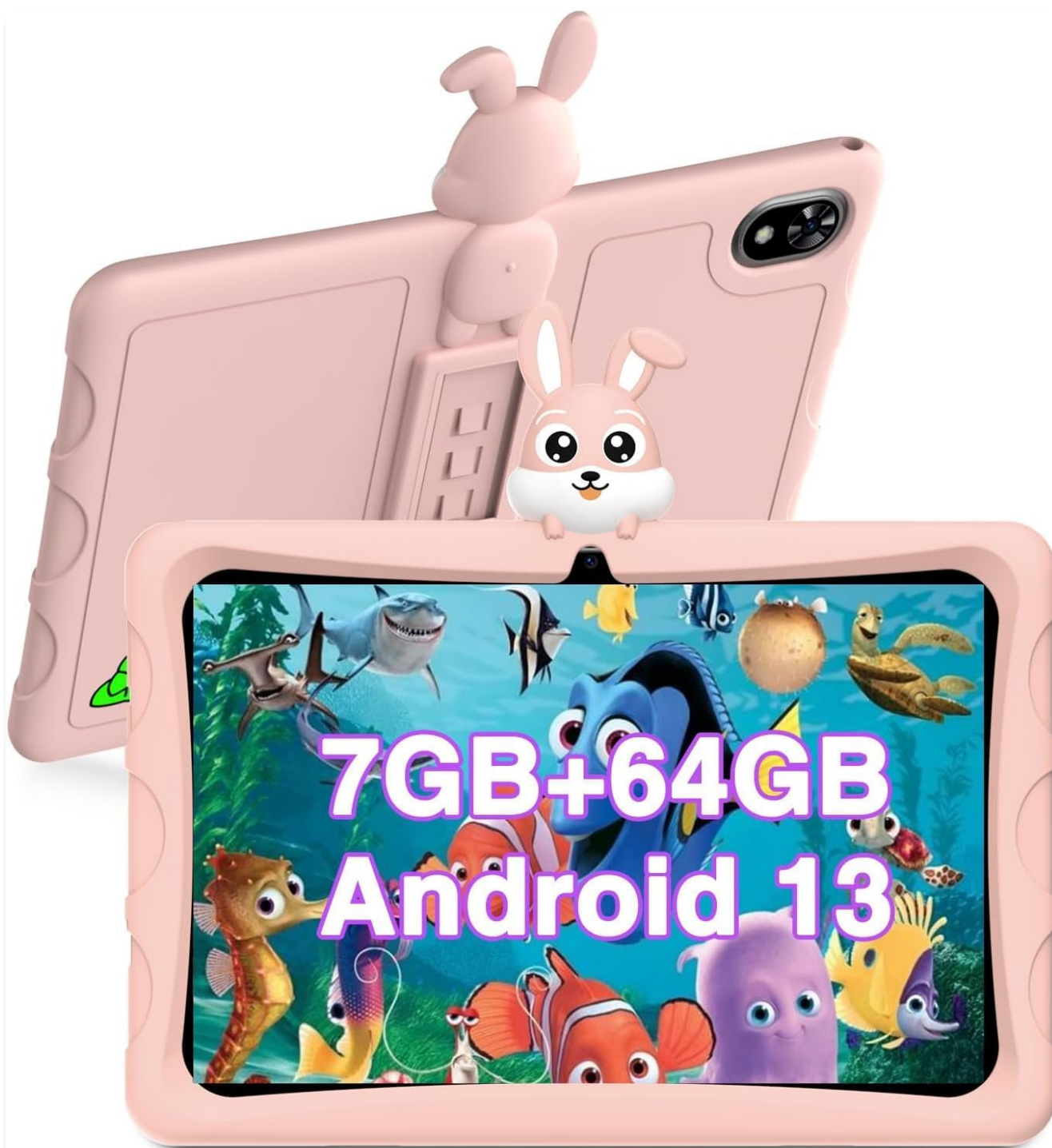
Image 1.1: The DOOGEE U9 Kid Tablet, showcasing its protective pink case with a bunny-shaped stand and a colorful display.