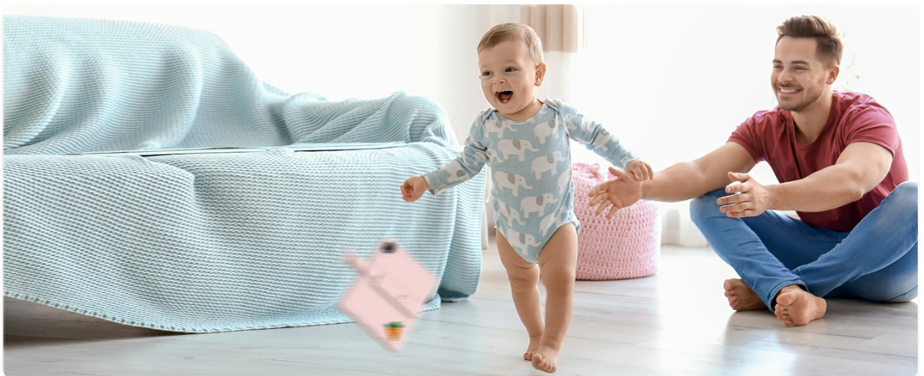
Image 4.3: Highlighting the tablet's 10.1-inch IPS HD display for clear visuals.