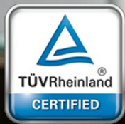
Image 4.4: The tablet's eye protection features, certified by TÜV Rheinland.