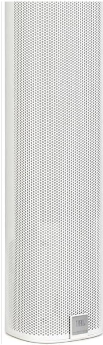
Figure 1: Front view of the JBL Professional COL800WH Slim Column Speaker.