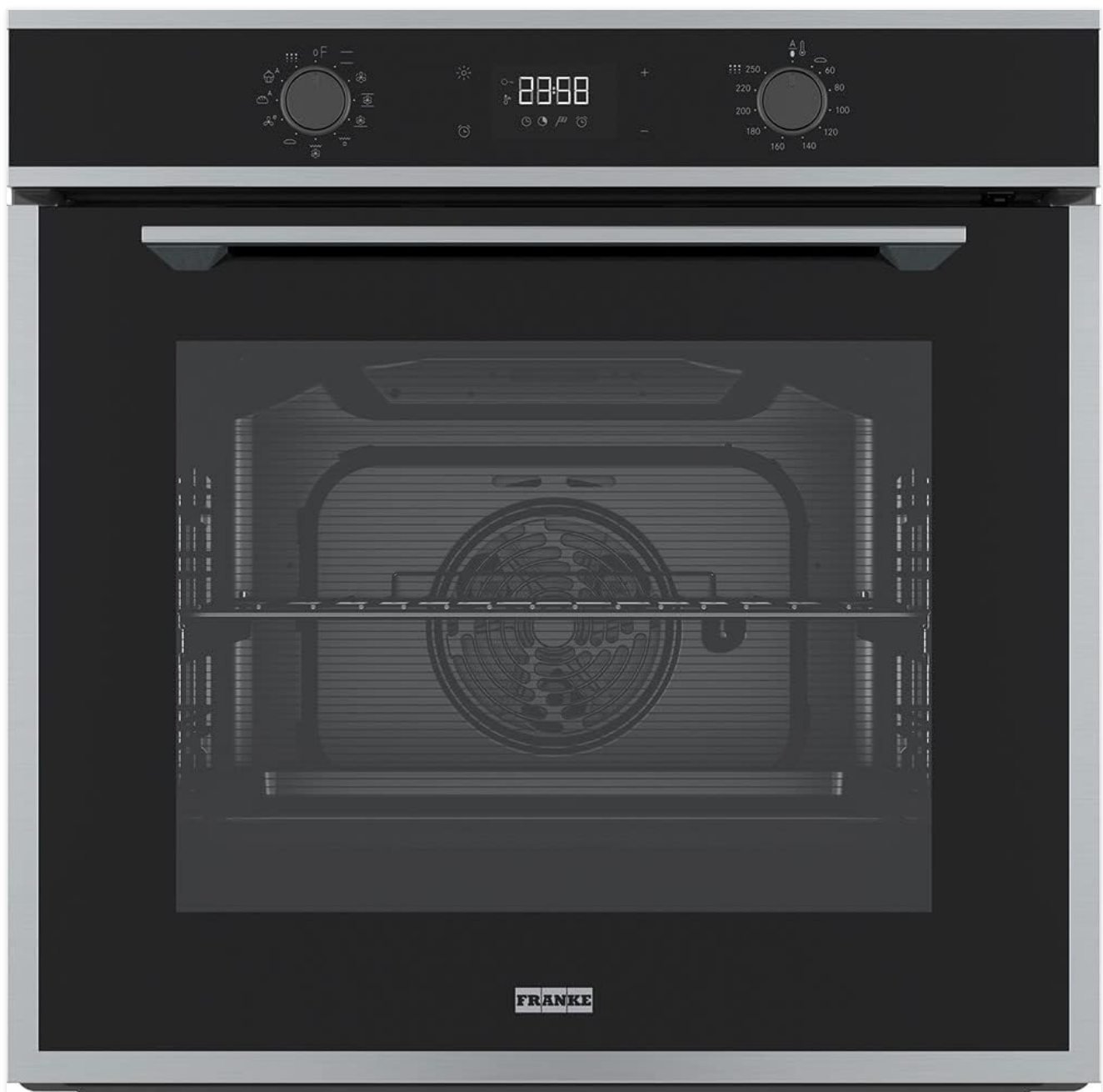
Figure 1: Front view of the Franke FMA 97 P XS electric oven. This image displays the oven's sleek black and stainless steel exterior, the digital display, and the control knobs. The interior cavity with the heating element and rack is also visible through the glass door.