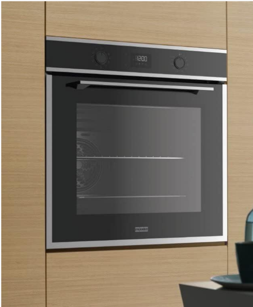
Figure 2: The Franke FMA 97 P XS oven seamlessly integrated into a kitchen cabinet. This image demonstrates the aesthetic appeal and typical placement of the built-in appliance within a kitchen environment.