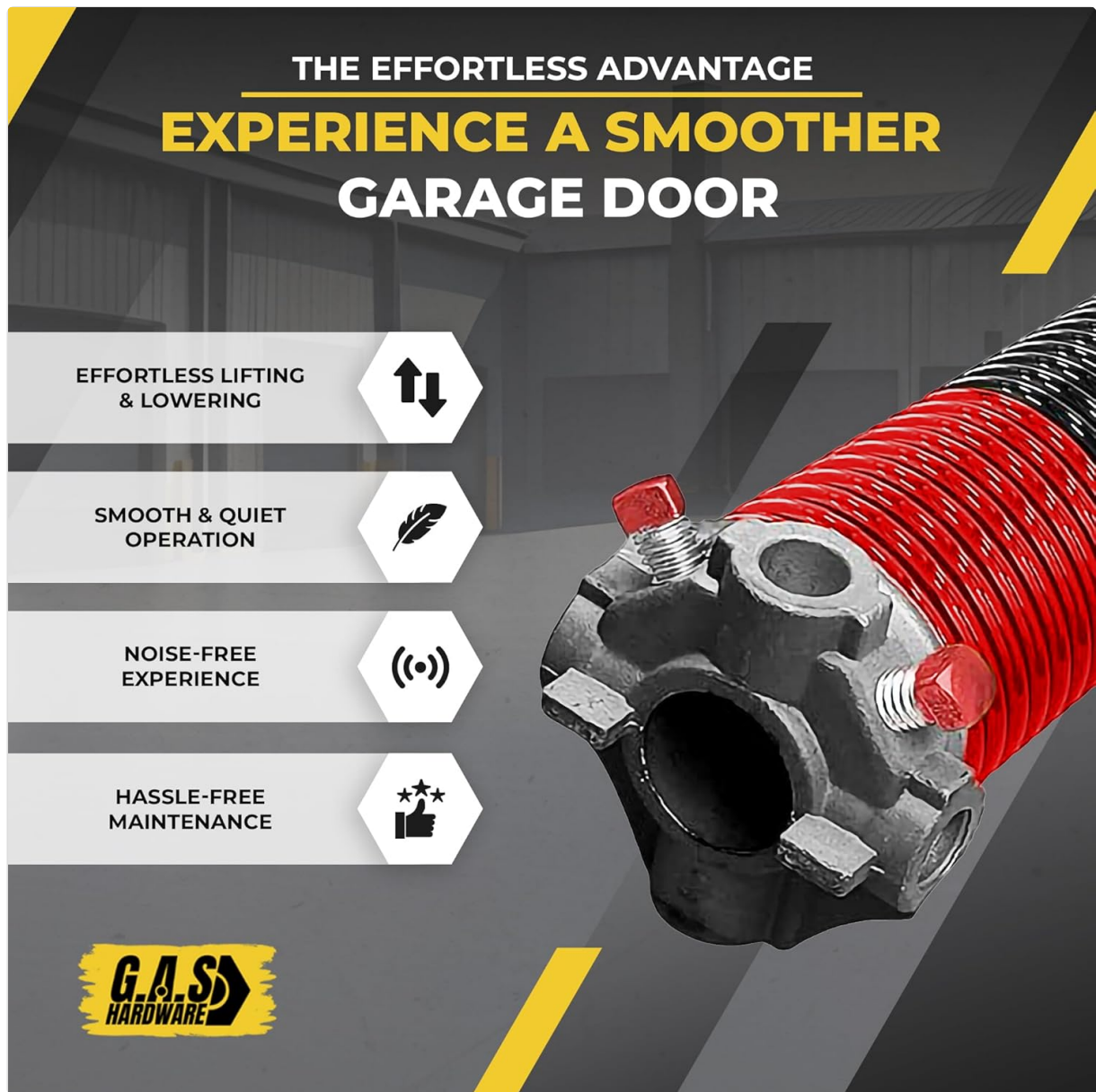
Image 5.1: Benefits of a properly functioning torsion spring system.