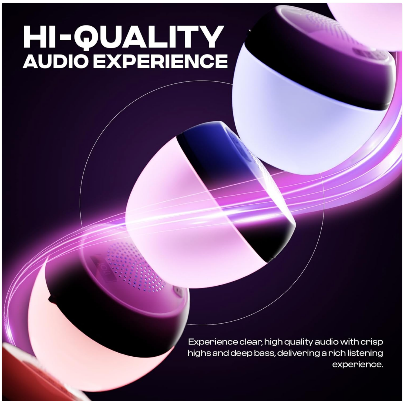
Figure 3.4: Visual representation of the iJoy SoundWave's high-quality audio experience.

This image features multiple iJoy SoundWave speakers with vibrant light effects, accompanied by text emphasizing a "Hi-Quality Audio Experience," visually representing the speaker's superior sound output.