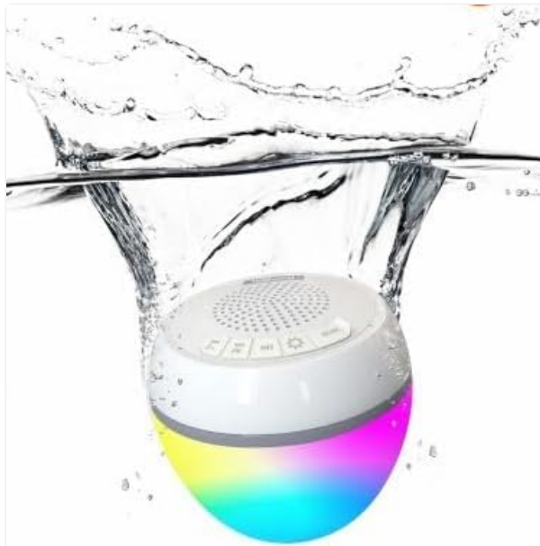
Figure 5.1: The iJoy SoundWave speaker submerged in water, showcasing its vibrant LED lights.

This image captures the iJoy SoundWave speaker partially submerged in water, with its base emitting a spectrum of colorful LED lights, demonstrating its waterproof feature and visual appeal.