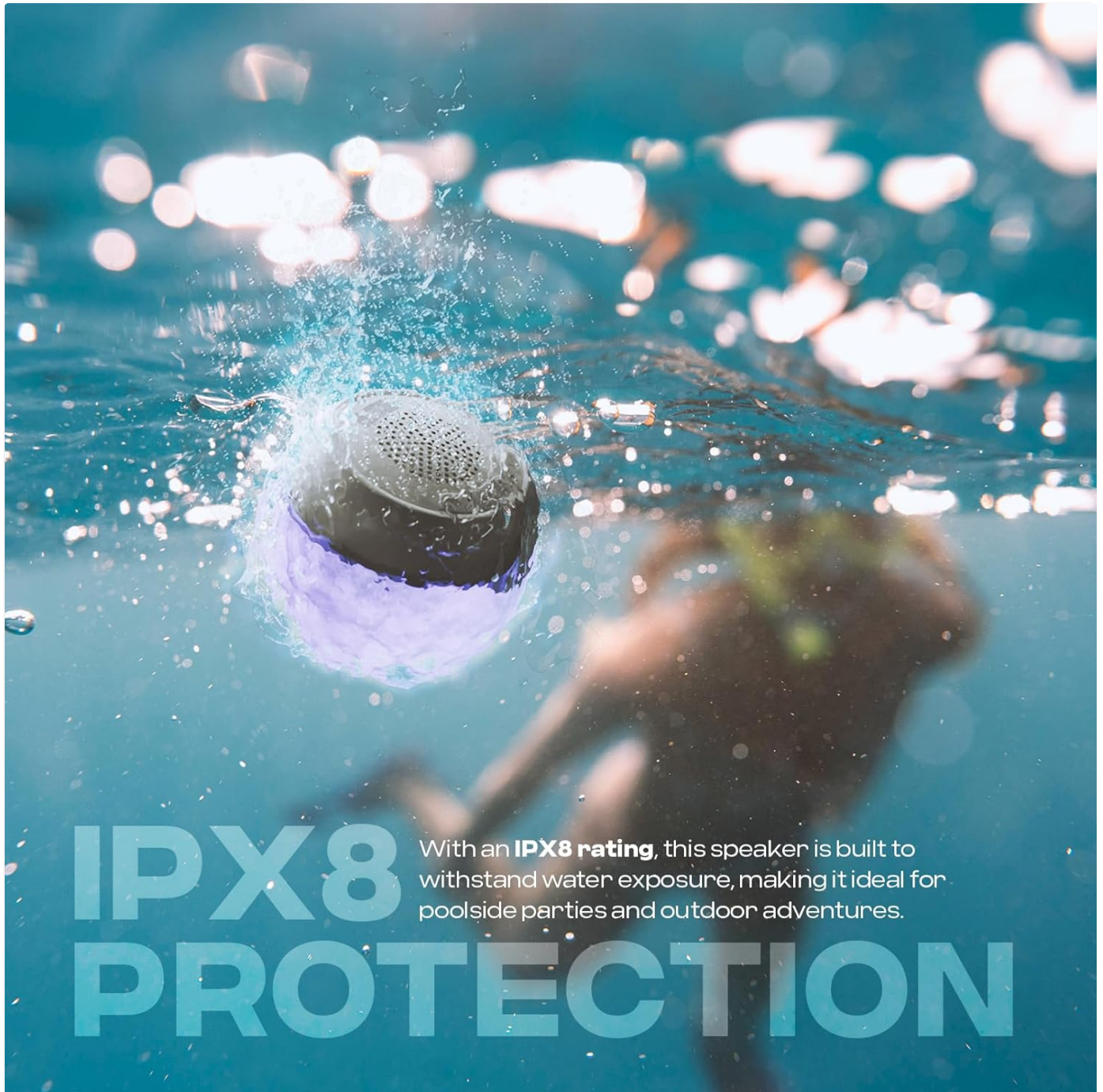
Figure 3.2: The iJoy SoundWave speaker demonstrating its IPX8 waterproof protection underwater.

This image shows the iJoy SoundWave speaker fully submerged in water, with text emphasizing its IPX8 protection, illustrating its capability to withstand water exposure.