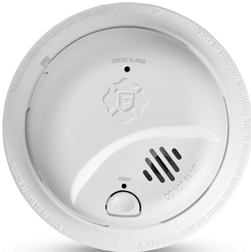
Image: Front view of the First Alert SMI105-AC smoke alarm, highlighting the 10-year battery backup feature.