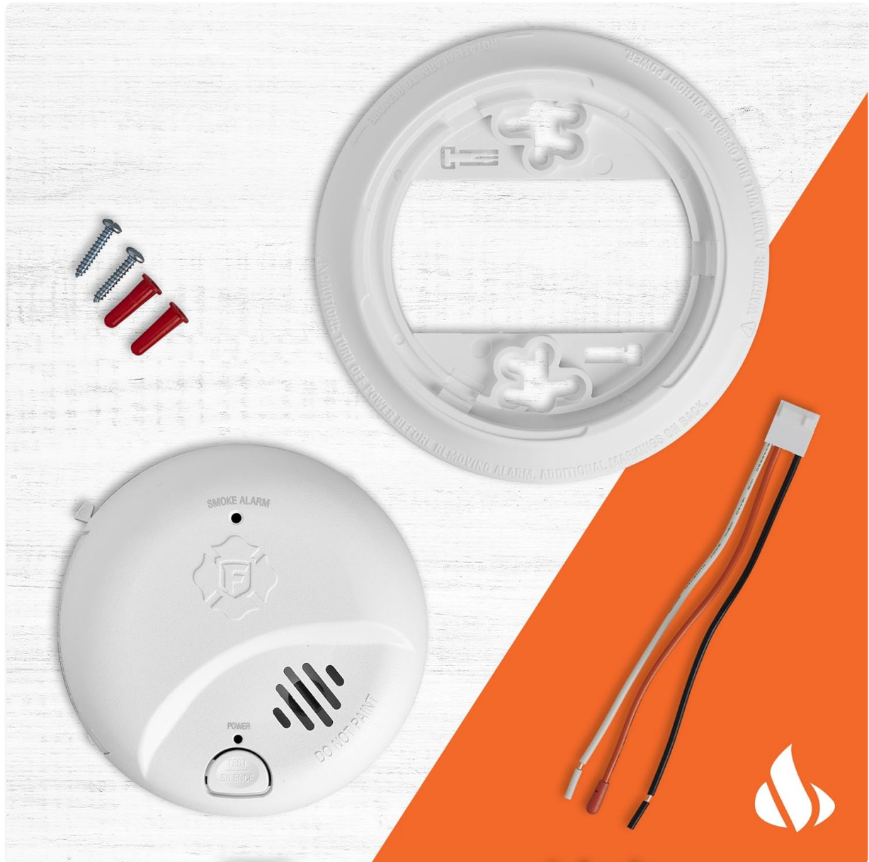
Image: The smoke alarm unit, mounting bracket, wire harness, and screws included in the package.