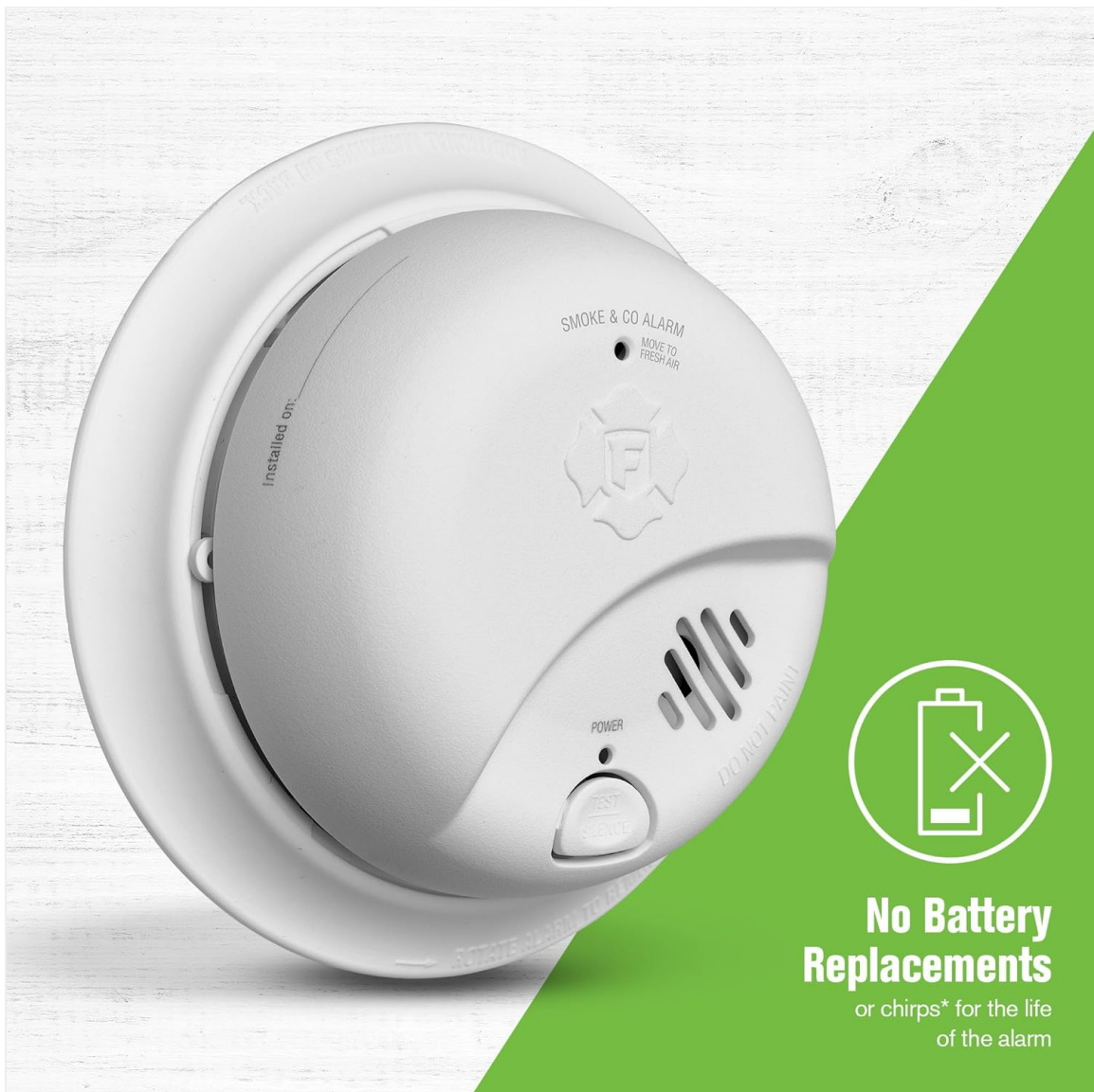
Image: Front view of the alarm.