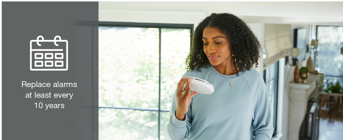
Image: Regular testing of the alarm.