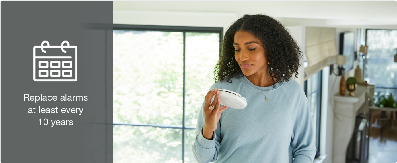
It is essential to replace your combination smoke and carbon monoxide alarms at least every 10 years for continued protection.

After approximately 10 years of operation, the alarm will emit an end-of-life signal (a chirp every 30-40 seconds, accompanied by a voice announcement "Replace Alarm"). This indicates that the unit has reached the end of its useful life and must be replaced immediately. Do not attempt to disable or repair the alarm.